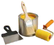
Paints & Putty