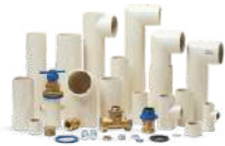
Pipes & Plumbing