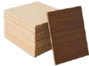
Ply & Wooden Mica