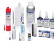
Adhesives & Chemicals