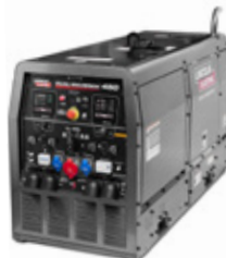
Lincoln Welding Generator