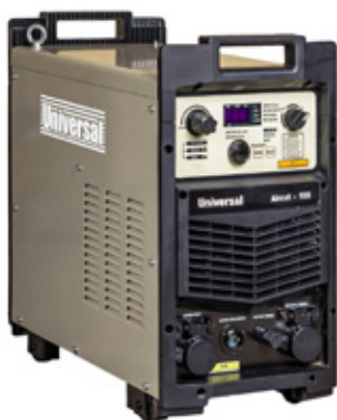
Plasma Cutting Machine