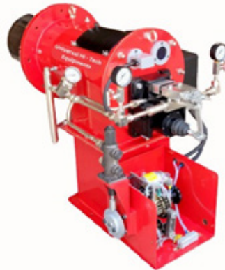
Oil and Gas Firing Unit