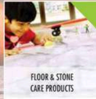
FLOOR & STONE CARE PRODUCTS

Ensure a successful installation each and every time with the most comprehensive assortment of innovative tile and stone installation materials available worldwide. LATICRETE® industry-leading products provide complete system solutions from the substrate up through the grout for virtually any type of tile or stone installation in commercial, industrial, and residential applications.