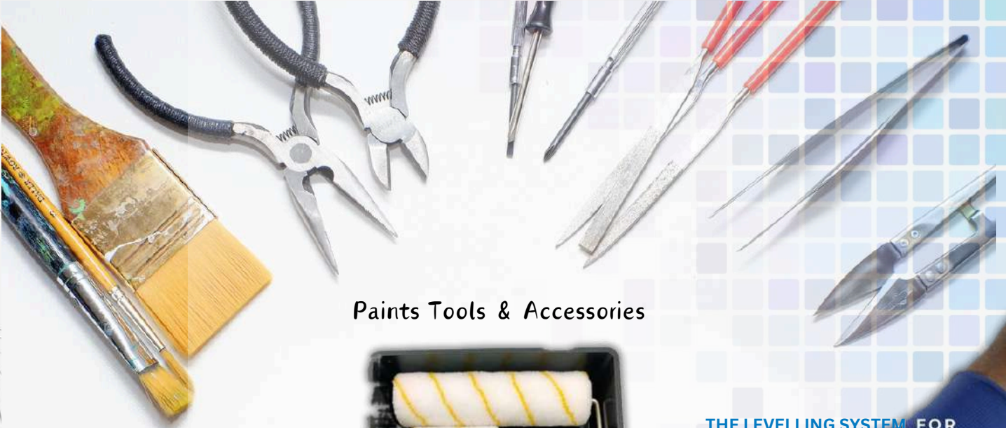
Paints Tools & Accessories