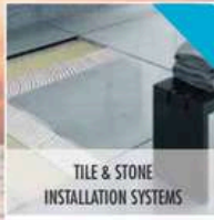
TILE & STONE INSTALLATION SYSTEMS

For over 60 years, LATICRETE® has led the industry with pioneering advancements—developing high-performance building materials for architects and construction professionals worldwide. From time-tested to ground-breaking, our broad product portfolio provides superior quality and value. We are fully committed to innovation, growth, and a complete system component approach.