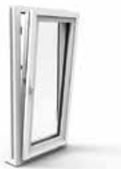
Tilt and turn Windows & Doors

We produce UPVC Doors and Windows such as :