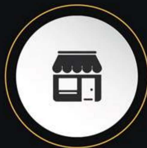
Non Food Retail Outlets