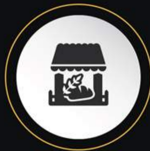
Bakery & Pastry Store