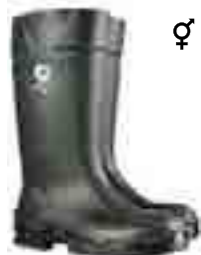
TITAN // S5 CI SRC Art. Nr. 59.088.0