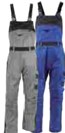
PROFI LINE // Art. Nr. 28.637.0