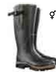
FOREST ISO // Art. Nr. 57.553.0