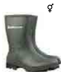
THE RANCHER // Art. Nr. 59.308.0