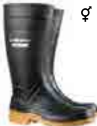
GUARDIAN HIGH BLACK // Art. Nr. 56.403.0