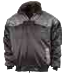
ALLROUNDER // Art. Nr. 27.200.0 Viele weitere Farben!