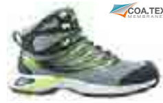
SENSA GREEN CTX WNS MID WORK & HIKE LDS // O2 WR HRO SRC Art. Nr. 67.255.0