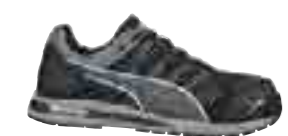
64.316.0 ELEVATE KNIT BLACK LOW S1P ESD HRO SRC