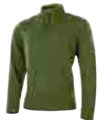
FITTER // Art. Nr. 26.011.0