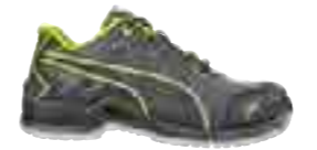
64.410.0 FUSE TC GREEN WNS LOW S1P ESD SRC