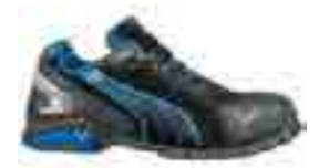
64.275.0 RIO BLACK LOW S3 SRC