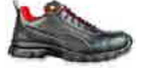
64.052.1 CONDOR BLACK LOW S3 ESD SRC