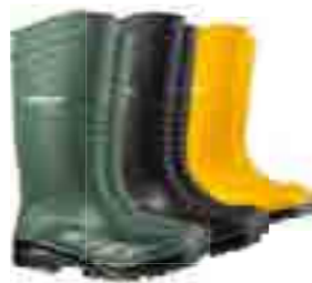
PROTECTOR PLUS // S5 SRC Art. Nr. 59.025.0