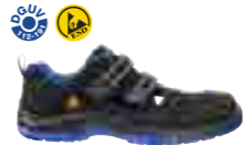
BLUETECH AIR LOW PROFI LINE CSL // S1P ESD SRC Art. Nr. 64.111.0