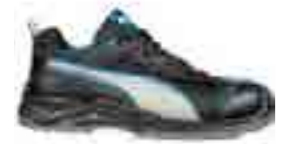
64.360.0 BORNEO BLACK LOW S3 SRC