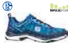
SKYRUNNER BLUE S04 LOW WORK & HIKE XTS // O1 HRO SRC Art. Nr. 65.456.0