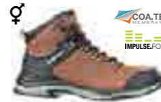
ISCHGL CTX MID WORK & HIKE XTS // O2 WR HRO SRC Art. Nr. 67.758.0