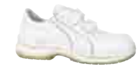
64.064.2 ABSOLUTE LOW S2 SRC