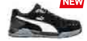
64.465.0 AIRTWIST BLACK LOW S3 ESD HRO SRC