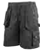
ALLROUND BLACK // Art. Nr. 28.628.0