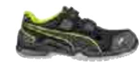
64.430.0 NEODYME GREEN LOW S1P ESD SRC