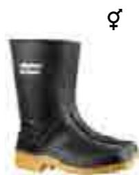
GUARDIAN MID BLACK // Art. Nr. 56.404.0