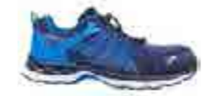
64.385.0 VELOCITY 2.0 BLUE LOW S1P ESD HRO SRC