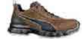
64.054.2 CONDOR BROWN LOW S3 ESD SRC