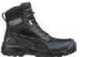
63.073.0 CONQUEST BLK CTX HIGH S3 WR HRO SRC