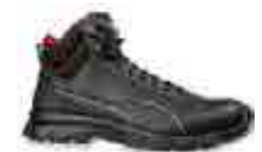
63.010.1 CONDOR BLACK MID S3 ESD SRC