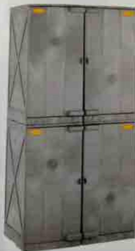
PE chemicals cabinet 10/20