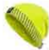
HIVIS THERMO // Art. Nr. 25.525.0