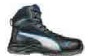
63.360.0 ATOMIC MID S3 SRC