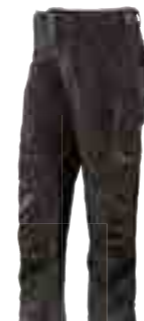
FREESTYLE SR // Art. Nr. 28.632.0