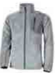
PILE // Art. Nr. 26.234.0