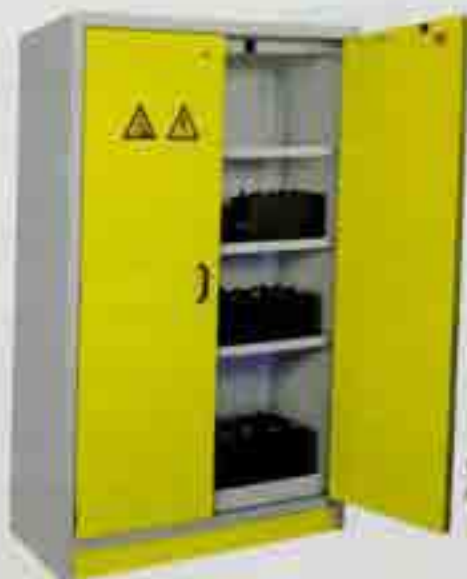
Battery secure cabinet 12/20

These fireproof secure cabinets are well suited to storing lithium batteries. The proven quality is reflected in the 90-minute fire resistance pursuant to DIN EN 14470-1 on both the outside and the inside. In addition, the cabinet's unique design using non-combustible materials provides good fire protection from both the inside and the outside, even in the event that the stored lithium batteries suddenly ignite. This period is normally sufficient until further action can be taken. The risk of the fire spreading and accelerating is significantly reduced with this cabinet and consequential damage to the environment is effectively reduced in the event of flame formation caused by the lithium batteries inside the cabinet.