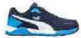
64.462.0 AIRTWIST BLUE LOW S3 ESD HRO SRC