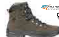
BONVIN CTX MID Art. Nr. 67.335.0