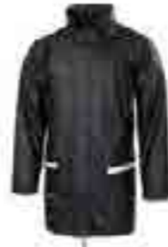
FORECAST JKT // Art. Nr. 27.450.0