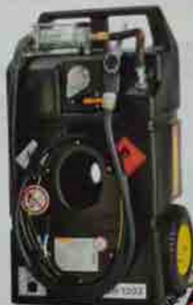
95 L, with hand pump