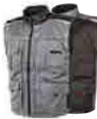
EDISON // Art. Nr. 27.931.0