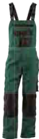
ALLROUND GREEN // Art. Nr. 28.630.0