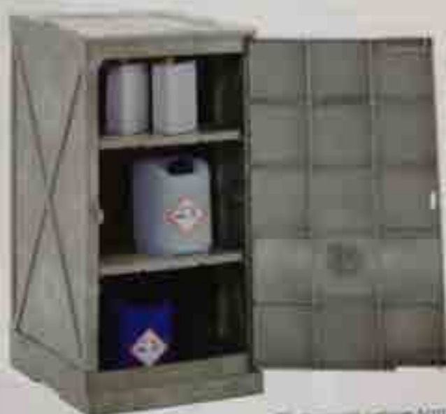
PE chemicals cabinet 5/10