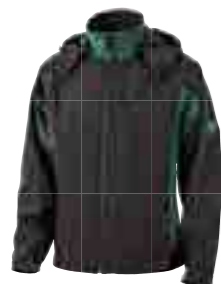
ALLROUND GREEN // Art. Nr. 26.435.0