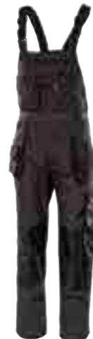
ALLROUND BLACK // Art. Nr. 28.626.0