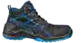
63.420.0 KRYPTON BLUE MID S3 ESD SRC