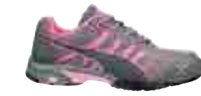
64.291.0 CELERITY KNIT PINK WNS LOW S1 HRO SRC