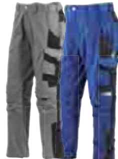
PROFI LINE // Art. Nr. 28.636.0