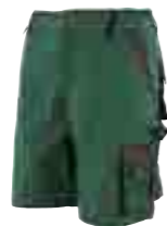
ALLROUND GREEN // Art. Nr. 28.624.0