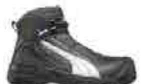
63.021.0 CASCADES MID S3 HRO SRC