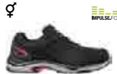
VIALE BLACK LOW WORK & HIKE XTS // O1 HRO SRC Art. Nr. 65.443.0