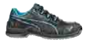
64.412.0 NIOBE BLUE WNS LOW S3 ESD SRC