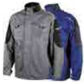
PROFI LINE // Art. Nr. 28.635.0