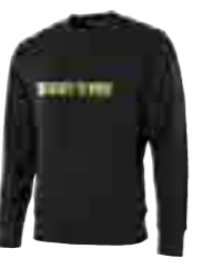
MISSION // Art. Nr. 26.421.0