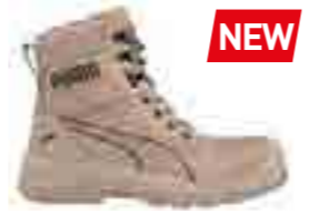
63.074.0 CONQUEST STONE HIGH S3 HRO SRC