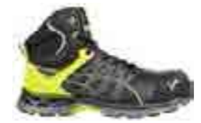
63.388.0 VELOCITY 2.0 YELLOW MID S3 ESD HRO SRC