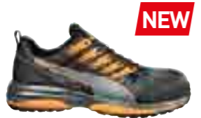
64.455.0 CHARGE ORANGE LOW S1P ESD HRO SRC