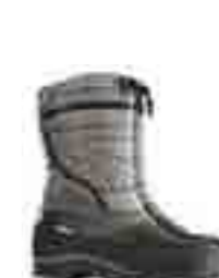
CALGARY // Art. Nr. 58.402.0