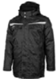
RASMUSSEN // Art. Nr. 27.042.0