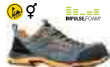
WORKOUT LOW XTS TRAIL // S1P ESD HRO SRC Art. Nr. 64.624.0