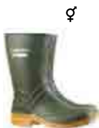
GUARDIAN MID GREEN // Art. Nr. 56.402.0