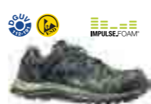
ENERGY IMPULSE OLIVE LOW DUAL IMPULSE // S1P ESD HRO SRA Art. Nr. 64.665.0