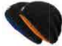
HUSKY // Art. Nr. 25.526.0