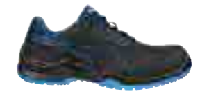
64.422.0 ARGON BLUE LOW S3 ESD SRC