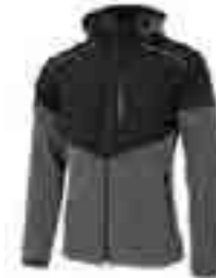
MITCHELL // Art. Nr. 26.448.0