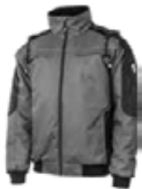
EXPERT 360° // Art. Nr. 28.660.0