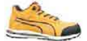
63.318.0 DASH WHEAT MID S3 HRO SRC