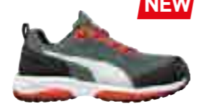
64.450.0 SPEED GREEN LOW S1P ESD HRO SRC