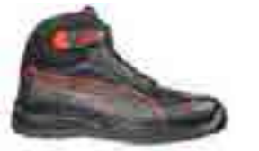
63.216.0 DAYTONA MID S3 HRO SRC