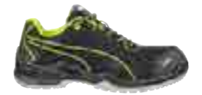
64.421.0 FUSE TC GREEN LOW S1P ESD SRC