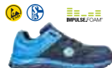
LIFT BLUE IMPULSE S04 LOW DUAL IMPULSE // S1P ESD HRO SRA Art. Nr. 64.659.0