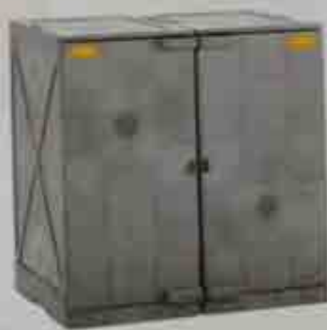
PE chemicals cabinet 10/20