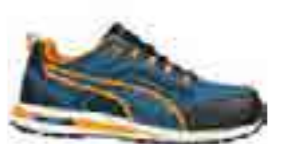
64.310.0 CROSTWIT LOW S3 HRO SRC