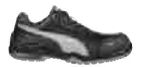
64.423.0 ARGON RX LOW S3 ESD SRC