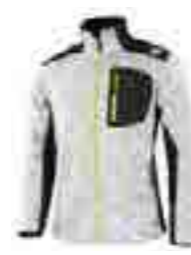
STIRLING // Art. Nr. 26.459.0