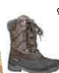
TISDALE BROWN // Art. Nr. 58.139.0