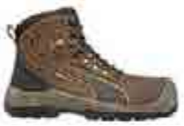
63.022.0 SIERRA NEVADA MID S3 WR HRO SRC