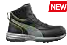
63.550.0 RAPID GREEN MID S3 ESD HRO SRC