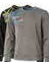
PROTECT // Art. Nr. 26.420.0