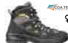
HIGHLANDS CTX MID Art. Nr. 67.752.0