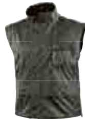
DRIZZLE // Art. Nr. 27.995.0