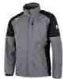
EXPERT 360° // Art. Nr. 28.666.0