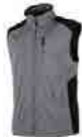
EXPERT 360° // Art. Nr. 28.665.0