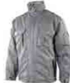
FREESTYLE SR // Art. Nr. 27.043.0