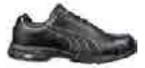
64.285.0 VELOCITY WNS LOW S3 HRO SRC