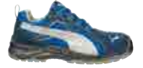
64.361.0 OMNI BLUE LOW S1P SRC