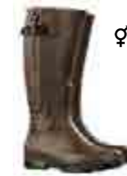
ARAGON // Art. Nr. 57.605.0