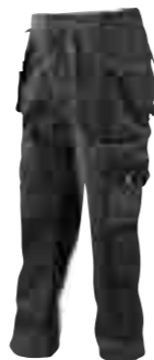
ALLROUND BLACK // Art. Nr. 28.627.0