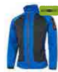
KINGSLEY // Art. Nr. 26.471.0