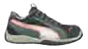
64.268.0 DAKAR LOW S1P HRO SRC