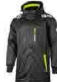
ATMOSPHERE // Art. Nr. 27.485.0