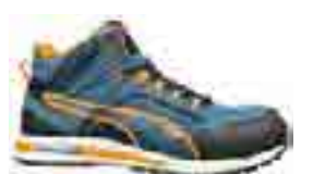
63.314.0 CROSTWIT MID S3 HRO SRC