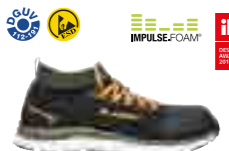
ULTIMATE IMPULSE OLIVE LOW DUAL IMPULSE // S1P ESD HRO SRA Art. Nr. 64.673.0