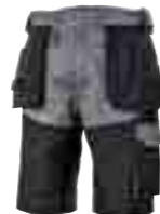
EXPERT 360° // Art. Nr. 28.663.0