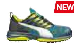
64.452.0 CHARGE GREEN LOW S1P ESD HRO SRC