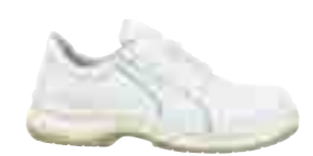
64.062.2 CLARITY LOW S2 SRC