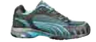
64.282.0 FUSE MOTION BLUE WNS LOW S1 HRO SRC