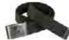
PADDOCK FLEX // Art. Nr. 23.106.0