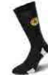
WORK ESD // Art. Nr. 24.038.0