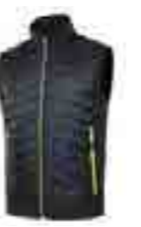
COOPER // Art. Nr. 27.704.0