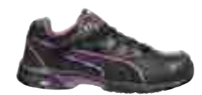
64.288.0 STEPPER WNS LOW S2 HRO SRC