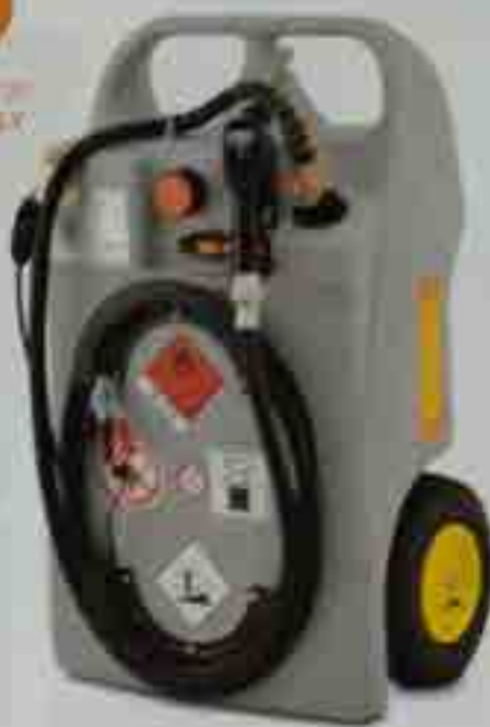
Diesel trolley 100 L with 12 V pump CENTRI SP30