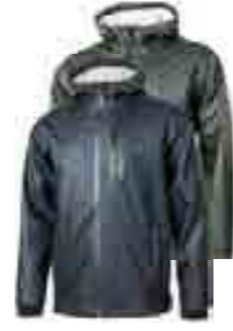
METEO // Art. Nr. 27.486.0