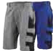
PROFI LINE // Art. Nr. 28.638.0