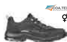
LOFOTEN CTX LOW Art. Nr. 65.860.0