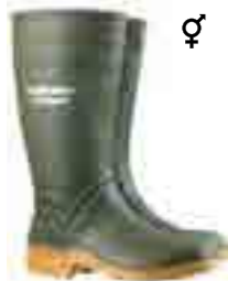
GUARDIAN HIGH GREEN // Art. Nr. 56.401.0