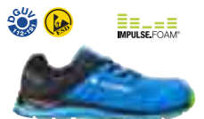
LIFT BLUE IMPULSE LOW DUAL IMPULSE // S1P ESD HRO SRA Art. Nr. 64.661.0