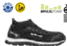
ULTIMATE IMPULSE BLACK LOW DUAL IMPULSE // S1P ESD HRO SRA Art. Nr. 64.672.0