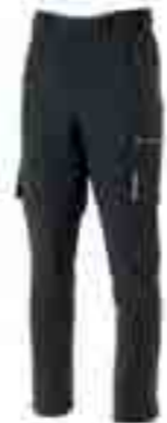
SKILL 4D TRS // Art. Nr. 28.105.0