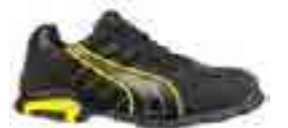
64.271.0 AMSTERDAM LOW S3 SRC