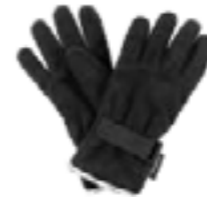
ICEBREAKER // Art. Nr. 25.066.0