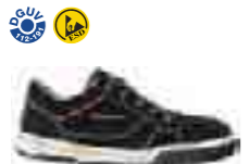
FREESTYLE BLACK LOW FREESTYLE SR // S1P ESD SRC Art. Nr. 64.196.0