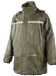
FREEZE JKT // Art. Nr. 27.473.0