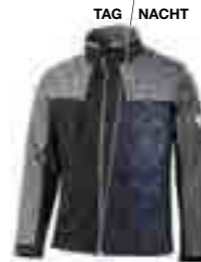
AVERY // Art. Nr. 26.463.0