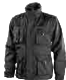
ALLROUND BLACK // Art. Nr. 28.625.0