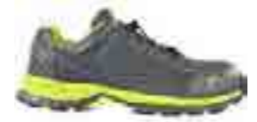
64.388.0 FUSE MOTION 2.0 GREEN LOW S1P ESD HRO SRC