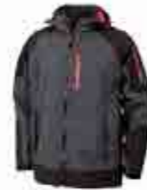
PASCAL // Art. Nr. 27.476.0