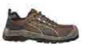
64.073.0 SIERRA NEVADA LOW S3 HRO SRC