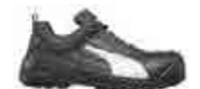
64.072.0 CASCADES LOW S3 HRO SRC