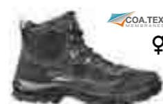
LOFOTEN CTX MID Art. Nr. 67.851.0