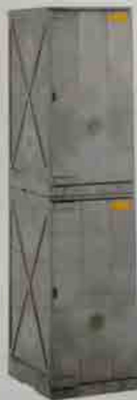
PE chemicals cabinet 5/20