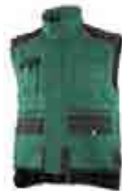
ALLROUND GREEN // Art. Nr. 27.991.0