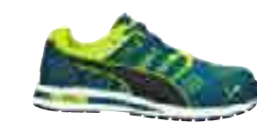
64.317.0 ELEVATE KNIT GREEN LOW S1P ESD HRO SRC