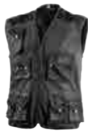
ALLROUND BLACK // Art. Nr. 27.987.0