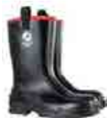
TITAN RIGGER // S5 CI SRC Art. Nr. 59.089.0