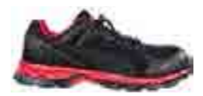
64.389.0 FUSE MOTION 2.0 RED MID S1P ESD HRO SRC