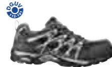
SILVER RACER XTS LOW SPORT XTS // S1P HRO SRC Art. Nr. 64.139.0