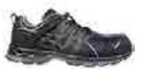
64.384.0 VELOCITY 2.0 BLACK LOW S3 ESD HRO SRC