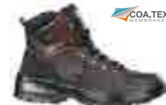
MONT BLANC CTX MID Art. Nr. 67.644.0