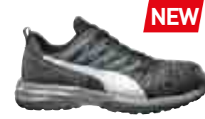
64.454.0 CHARGE BLACK LOW S1P ESD HRO SRC