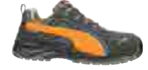
64.362.0 OMNI ORANGE LOW S1P SRC