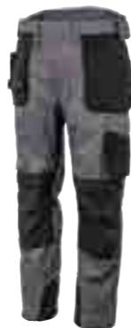
EXPERT 360° // Art. Nr. 28.662.0