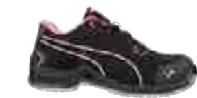
64.411.0 FUSE TC PINK WNS LOW S1P ESD SRC