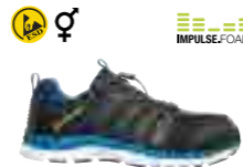
BREEZE IMPULSE LOW DUAL IMPULSE // S1P ESD HRO SRA Art. Nr. 64.752.0