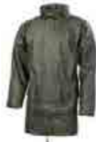
FAHRENHEIT JKT // Art. Nr. 27.449.0