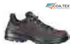
EIGER CTX LOW Art. Nr. 65.865.0