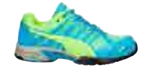
64.290.0 CELERITY KNIT BLUE WNS LOW S1P HRO SRC