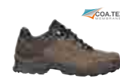
PRATO OLIVE CTX LOW Art. Nr. 65.462.0