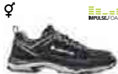
SKYRUNNER BLACK LOW WORK & HIKE XTS // O1 HRO SRC Art. Nr. 65.455.0