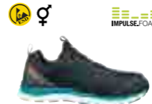
AER55 IMPULSE BLACK BLUE LOW DUAL IMPULSE // S1P ESD HRO SRA Art. Nr. 64.750.0