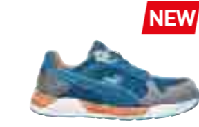
64.464.0 FRONTSIDE LOW S1P ESD HRO SRC