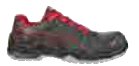
64.420.0 FUSE TC RED LOW S1P ESD SRC