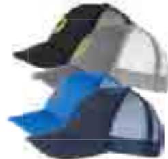
POWER // Art. Nr. 25.423.0