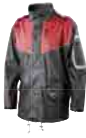
CLIMATE JKT // Art. Nr. 27.477.0