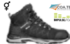
ISCHGL CTX MID WORK & HIKE XTS // O2 WR HRO SRC Art. Nr. 67.758.0