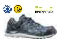
ENERGY IMPULSE GREY LOW DUAL IMPULSE // S1P ESD HRO SRA Art. Nr. 64.666.0