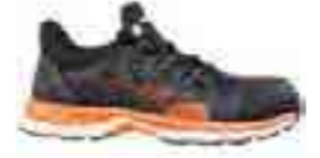
63.387.0 RUSH 2.0 MID S1P ESD HRO SRC