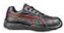
64.262.0 DAYTONA LOW S3 HRO SRC