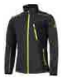
STRUCTURE // Art. Nr. 26.232.0