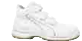
63.018.2 ABSOLUTE MID S2 SRC