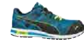
64.306.0 BLAZE KNIT LOW S1P HRO SRC