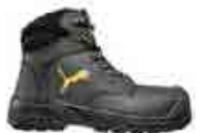
63.041.1 BORNEO BLACK MID S3 HRO SRC