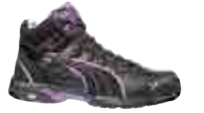
63.060.0 STEPPER WNS MID S3 HRO SRC