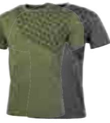
ELLIPSE // Art. Nr. 29.800.0