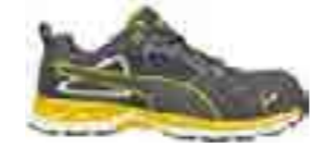
64.380.0 PACE 2.0 YELLOW MID S1P ESD HRO SRC