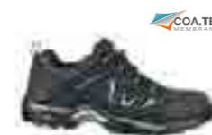
VANTAGE CTX LOW WORK & HIKE XTS // O2 WR HRO SRC Art. Nr. 65.441.0