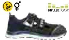
JETSTREAM IMPULSE LOW DUAL IMPULSE // S1 ESD HRO SRA Art. Nr. 64.753.0