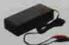
Charge for versions with battery