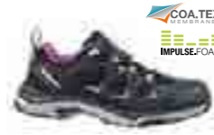
ACADIA CTX WNS LOW WORK & HIKE LDS // O2 WR HRO SRC Art. Nr. 65.251.0