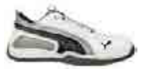
64.265.0 MONACO LOW S3 HRO SRC