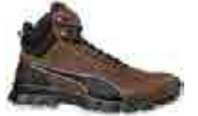
63.012.2 CONDOR BROWN MID S3 ESD SRC