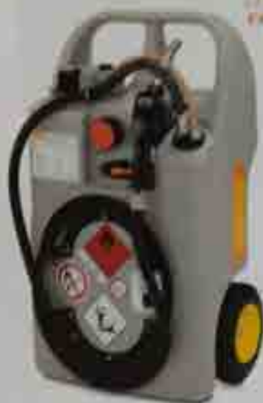
Diesel trolley 60 L with 12 V pump CENTRI SP30 and battery