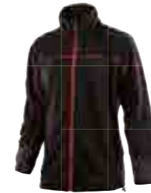
FREESTYLE SR // Art. Nr. 26.439.0