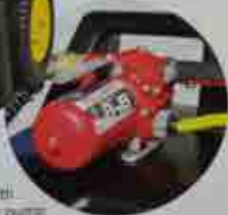
95 L, with electric pump