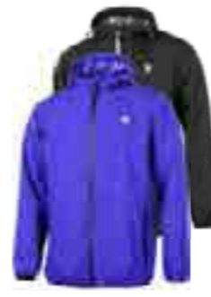
WRAP ME CTX // Art. Nr. 27.547.0