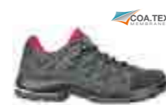
LISSABON CTX LOW Art. Nr. 65.925.0