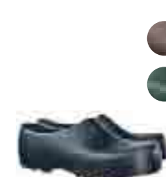
PURCEL PROFI // Art. Nr. 55.025.0