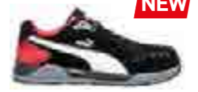
64.463.0 AIRTWIST BLK RED LOW S3 ESD HRO SRC