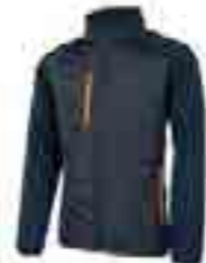
PARRY // Art. Nr. 26.705.0