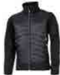
BRADLEY // Art. Nr. 26.704.0