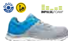
LIFT GREY IMPULSE LOW DUAL IMPULSE // S1P ESD HRO SRA Art. Nr. 64.670.0