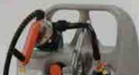
Diesel trolley 100 L with crank pump