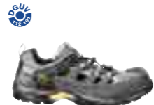
MARATHON XTS LOW SPORT XTS // S1P HRO SRC Art. Nr. 64.155.0