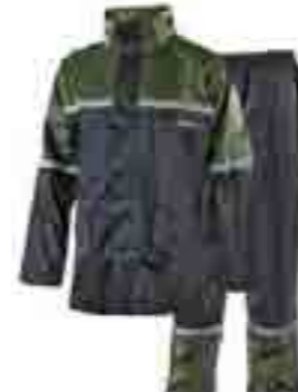
SUPERCCELL // Art. Nr. 27.543.0