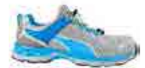
64.386.0 XCITE GREY LOW S1P ESD HRO SRC