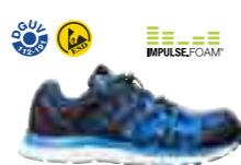
ENERGY IMPULSE LOW DUAL IMPULSE // S1P ESD HRO SRA Art. Nr. 64.662.0