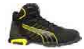
63.224.0 AMSTERDAM MID S3 SRC