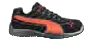
64.263.0 SILVERSTONE LOW S1P HRO SRC