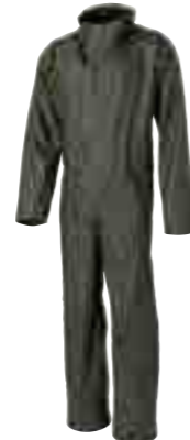
FAHRENHEIT OVERALL // Art. Nr. 27.453.0