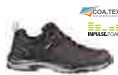
BRIONE CTX LOW WORK & HIKE XTS // O2 WR HRO SRC Art. Nr. 65.447.0