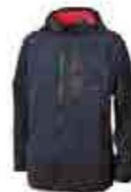
DELISLE // Art. Nr. 27.475.0