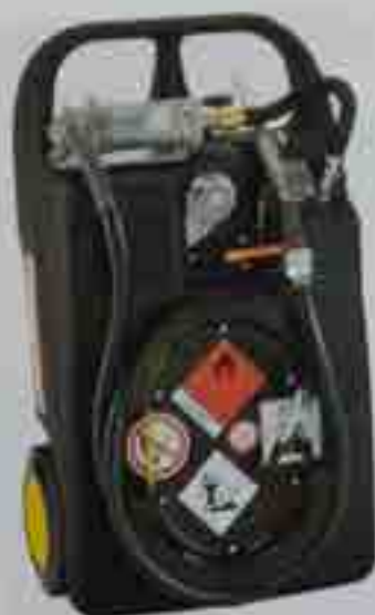
60 L, with hand pump