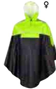
CYCLONE // Art. Nr. 27.544.0