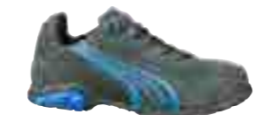
64.272.0 MILANO LOW S1P SRC