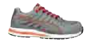
64.307.0 XELERATE KNIT LOW S1P HRO SRC