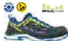
SKYRUNNER LOW XTS TRAIL // S1P ESD HRO SRC Art. Nr. 64.625.0