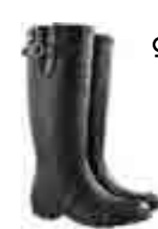
AURORA // Art. Nr. 57.603.0