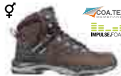
BRIONE CTX MID WORK & HIKE XTS // O2 WR HRO SRC Art. Nr. 67.777.0