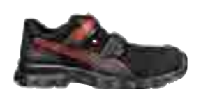
64.089.1 AVIAT LOW S1P ESD SRC