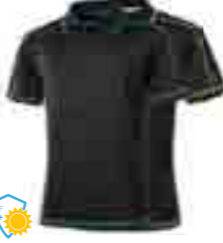
CLIMA // Art. Nr. 29.782.0