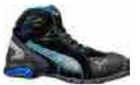
63.225.0 RIO BLACK MID S3 SRC