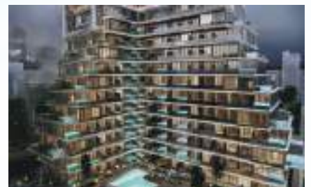
Rabdan Nas 3