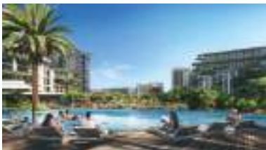
Meraas central park city walk