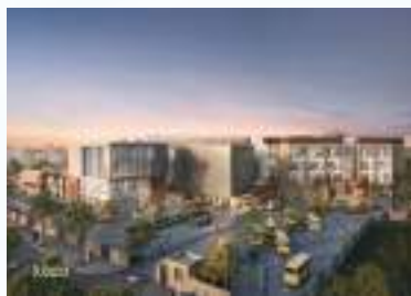
Dubai British School