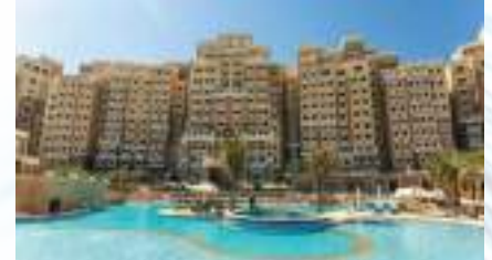
Kingdom of Sheba