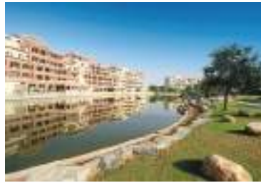
Motor City Lake