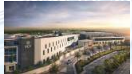
American Community School