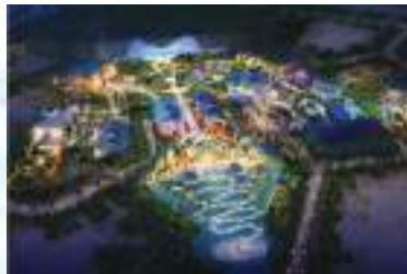
Dubai Park & Resort