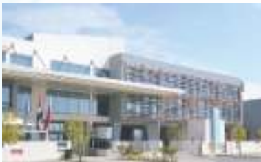
Nord Anglia School