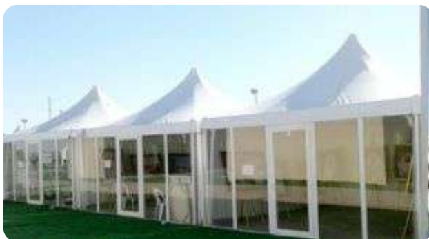
Event Tent Rentals