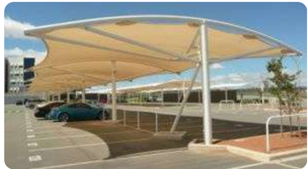
Car parking shades