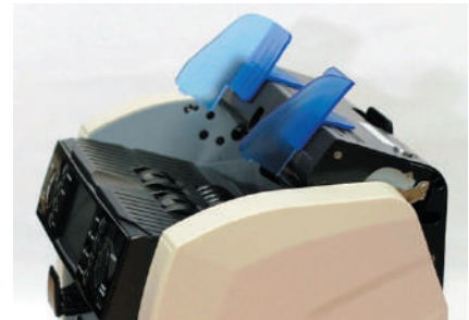
The whole top can be opened for full access to all sensors and the banknote transport system.