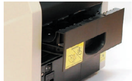
Open the rear like a drawer to get full access for cleaning and removing damaged banknotes.

Even though BellCount S515 is high-tech with many advanced functions, it requires limited space due to the compact size and small footprint. S515 is designed for every modern financial and retail sector environment.