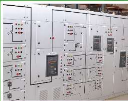
Low Voltage Switch gear Panel