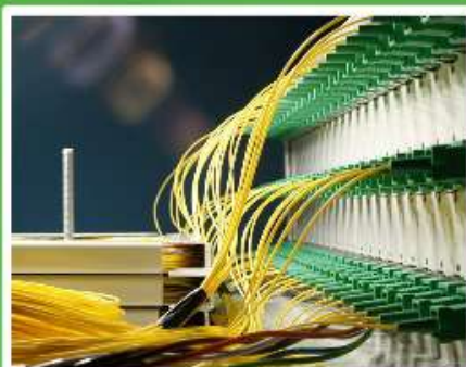
Structured Cabling & Accessories