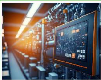
Industrial Automation Panel