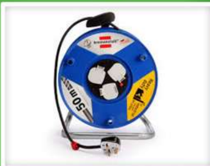
Industrial Trailing Socket