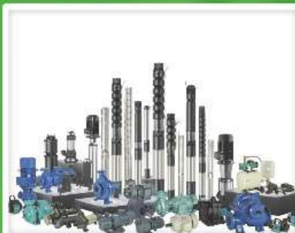
Submersible Pumps and Motors