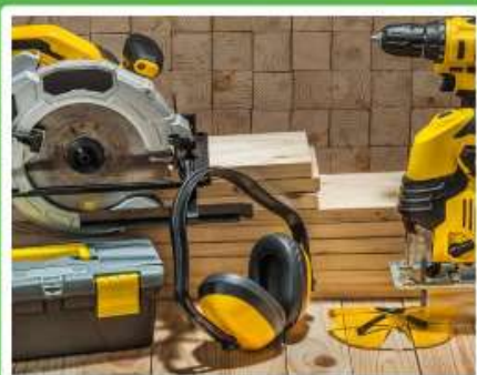
Power Tools & Safety Products