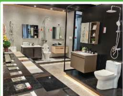
Building Materials & Sanitary