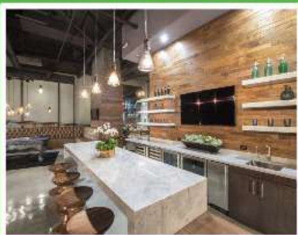
Industrial & Domestic Lighting