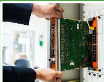
Electrical Panel Assembly & Components Supply Unit