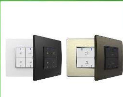
Wiring Accessories & Home Automation