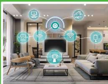
Home Automation (KNX&Wifi)