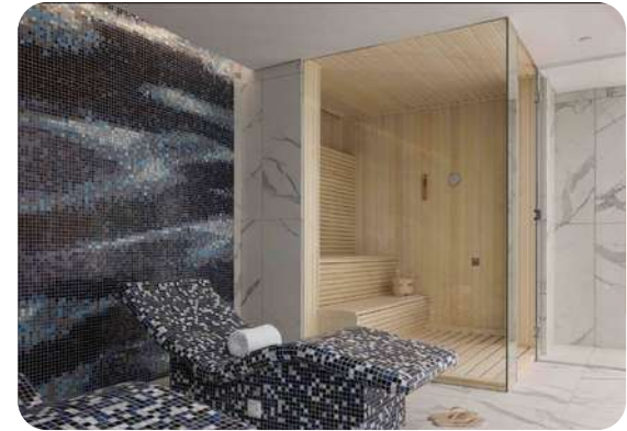
Jumeirah Resort, Bahrain