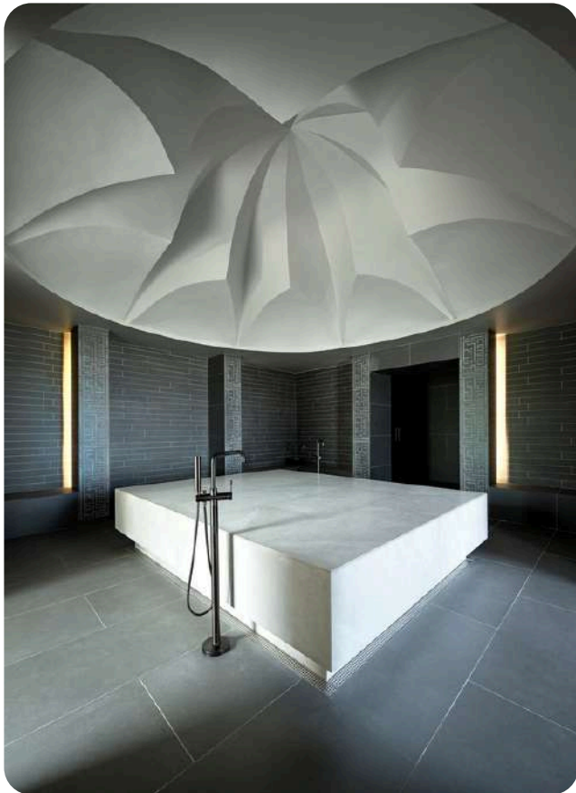
InterContinental Resort & Spa, Fujairah