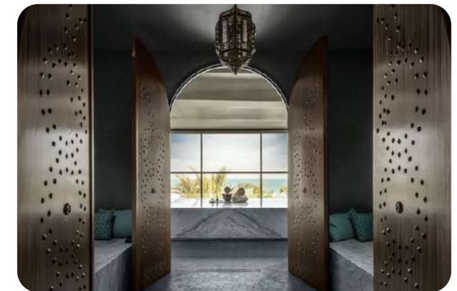
Fairmont Hotel Spa, Ajman