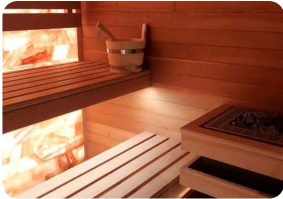
Private Residence D1, Dubai