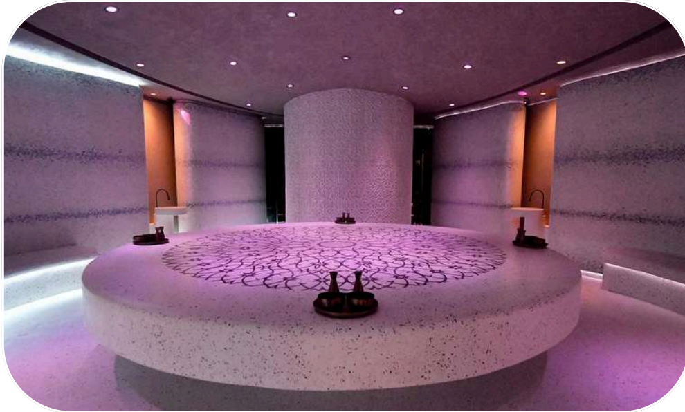
InterContinental Resort & Spa, RAK