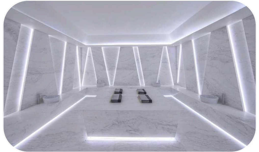
Nikki Beach, Dubai