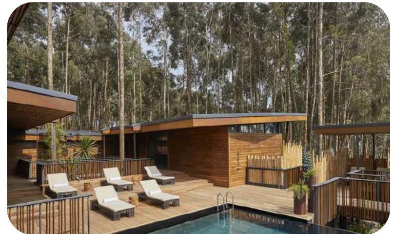
One & Only Hotel, Rwanda