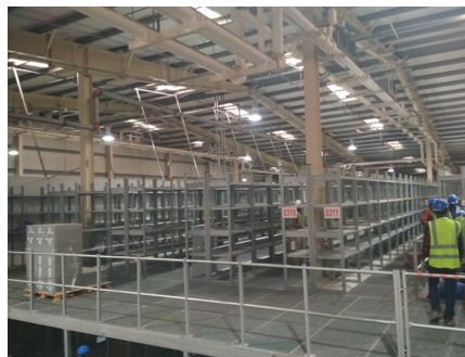
Shelving Rack System