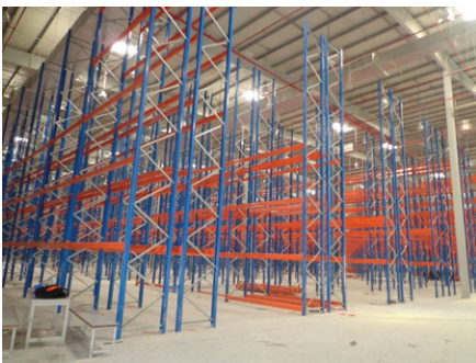
Pallet Racking System