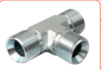
BSP MALE, PART NO: AB