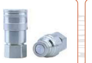
QUICK COUPLING, FLAT FACE, PART NO: H302