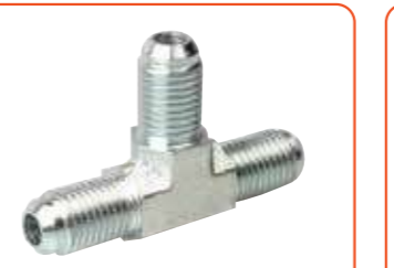
JIC MALE, PART NO: AJ