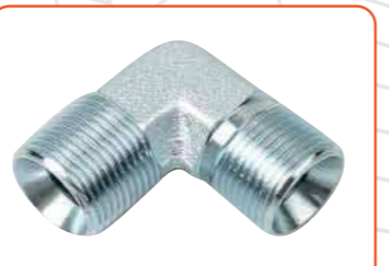
90° BSP X BSPT PART NO: 1BT9