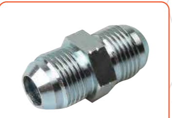
JIC X JIC, PART NO: 1J