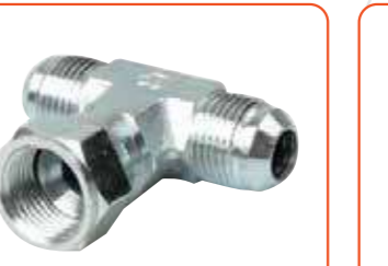
JIC , PART NO: BJ