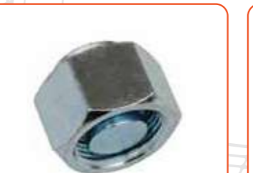
BSP FEMALE PLUG, PART NO: 4B