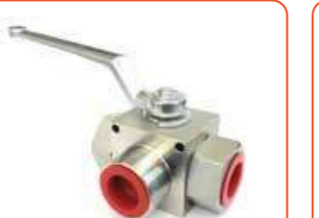
HIGH PRESSURE, BALL VALVE 3 WAY, PART NO: VH3V - G