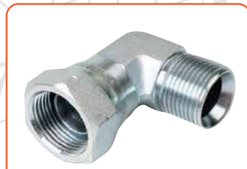
BSP MALE X BSP FEMALE, PART NO: 2B9