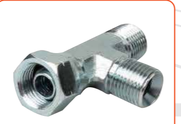
BSP, PART NO: CB