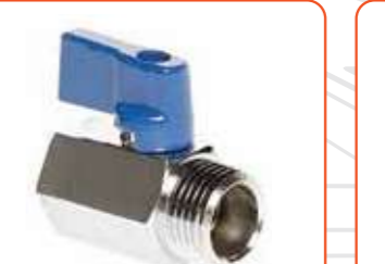
BRASS BALL VALVE FOR AIR