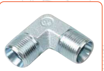
90° METRIC, PART NO: 1C9 / 1D9