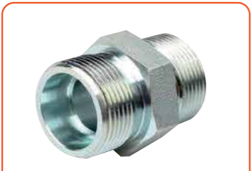
METRIC L.T / H.T, PART NO: 1C / 1D