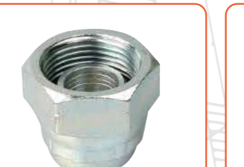
BSP FEMALE PLUG, PART NO: 9B