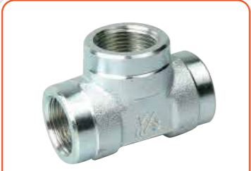
BSP FEMALE ,PART NO: GB