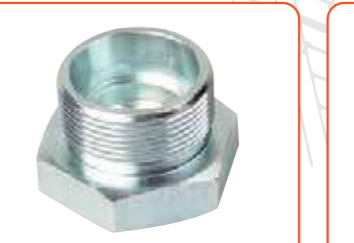
METRIC MALE PLUG, PART NO: 4C