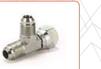
JIC , PART NO: CJ