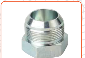
JIC MALE PLUG, PART NO: 4J