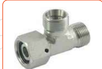
METRIC L.T. / H.T, PART NO: CC/CD