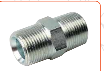
BSPTXBSPT, PART NO: 1BT