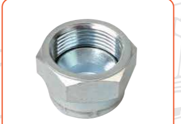
JIC FEMALE PLUG, PART NO: 9J