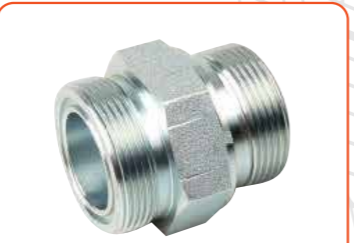
ORFS X BSP, PART NO: 1FG