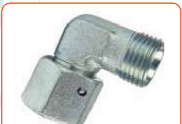
METRIC MALE X METRIC FEMALE, PART NO: 2C9