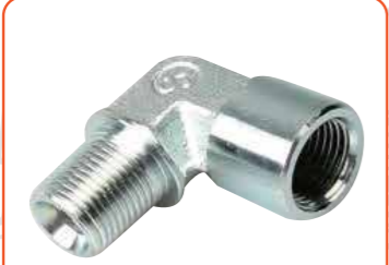
90° BSPT X BSP, PART NO: 5TB9