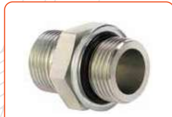
BSP X BSP SEAL BONDED, PART NO: 1BG