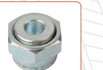
ORFS FEMALE PLUG, PART NO: 9C