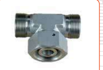
METRIC L.T / H.T, PART NO: BC / BD