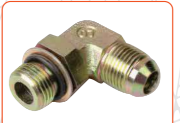
JIC X BSP BOUNDED SCAL, PART NO: J69 - OG