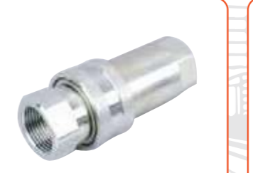
QUICK COUPLING, PART NO: KZE