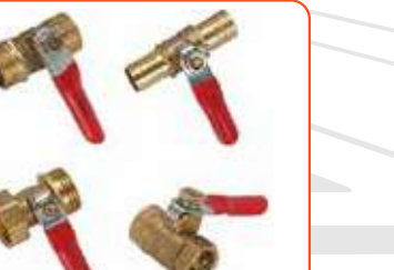
BRASS BALL VALVE FOR RADIATOR