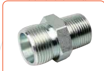
METRIC X BSPT, PART NO: 1CG / 1DG