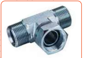
BSP, PART NO: BB