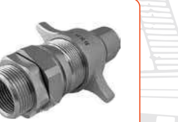
WING QUICK COUPLING, PART NO: W302