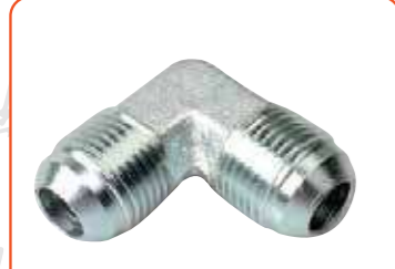
90° JIC X JIC, PART NO: 1J9