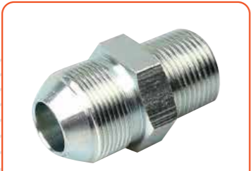
JIC X BSPT, PART NO: 1JT