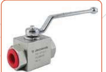
HIGH PRESSURE, BA 4 VALVE 2 WAY, PART NO: VH2V - G