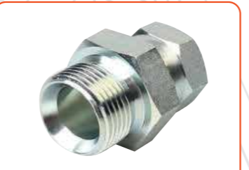
BSP MALE X BSP FEMALE, PART NO: 2B