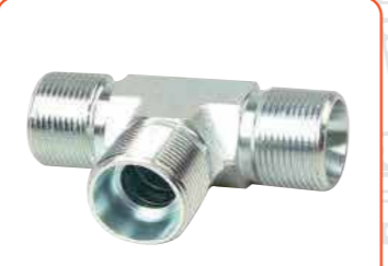
METRIC L.T / H.T, PART NO: AC/AD