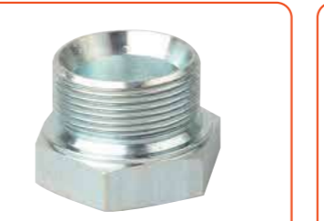
BSP MALE PLUG, PART NO: 4B