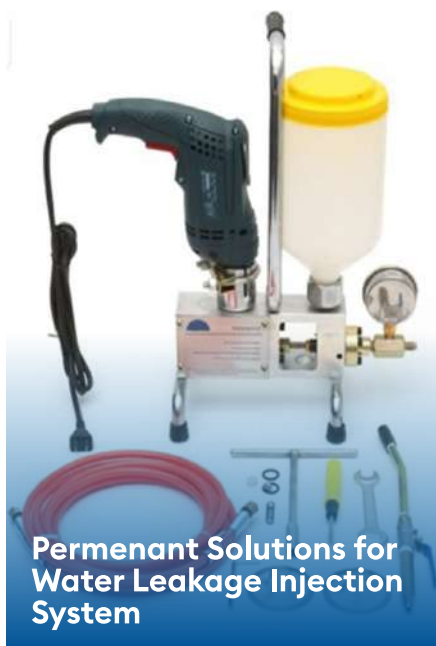
Permenant Solutions for Water Leakage Injection System