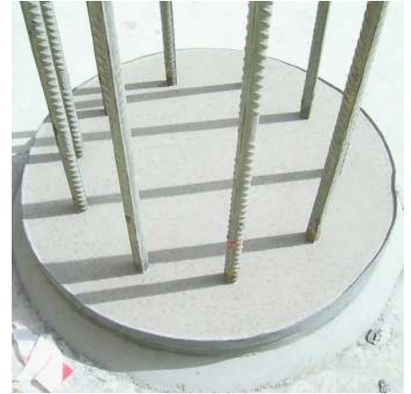
Pile Cap Encapsulation