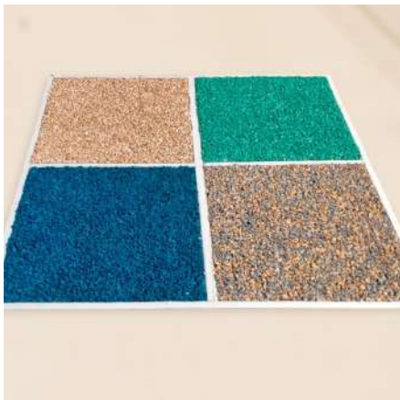
Carpet Flooring For Walkway Around Swimming Pool And Garden