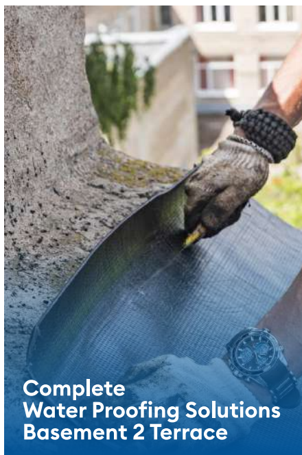
Complete Water Proofing Solutions Basement 2 Terrace

Our team of technical experts is committed to delivering high-quality services that are tailored to meet the unique needs of our clients.