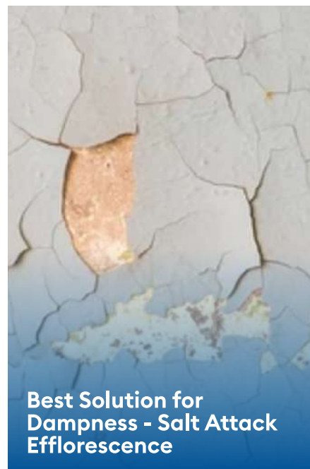
Best Solution for Dampness - Salt Attack Efflorescence