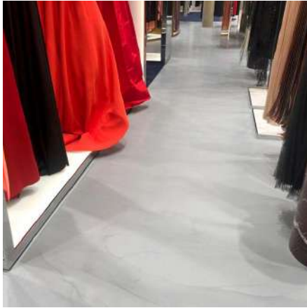
Comfort Flooring Marble X

We provide a diverse selection of supply and apply activities that cater to the residential, commercial and industrial sectors.