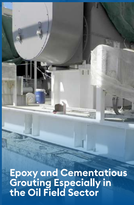
Epoxy and Cementitious Grouting Especially in the Oil Field Sector