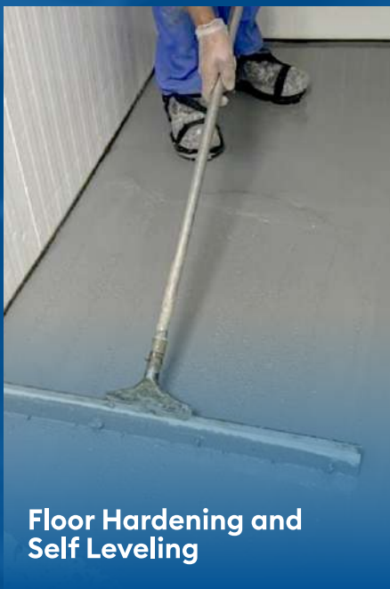
Floor Hardening and Self Leveling