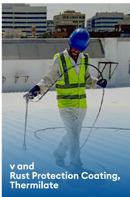
v and Rust Protection Coating, Thermilate