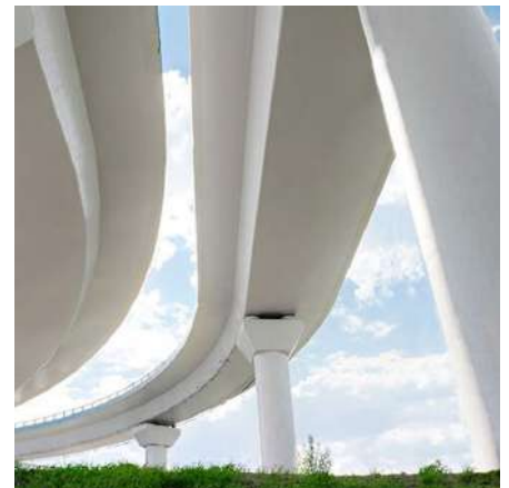
Anti Carbonation Coating