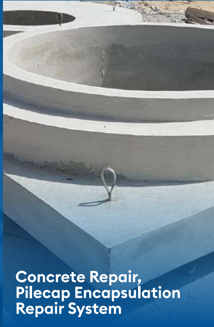
Concrete Repair, Pilecap Encapsulation Repair System