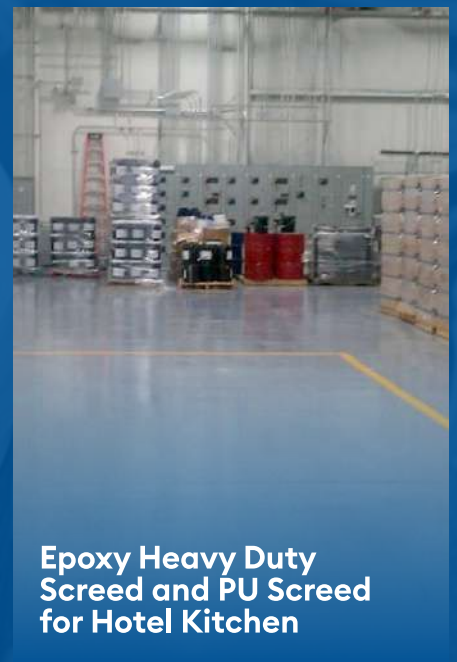
Epoxy Heavy Duty Screed and PU Screed for Hotel Kitchen