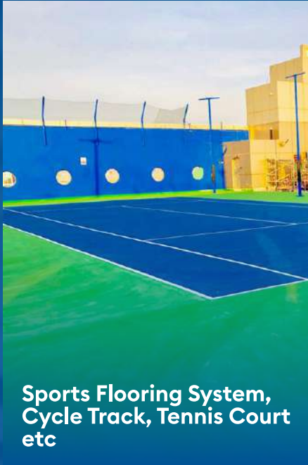
Sports Flooring System, Cycle Track, Tennis Court etc

We can provide a comprehensive solution for protecting surfaces and ensuring their longevity.