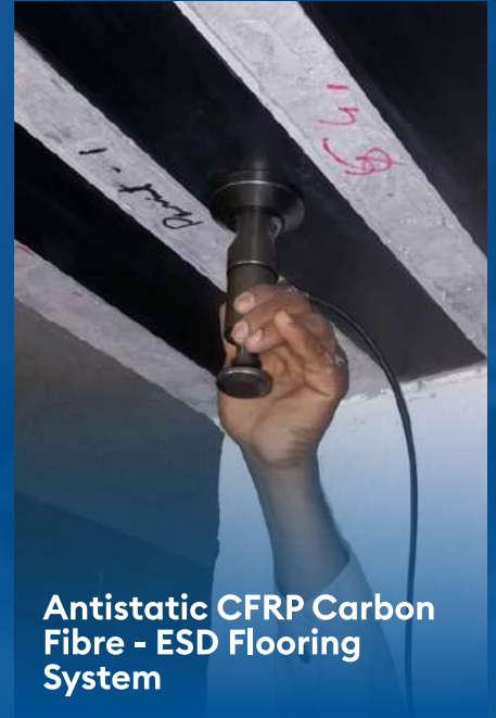
Antistatic CFRP Carbon Fibre - ESD Flooring System