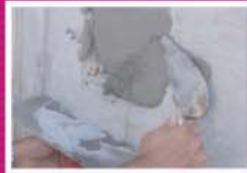
Concrete Repair Mortar