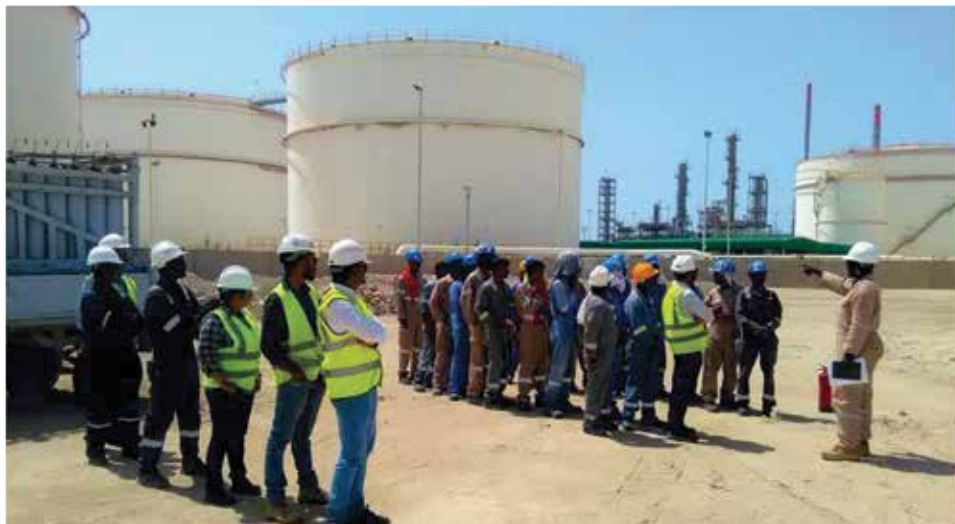
Mock Drill at EMDAD