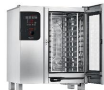
Convection oven table top