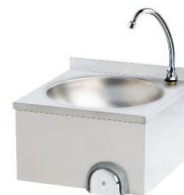
knee operated sink