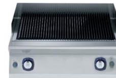
Gas/Electric Lava grill