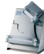
Pizza rolling machine