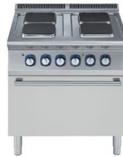
Gas/Electric Hot plate range with oven