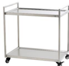
Two level service trolley