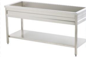
Ice dump table with under shelf