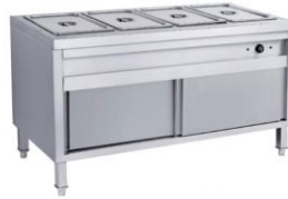
Bain Marie with cabinet