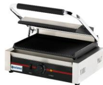
Gas/Electric Single contact grill