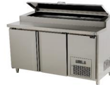
Pizza/Salad Preparation Chiller