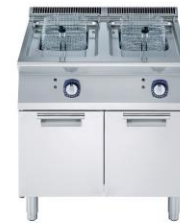
Gas/Electric Double fryer on cabinet