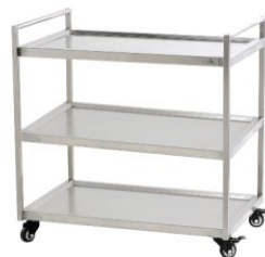
Three level service trolley