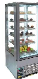
Upright pastry chiller