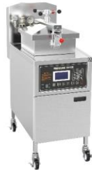
Gas/Electric Broast machine