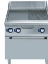
Gas/Electric Grill on cabinet 1/2 Smoked/2 Control