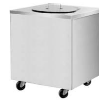
Mobile Tandoor /Gas