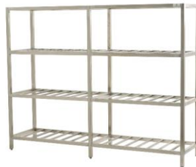
Tube shelving unit (four tier)