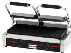
Gas/Electric Double contact grill