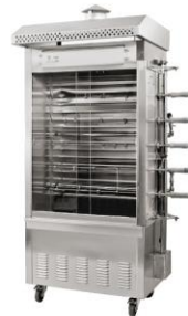
Chicken Grill Machine