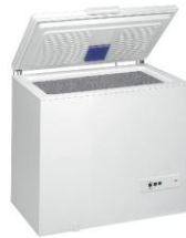
Chest Freezer Top Open Door