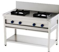
Two Burner Indian Range