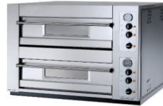
Table Top pizza oven two layer