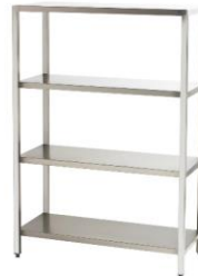
Sheet shelving unit (four tier)