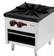
Stock Pot Stove