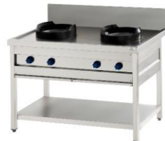
Two Burner Chinese Range