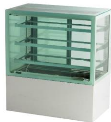
Hot / Cold rectangle display