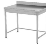
Work top table with out shelf