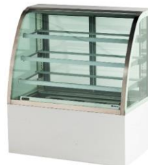
Hot / Cold curved display