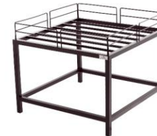
Promotional display stand