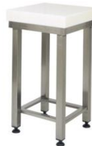
Chopping block with stand