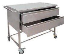
Endoscope transport trolley