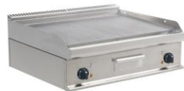
Gas/Electric Ribbed griddle