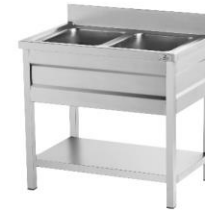
Double bowl sink