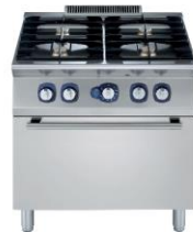
Gas cooking range with oven