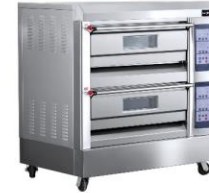
Baking oven two layers