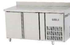
Two Door Work Top Chiller/Freezer