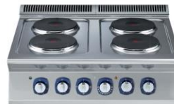
Gas/Electric Table top hot plate range