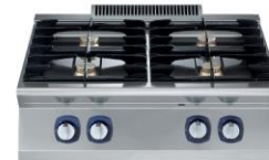
Table top four burner range