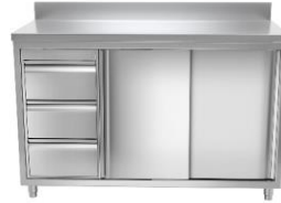
work top cabinet (Sliding door & drawer)