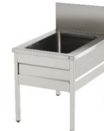
Single bowl pot wash