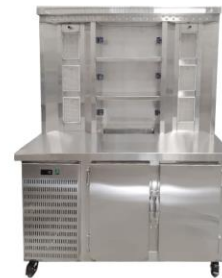
Shawarma machine with chiller