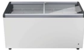
Chest Freezer Top Sliding Door