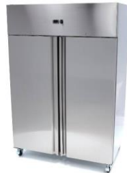
Two Door Upright Chiller/Freezer