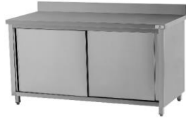
Work top cabinet (Sliding door)