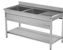
Double bowl sink with drain board