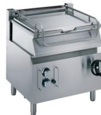
Gas/Electric Tilting Pan