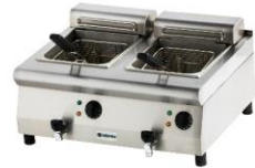
Gas/Electric Table top Double fryer