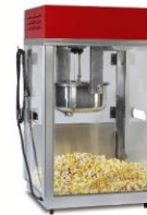
Popcorn warmer machine