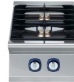
Table top two burner range