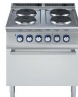
Gas/Electric Hot plate range with oven