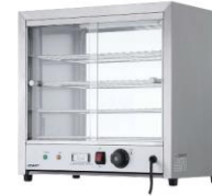
Table top rectangle hot display