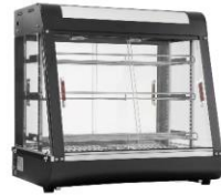
Table top curved hot display