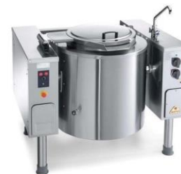
Gas/Electric Race boiler