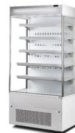
Open Display Chiller