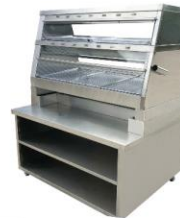
Food display warmer