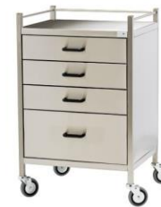
Four drawer trolley