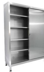
Upright cabinet sliding door