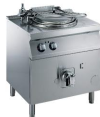
Gas/Electric Boiling Pan