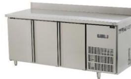
Three Door Work Top Chiller/Freezer