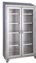
Surgical instrument display cabinet