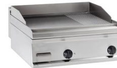
Gas/Electric Griddle 1/2 smooth 1/2 ribbed