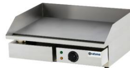
Gas/Electric Smooth griddle