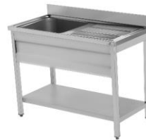
Single bowl sink