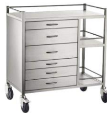
Six drawer trolley