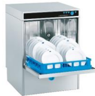
Under counter dish washer