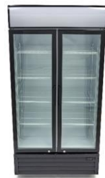
Single Door Upright Bottle Cooler