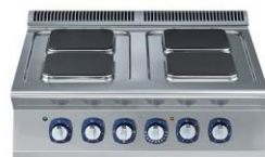
Gas/Electric Table top hot plate range