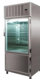
Meat Hanging Chiller