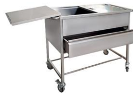
Endoscope washing trolley