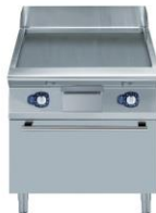
Gas/Electric Smooth grill on cabinet