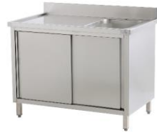
Single bowl sinkcabinet