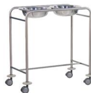
Double wash basin trolley