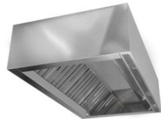
Double skin kitchen hood