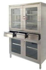
Upright cabinet (4 hinged door with 3 drawer )