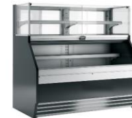
Donut display chiller