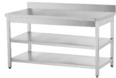
Work top table (Two under shelf)