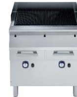
Gas/Electric Lava stone on cabinet