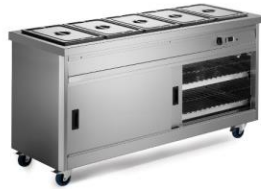
Bain-Marie with Hot cabinet