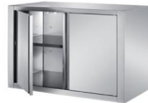
Wall mounted cabinet (Hinged door)