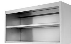
Wall mounted open cabinet