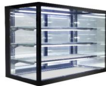
Nutral hot display