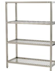
Ware shelving unit (four tier)