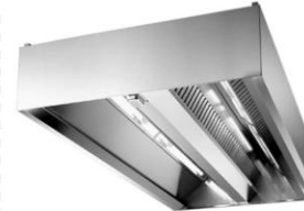
Island type kitchen hood