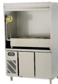
Barbeque Unit With Chiller