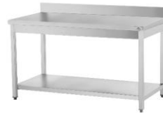
Work top table (One under shelf)