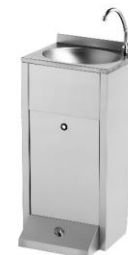
Pedal operated sink