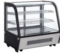
Table top curved cold display