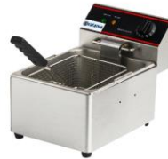
Gas/Electric Table top single fryer