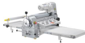
Table top dough sheeter