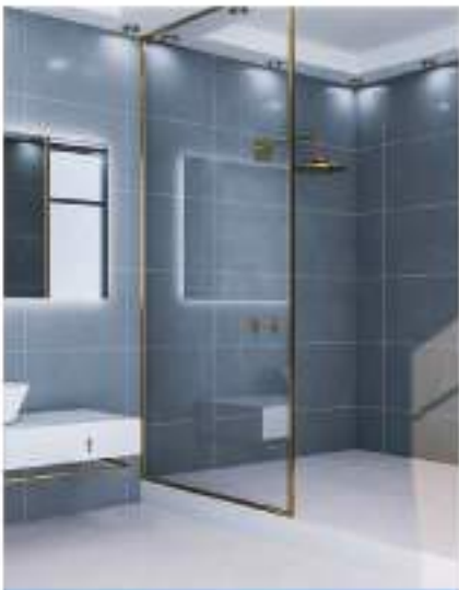
SHOWER ENCLOSURE AND MIRROR