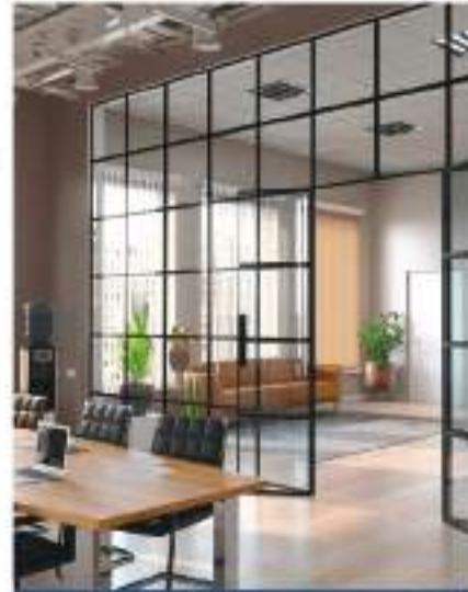
OFFICE GLASS PARTITION