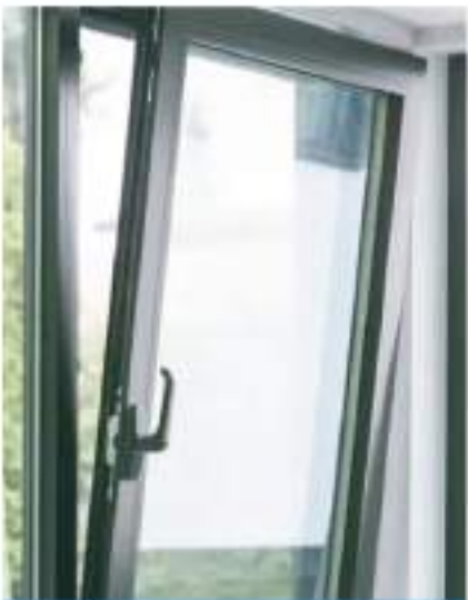
ALUMINIUM TURN & TILT WINDOW