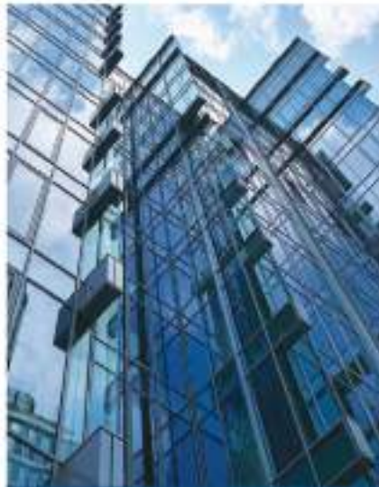
ALUMINIUM CURTAIN WALL WORKS