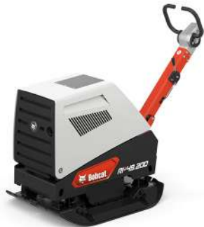
Forward Reversible Plate Compactor