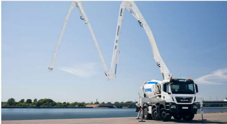
Truck Mounted Concrete Pump