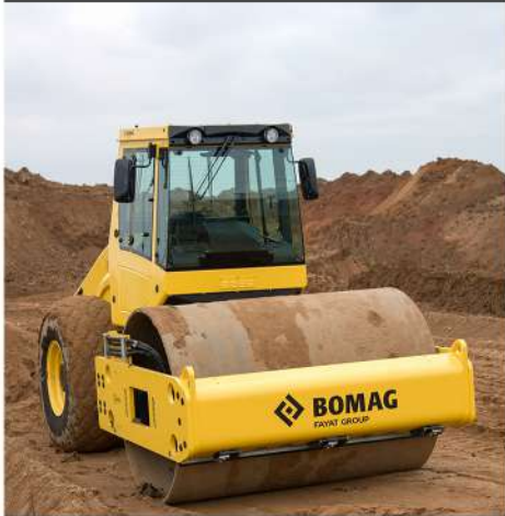
Single Drum Compactor