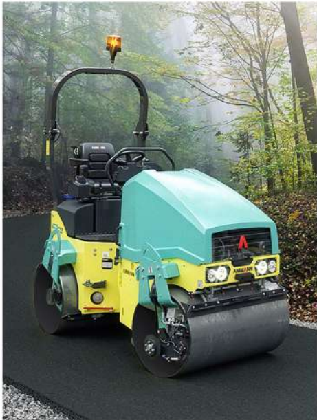
Light Tandem Roller