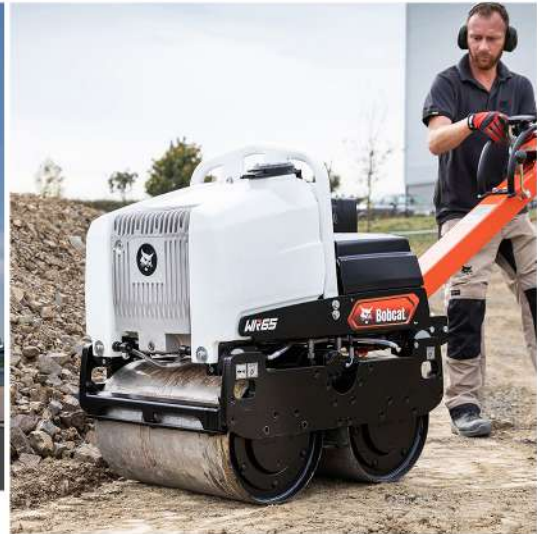
Walk Behind Roller