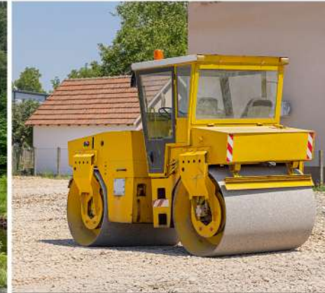
Double Drum Compactor