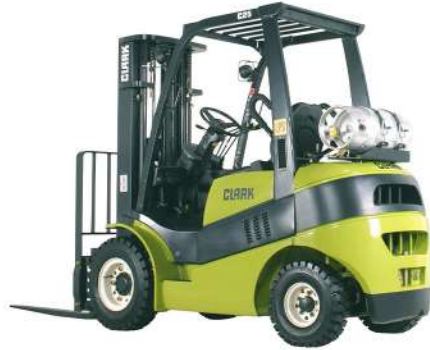
Light Duty Forklift- Diesel LPG