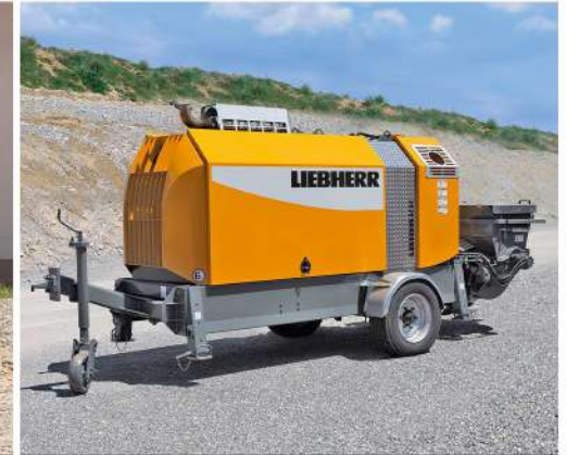
Stationary Concrete Pump