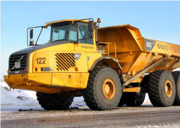
Articulated Dump Truck