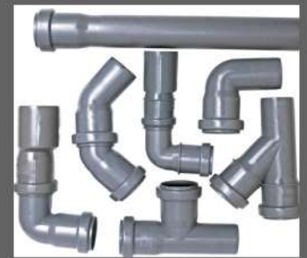
MI & GI Fittings