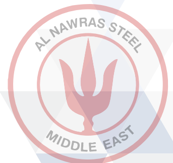
CEO, AL NAWRAS STEEL

We look forward to our partnership with you.