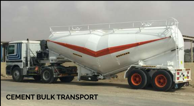
CEMENT BULK TRANSPORT