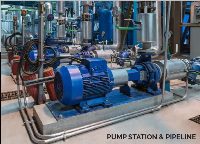
PUMP STATION & PIPELINE