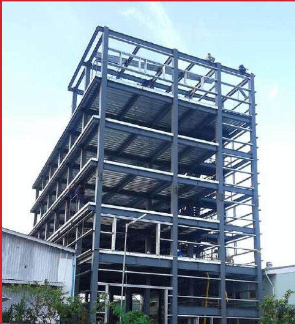
STEEL STRUCTURE FOR COMMERCIAL & RESIDENTIAL BUILDING