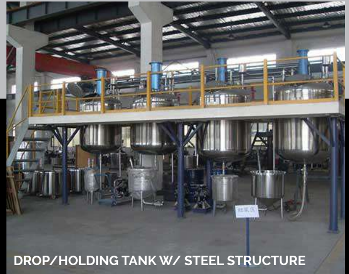
DROP/HOLDING TANK W/ STEEL STRUCTURE