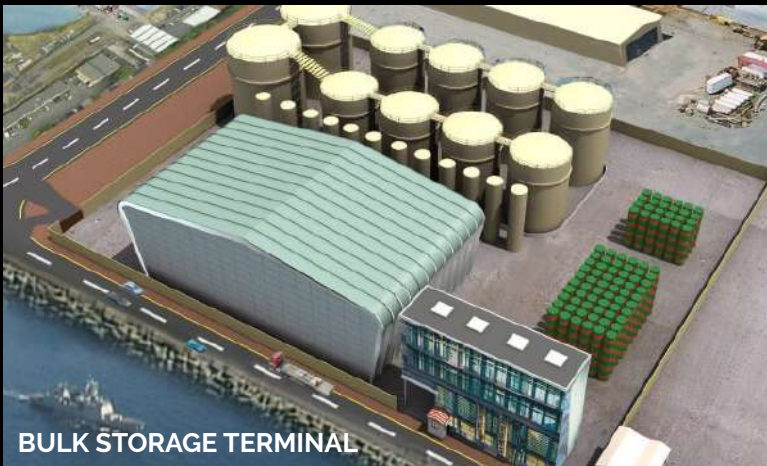
BULK STORAGE TERMINAL