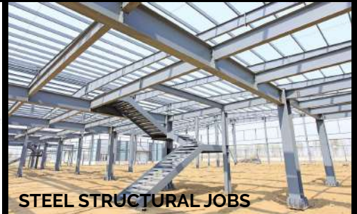
STEEL STRUCTURAL JOBS