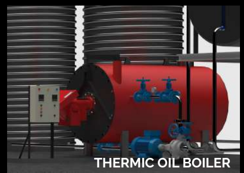
THERMIC OIL BOILER