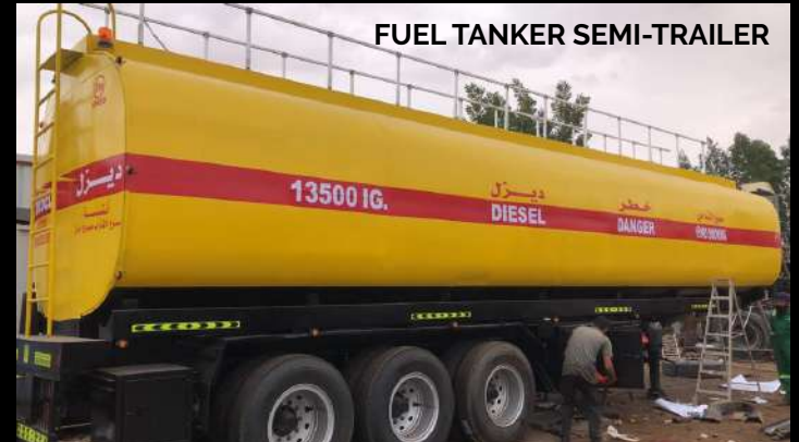
FUEL TANKER SEMI-TRAILER