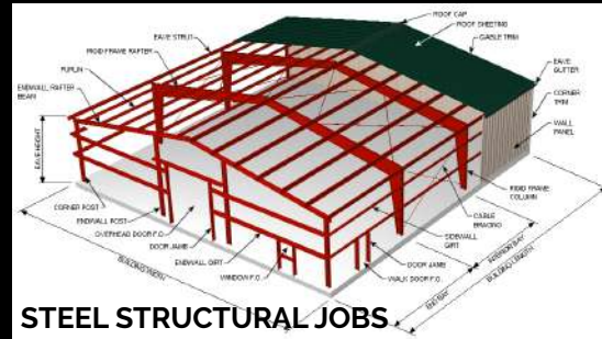
STEEL STRUCTURAL JOBS