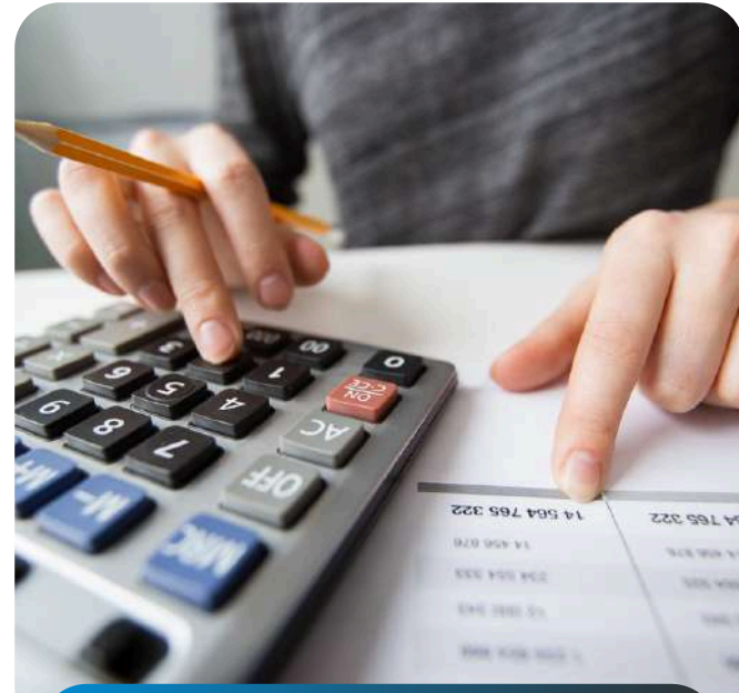
Value Added Tax (VAT)