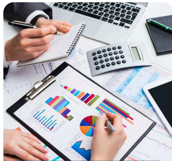
Accounting Advisory & Bookkeeping