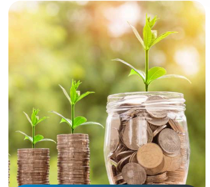
Anti-Money Laundering (AML) Services