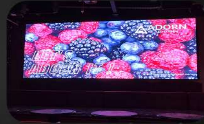
Sevaseas Hotel, Al Nahda, Dubai.