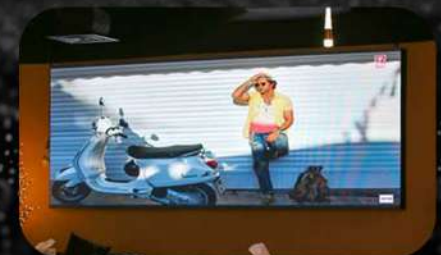
Vegetarian Restaurant, Al Karama, Dubai