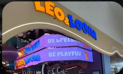
Leo Loona Abudhabi