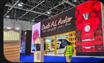
Oud Al Anfar DWTC