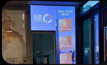
Golden Cube Dubai