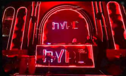
Hype Club DIFC,Dubai