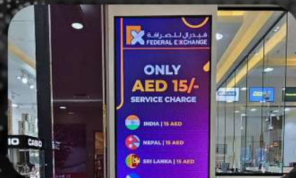
Federal Exchange Muwaileh