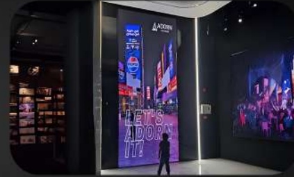
Car Showroom Rasalkhor