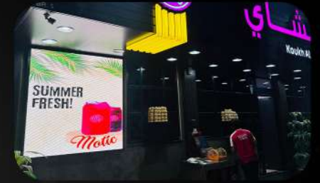
Kokhu Al Shai Cafeteria, Dubai

Pixel : P2.5 Outdoor , Size: 160CMx160CM