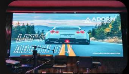
Al Hannes Cafe, Ajman