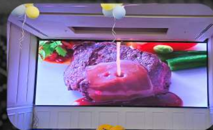
Sevaseas Banquet Hall, Al Nahda,Dubai.