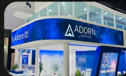
City Pharma, Dubai