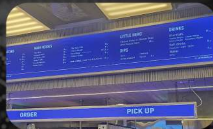
Chicken Man Sharjah