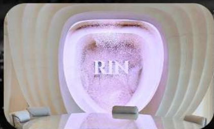
Rin Foundation DIFC,Dubai.