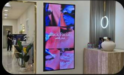
Beauty Clinic Alquoz