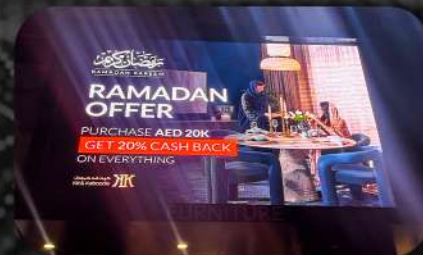
Kit and Kaboodle Al Quoz