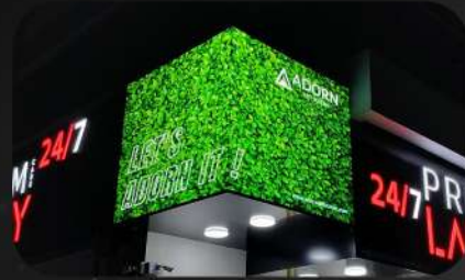
PREMIUM Laundry Al Warqa