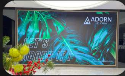
ANNEX, Business Bay,Dubai.