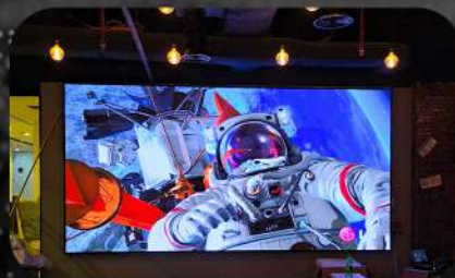
Jefry Sports Bar Al Nahda,Dubai.