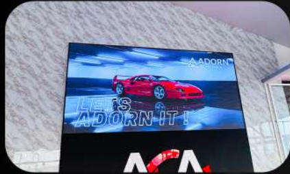
AL Qaryah Cars Auctions, Sajja,Sharjah.

We have been working so hard to deliver customized solutions to our clients. We are very happy that, we could do it all in the time frame. We have been completed nearly 120+ Projects within an year in UAE. Sharing few of our projects with you for the reference.