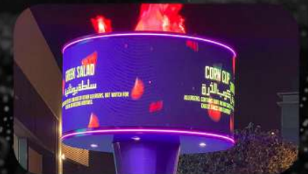
Flaming Hot Riyadh