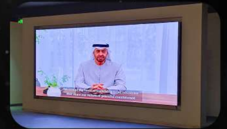
National Library & Archives Sheikh Zayed Festival City