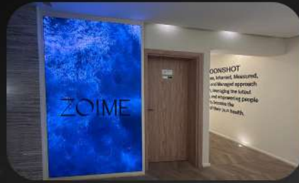
Zoi Clinic Jumairah