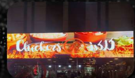
Cluckers Al Hassa