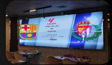
Aldimashaki Al Aseel Ajman