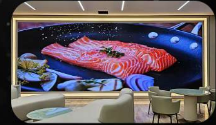
Amis Al quoz