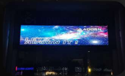
Crypto Miners, Dubai