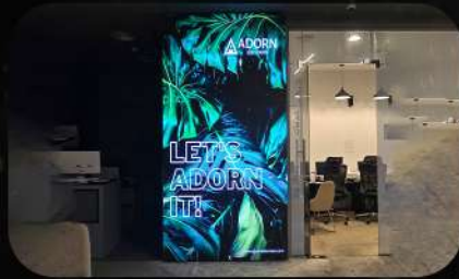
Ontime Business Setup Dubai

Pixel : P2.5 Outdoor , Size: 160CMx160CM