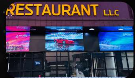
Boat Sea Food Restaurant, Al Warqa, Dubai