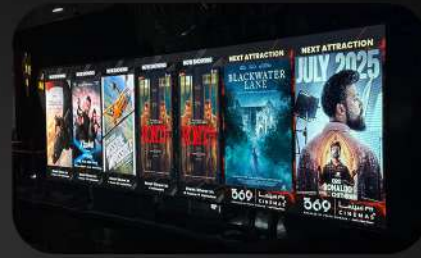
369 Cinemas, Abu Dhabi