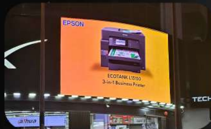
Technox, Burdubai, Dubai.