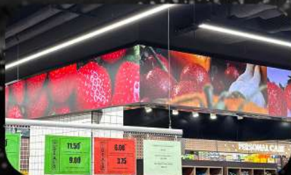
Al Madina Market Muraqqabat