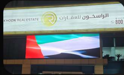
AL Rasikhoon Ajman