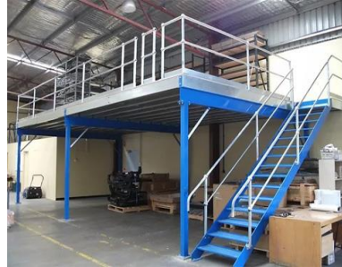
➤ Structural Mezzanine