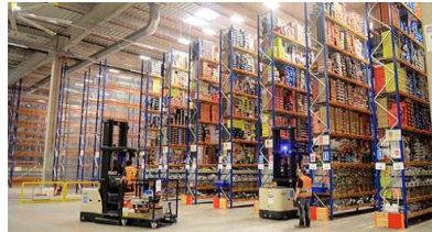
➤ Very Narrow Aisle