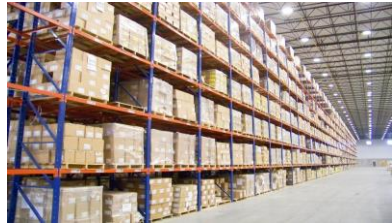
➤ Pallet Racking