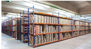
➤ Medium Duty Rack