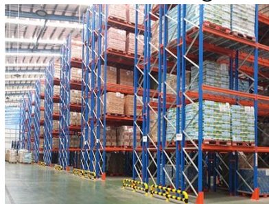
➤ Double Deep Rack