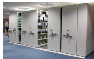
➤ Mobile Shelving