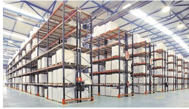
➤ Heavy Duty Racking