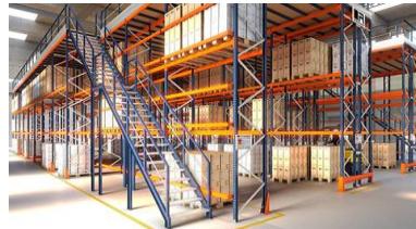
➤ Racking Mezzanine