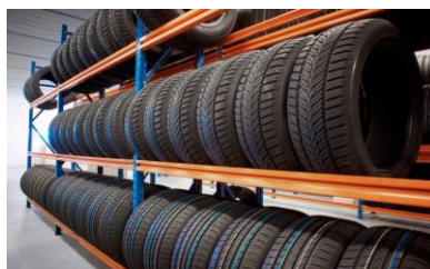
➤ Tire Racking