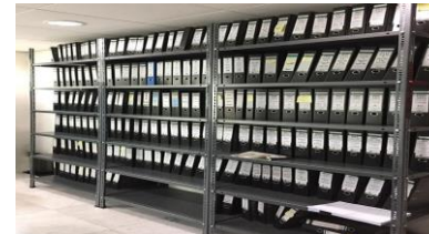
➤ Slotted Angle Shelf