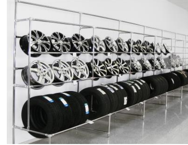
➤ Joker Pipe System