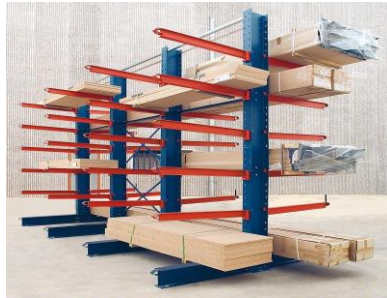
➤ Cantilever Racking