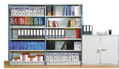
➤ Bolt Free Shelving