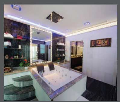
Flat 1301 Emirates Crown Dubai Marina