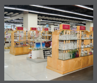
Al Maya Supermarket, Lamcy Plaza, Duba