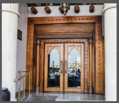
Arabian Courtvard & Spa. Dubai