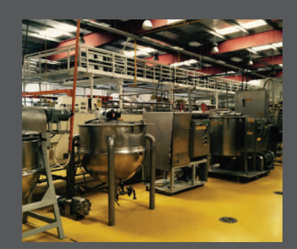
Caker's Food, Cake & Chocolate Factory, Duba