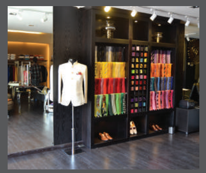
Vavci Men's wear showroom, Dubai