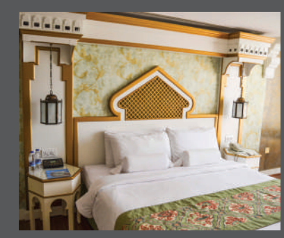
Arabian Courtvard & Spa. Dubai