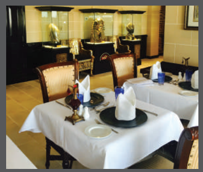
Pharaoh Cafe & Restaurant, Dubai