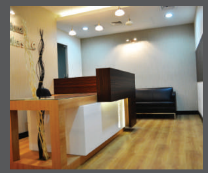
BIL International, Dubai