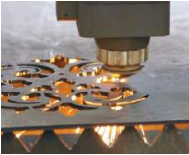
Laser Cutting Attention to Detail