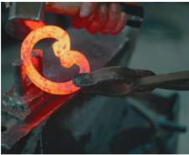
Metal Forging Always Prepared