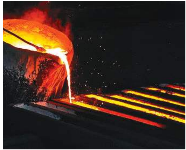
Metal Forming Brass & Aluminium Casting