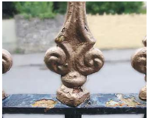
Maintenance Care & Repair