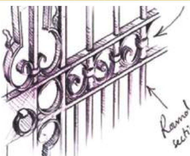
Custom Design Create Your Own Art