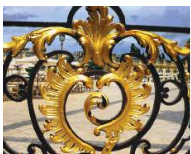
Gold Plating Expert Service