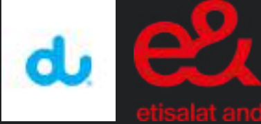
Du & ETISALAT