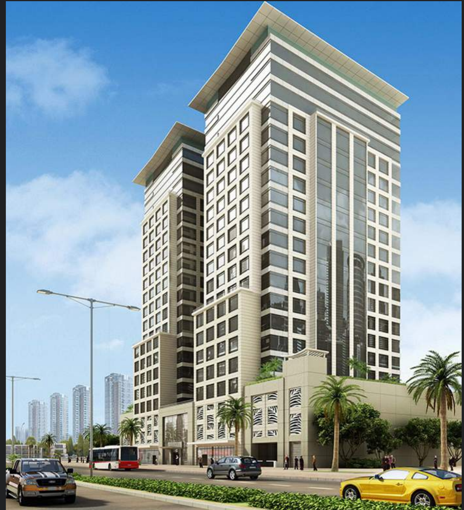
MADEENA TOWER | JLT, DUBAI, UAE