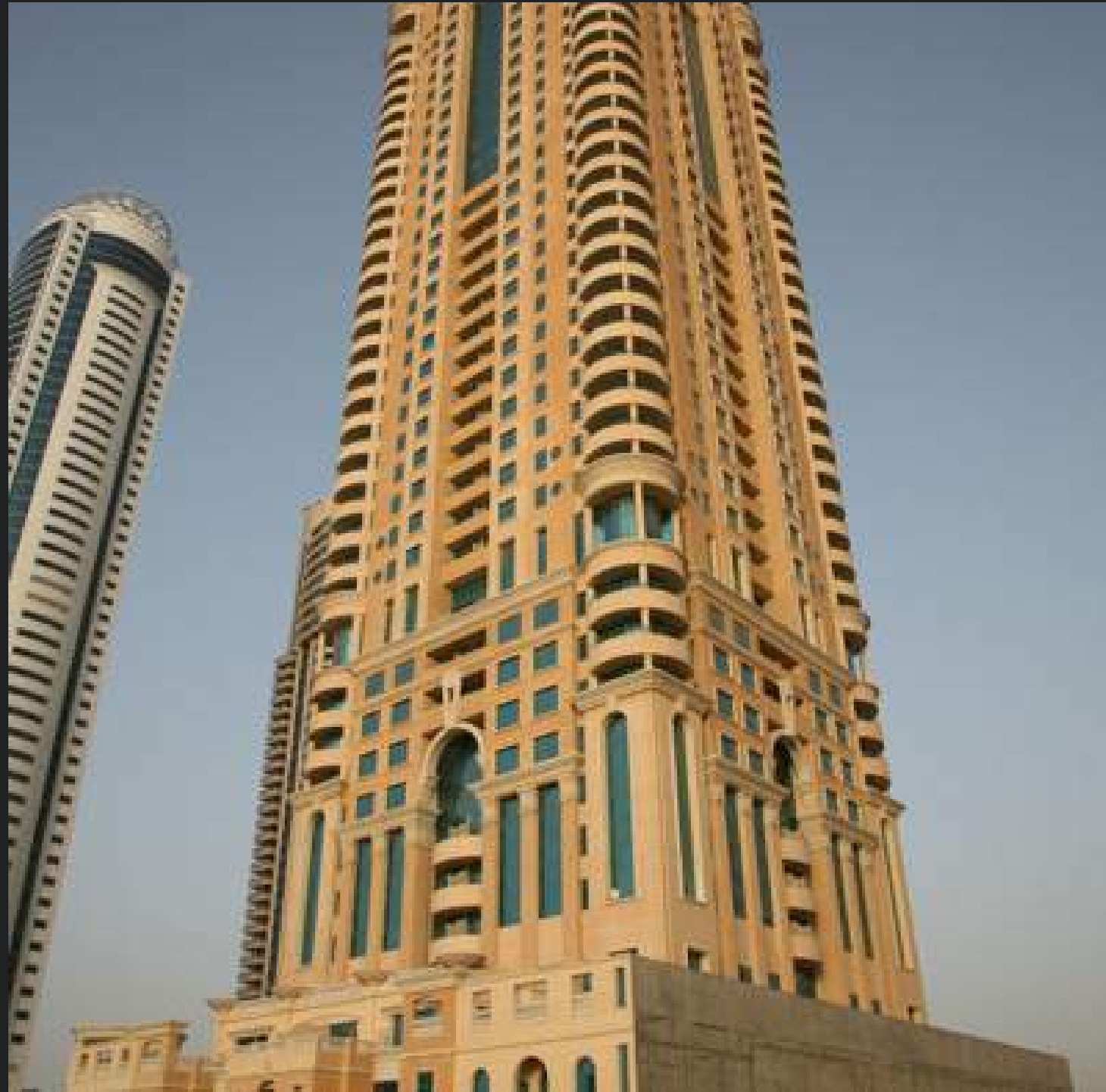
MARINA CROWN | DUBAI MARINA | DUBAI