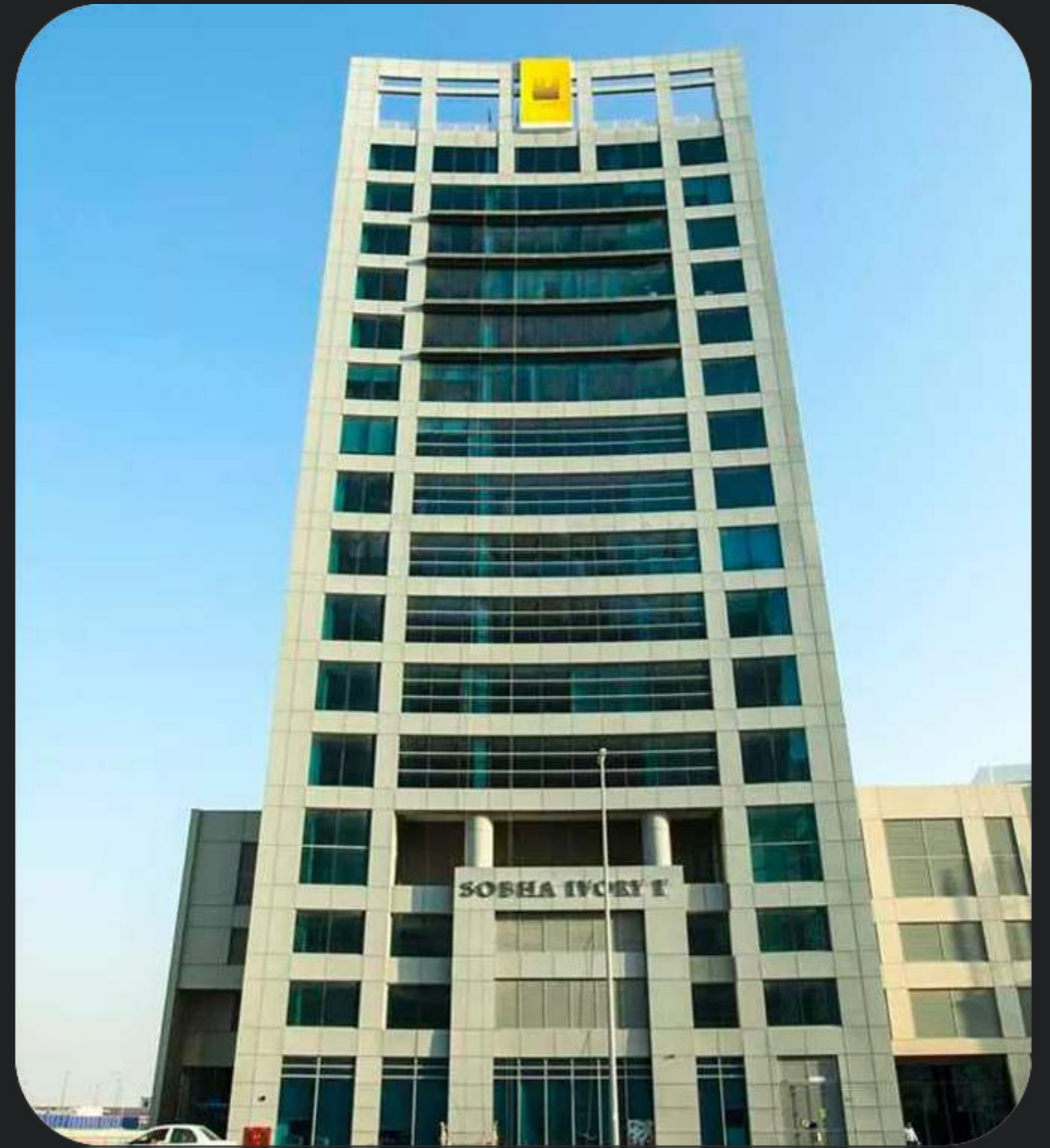
SOBHA IVORY II | BUSINESS BAY, DUBAI, UAE