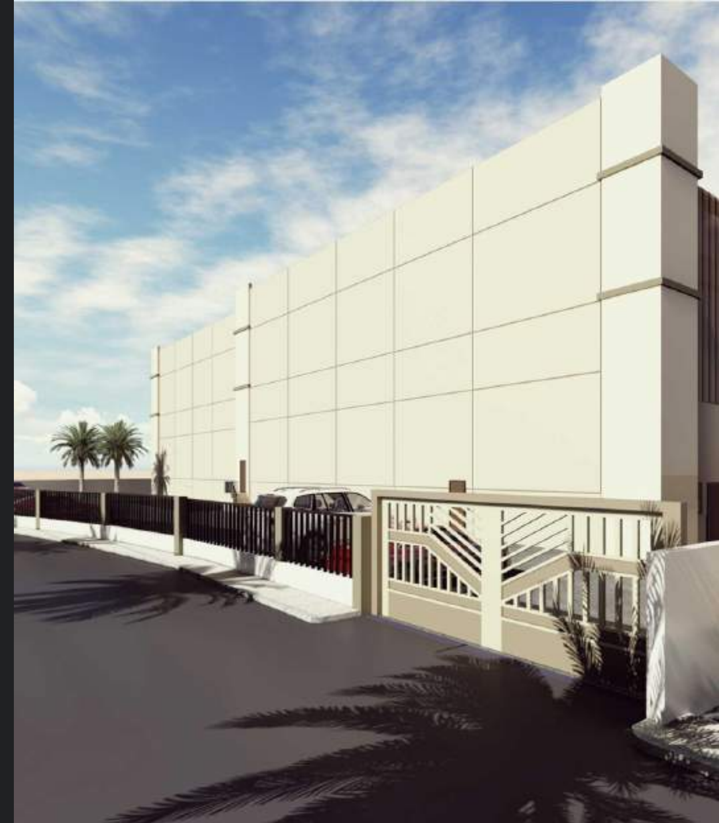
DIP WAREHOUSE & OFFICE BUILDING DUBAI INVESTMENT PARK SECOND, DUBAI, UAE