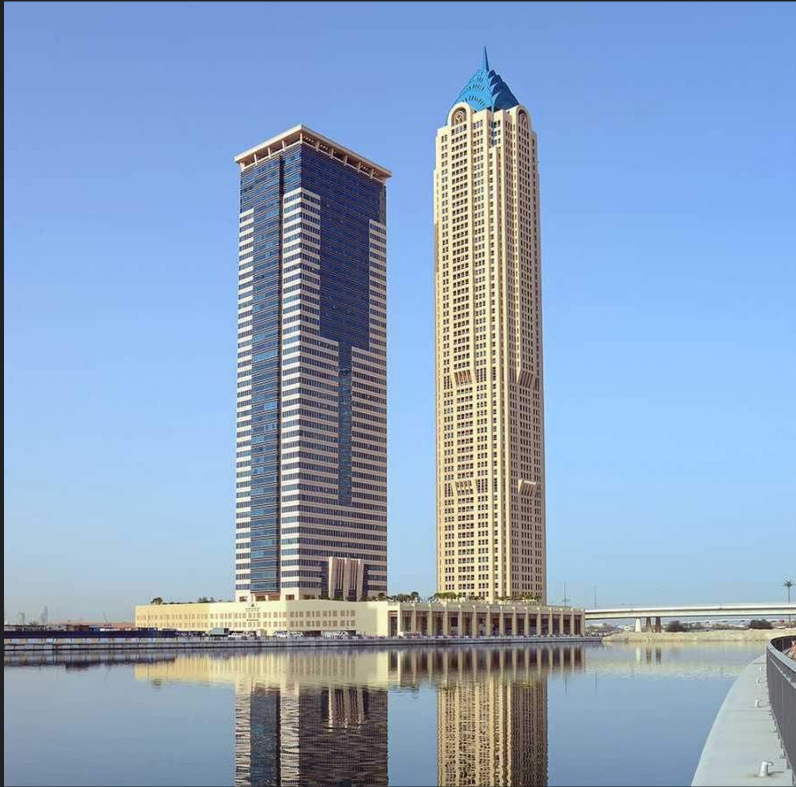
CHURCHILL TOWER | BUSINESS BAY, DUBAI, UAE