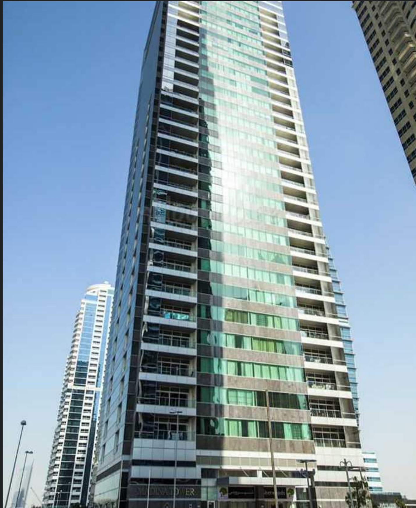
PRIME BUSINESS CENTER | JLT, DUBAI, UAE