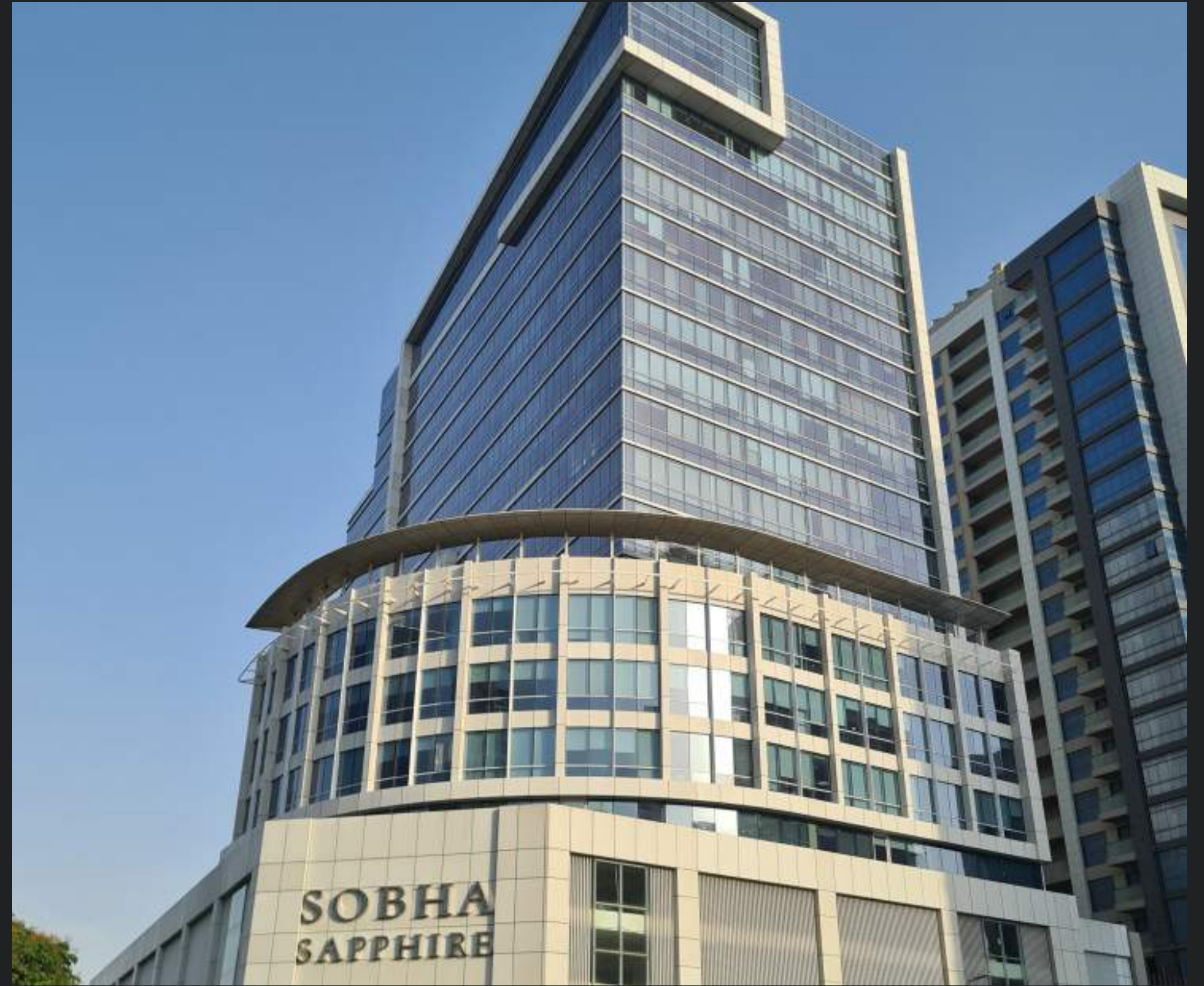
SOBHA SAPHIRE | BUSINESS BAY, DUBAI, UAE