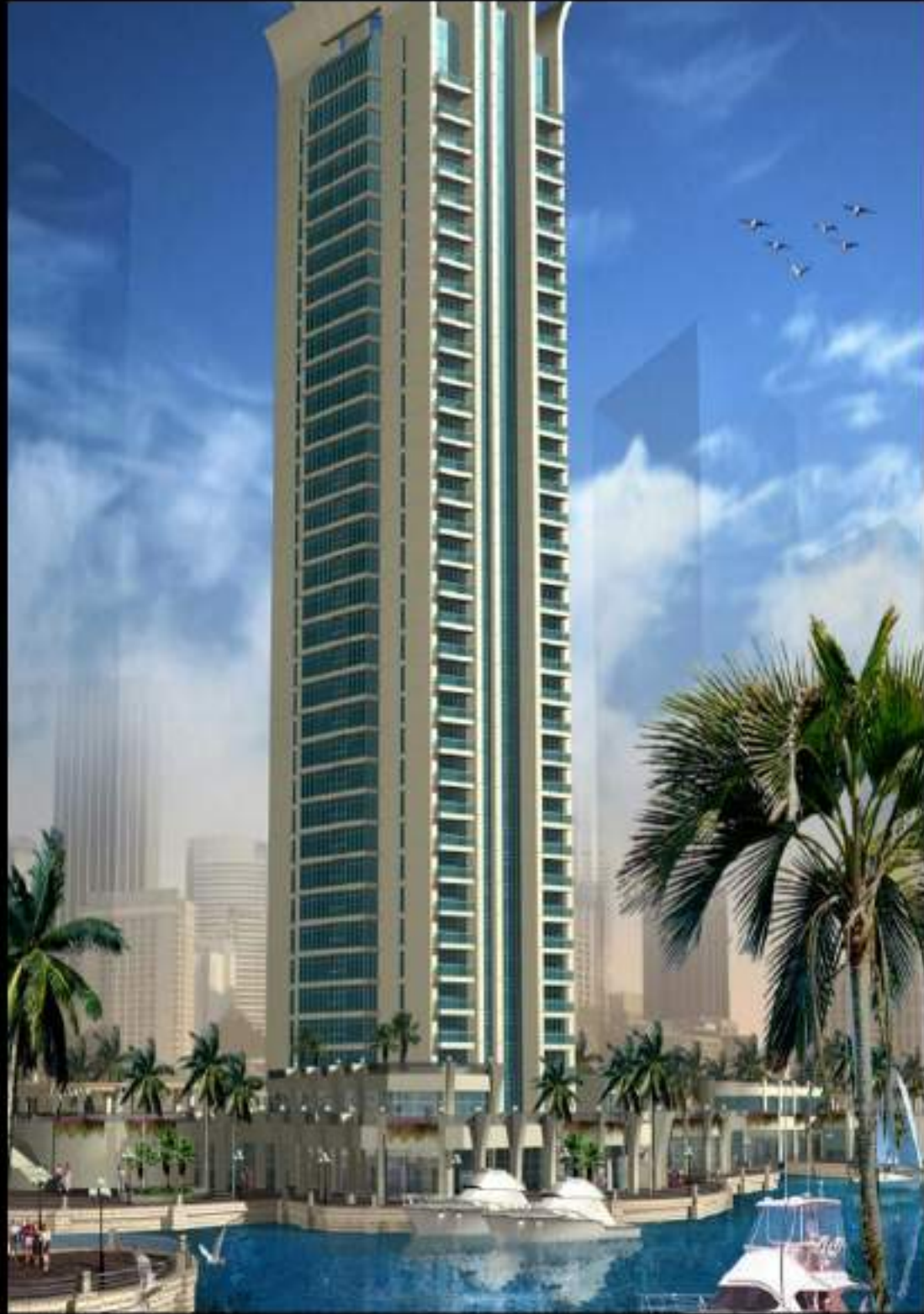
GOLD CREST | JLT, DUBAI, UAE