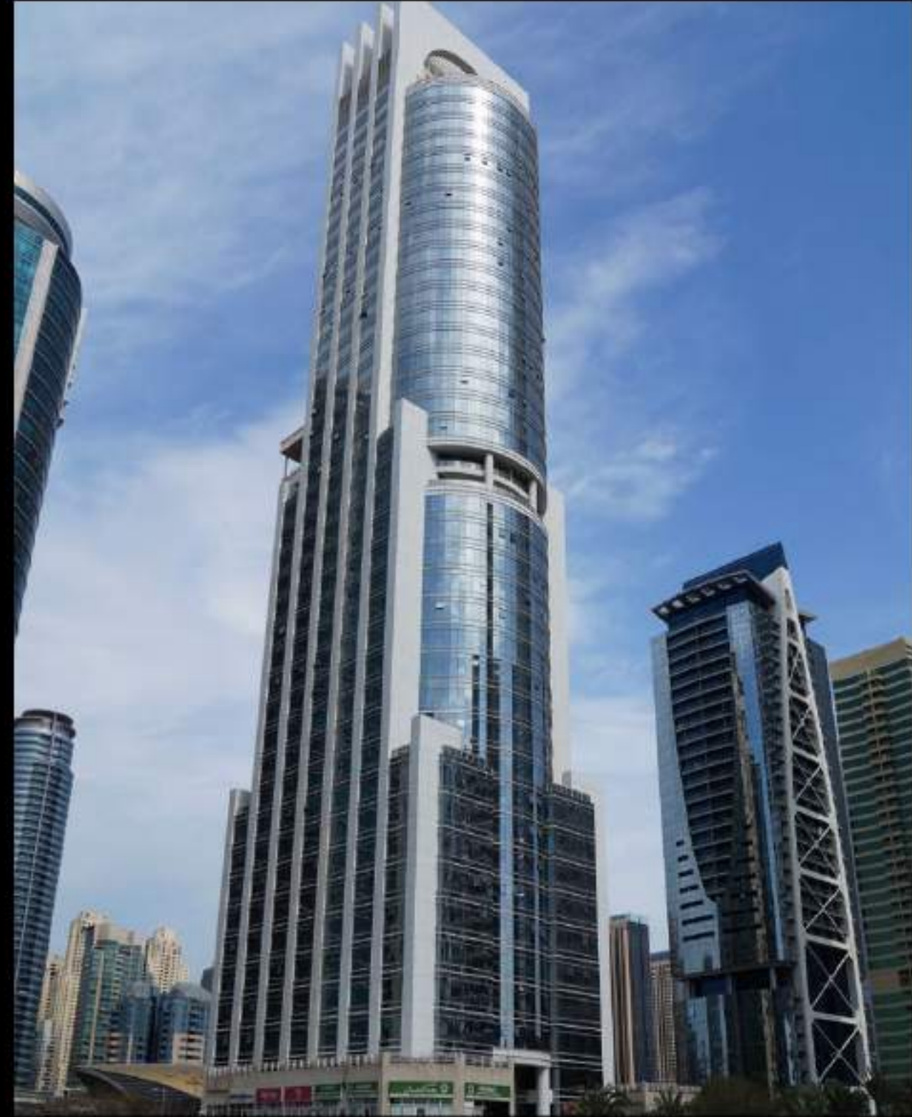
AL SEEF 3 | JLT, DUBAI, UAE