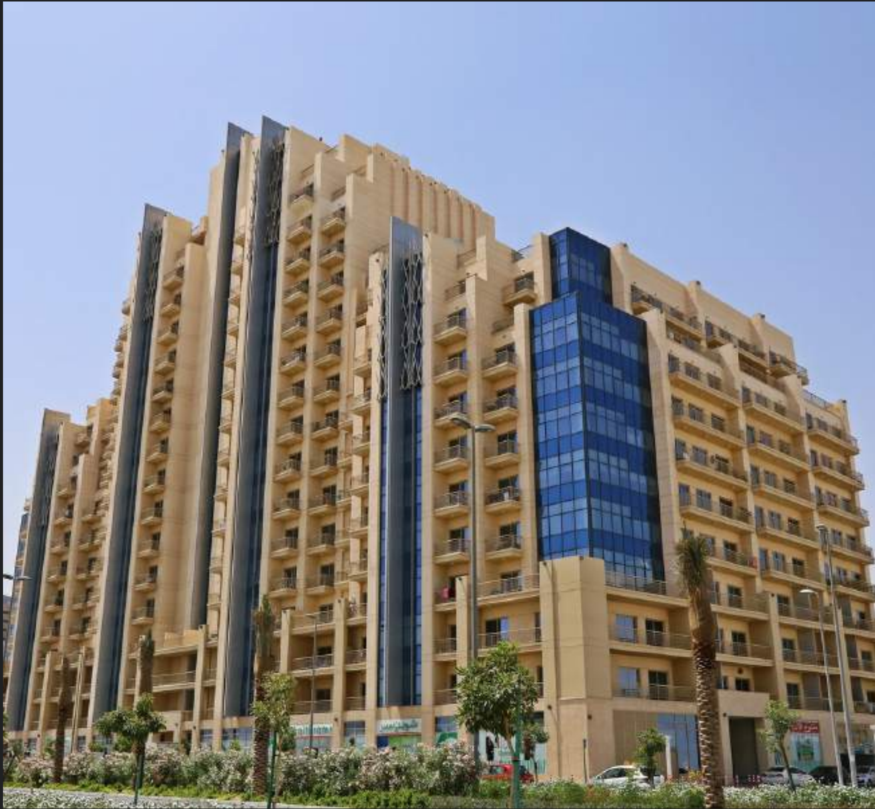
MANHATTAN TOWER | JVC | DUBAI