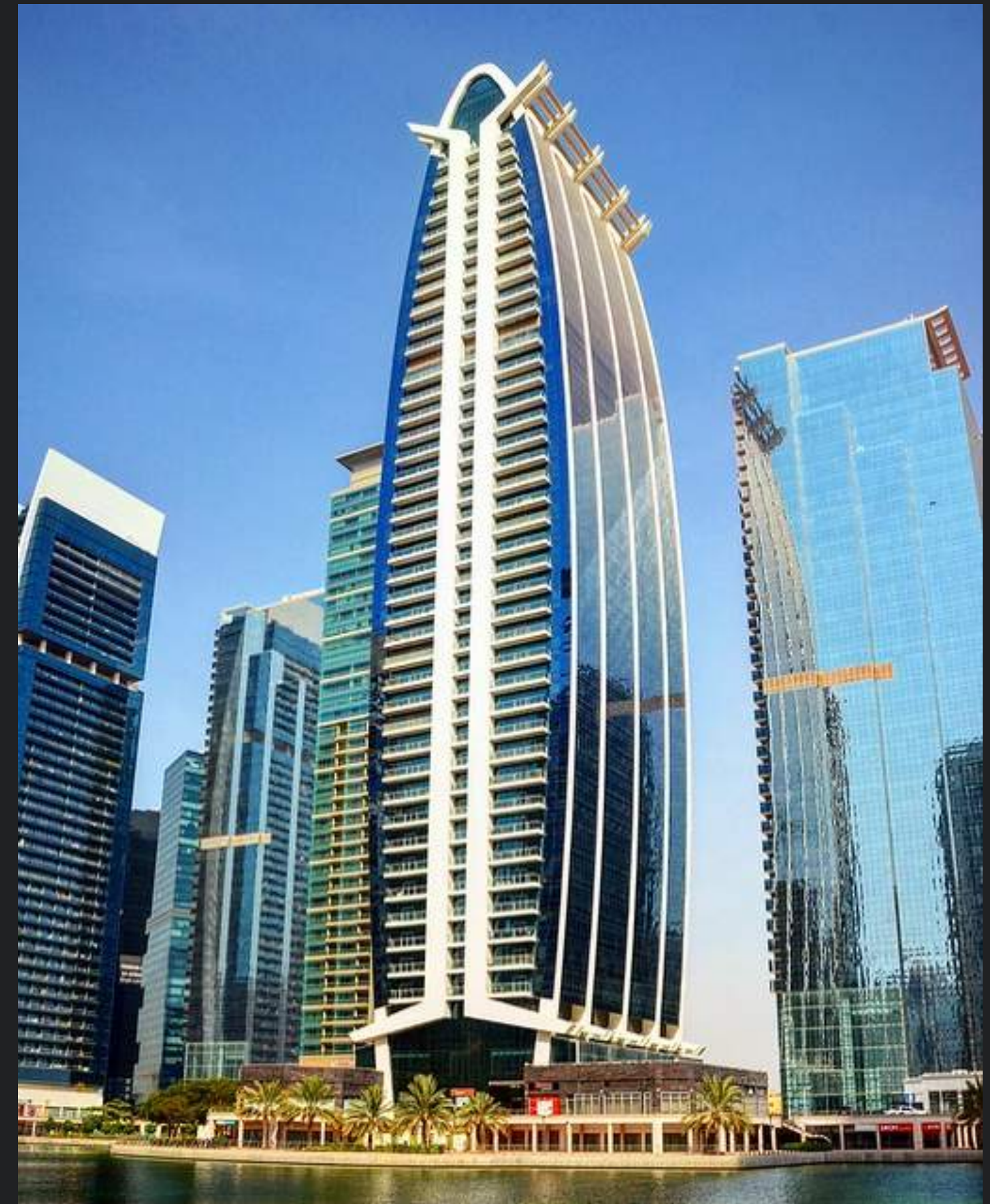
TIFFANY TOWER | JLT, DUBAI, UAE