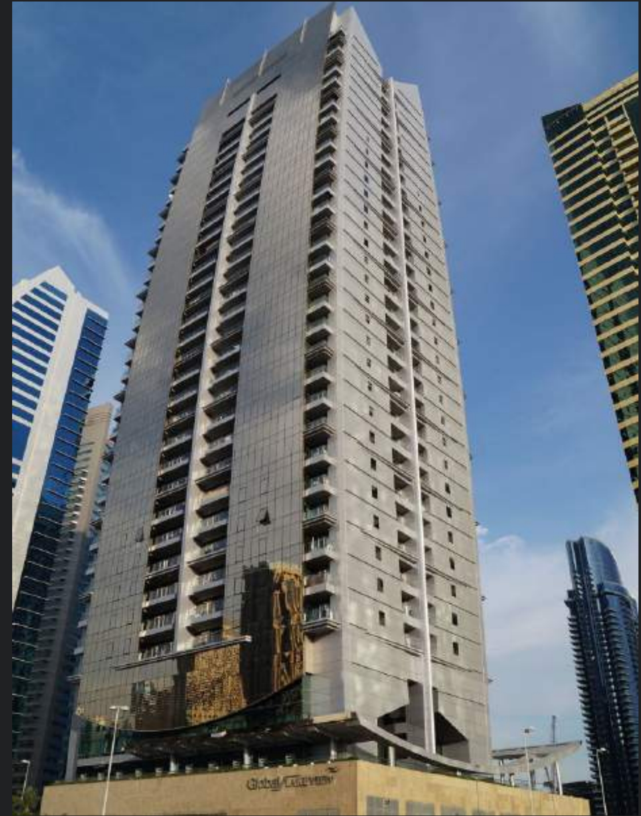
GLOBAL LAKE VIEW | JLT | DUBAI