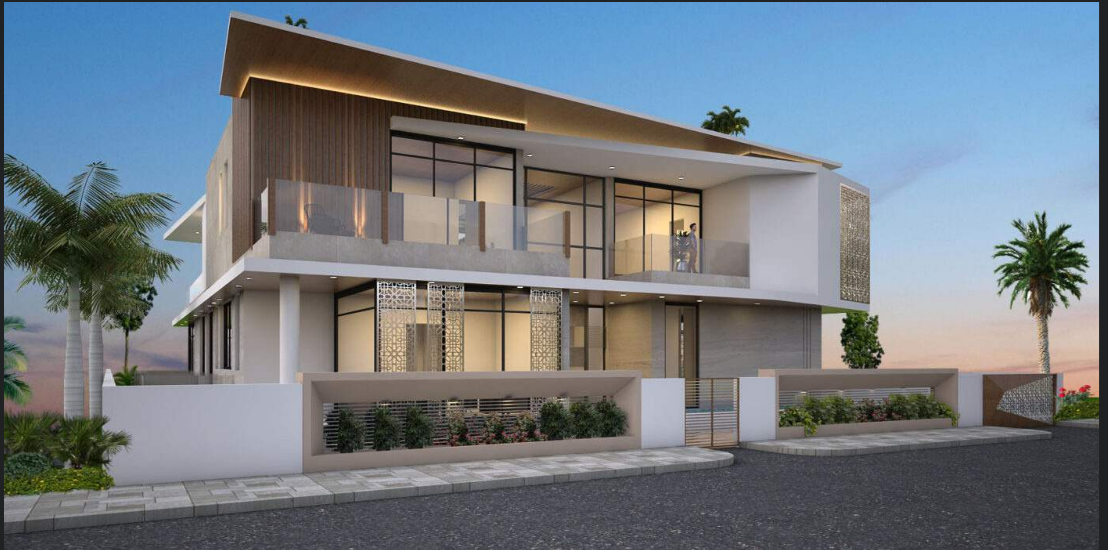
JUMEIRAH FIRST VILLA 661 | JUMEIRAH FIRST, DUBAI, UAE |