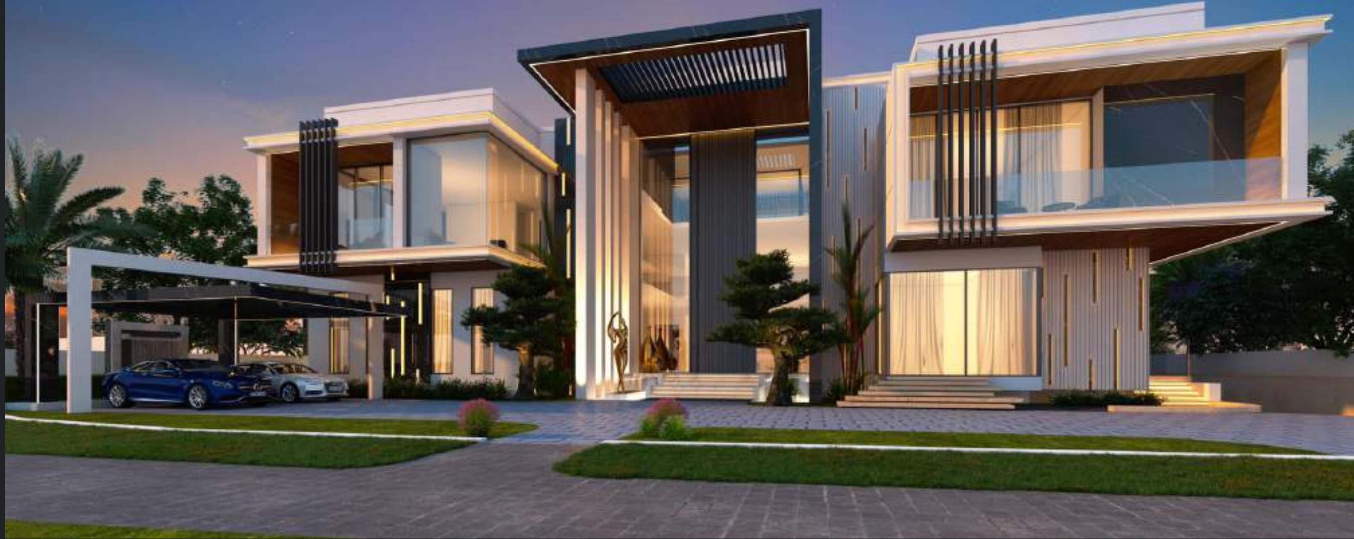
B+G+1 VILLA | DUBAI HILLS ESTATE 630, DUBAI | UAE |