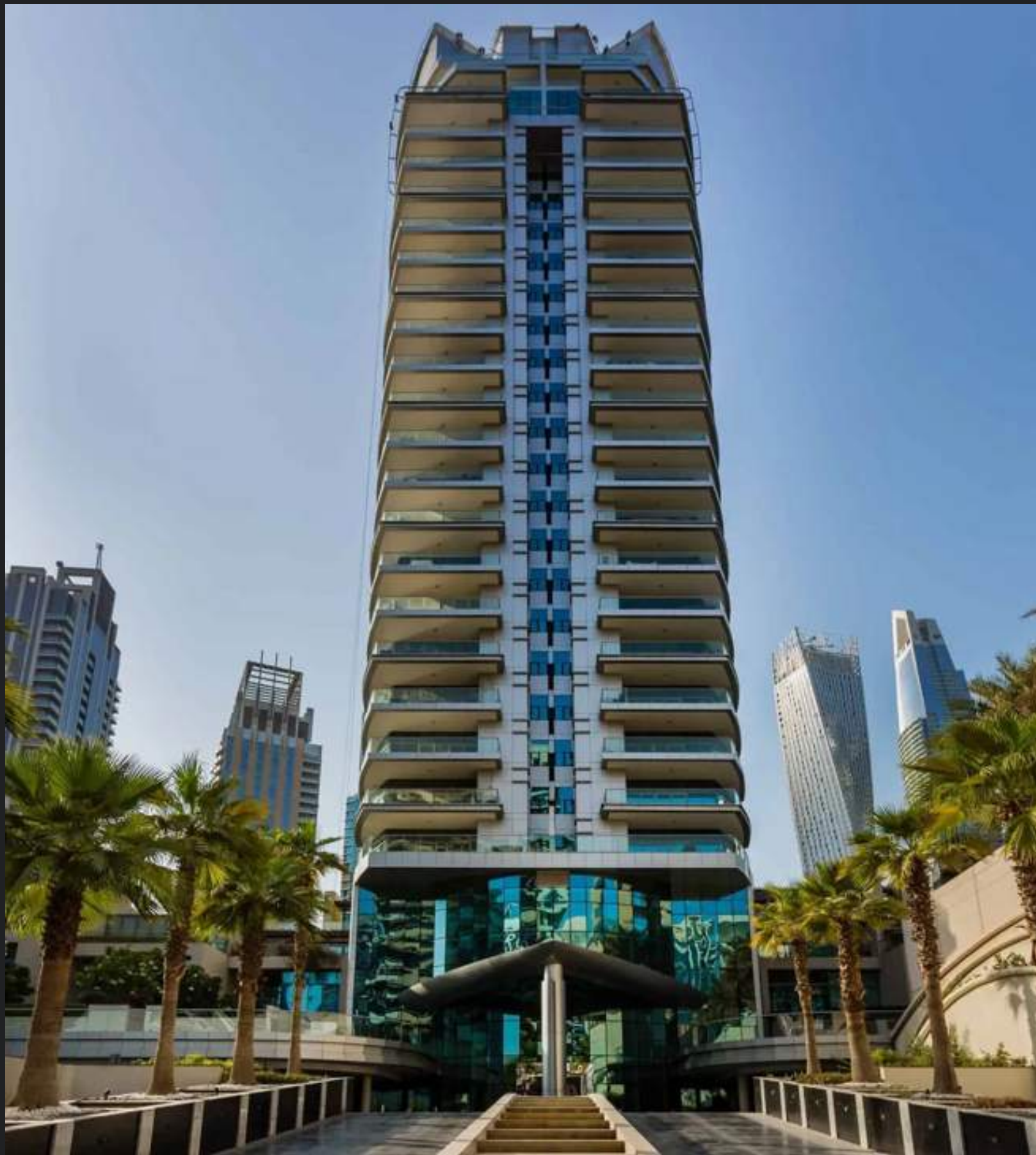
MARINA SCAPE OCEANIC | JLT, DUBAI, UAE