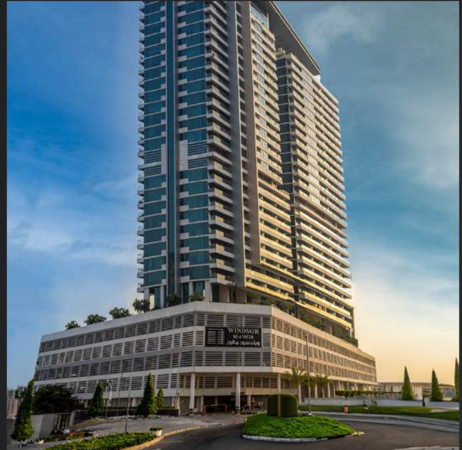
WINDSOR MANOR | BUSINESS BAY | DUBAI