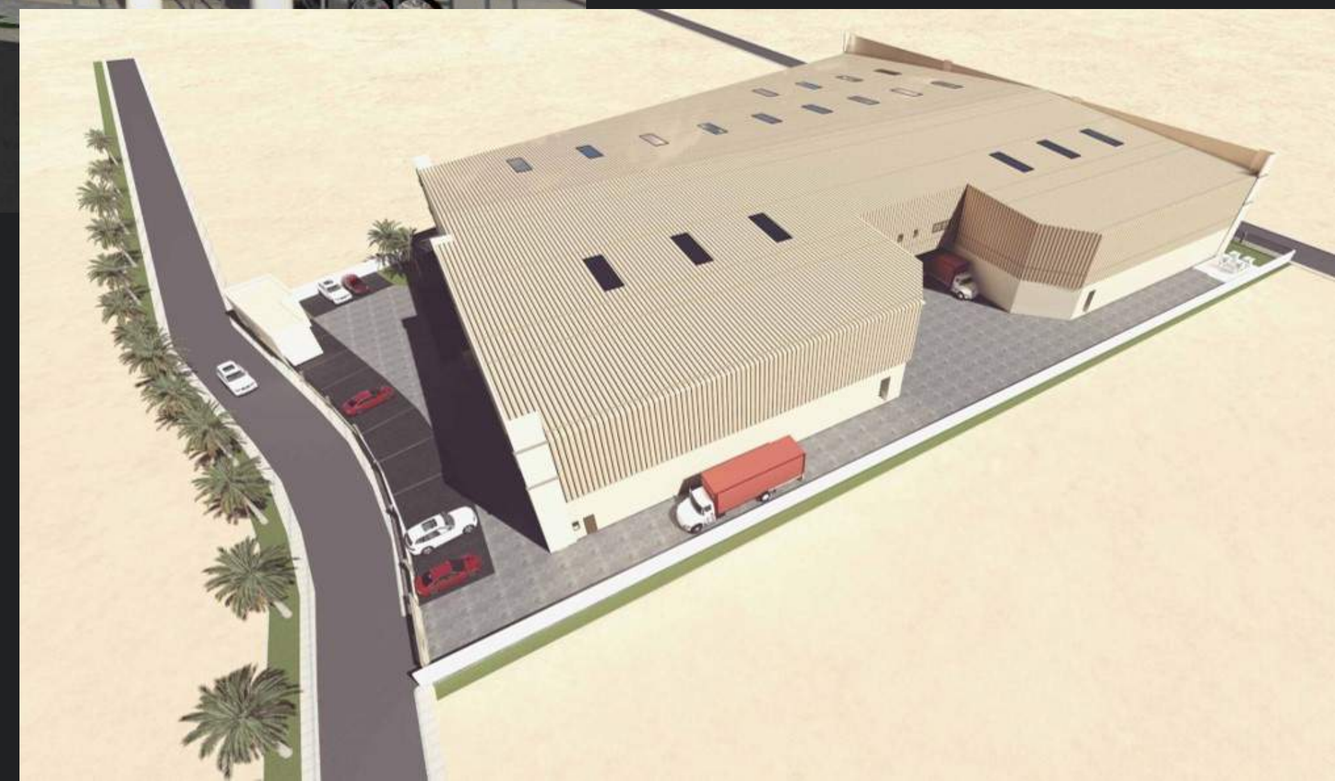
DIP WAREHOUSE & OFFICE BUILDING DUBAI INVESTMENT PARK SECOND, DUBAI, UAE