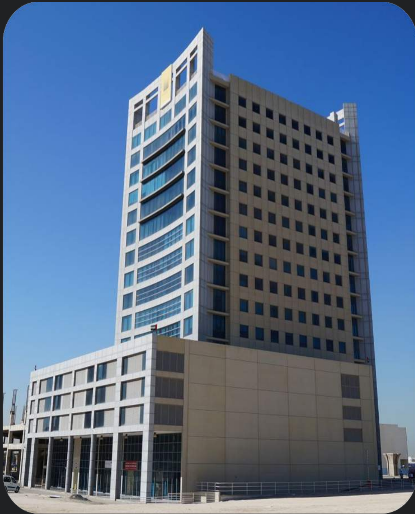
SOBHA IVORY I | BUSINESS BAY, DUBAI, UAE