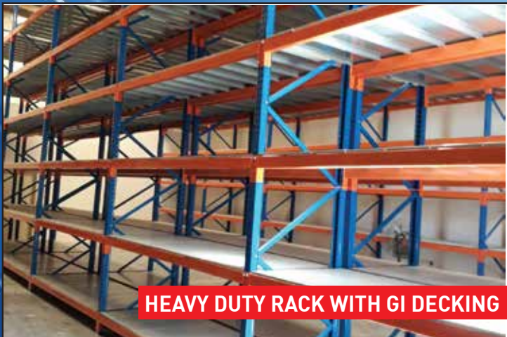
HEAVY DUTY RACK WITH GI DECKING