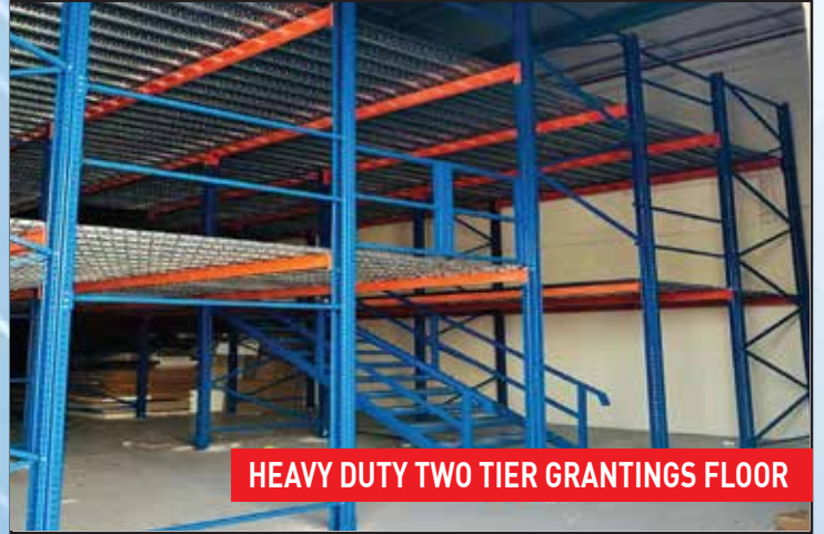
HEAVY DUTY TWO TIER GRANTINGS FLOOR