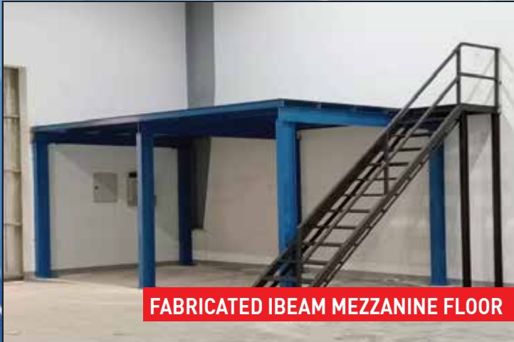
FABRICATED IBEAM MEZZANINE FLOOR