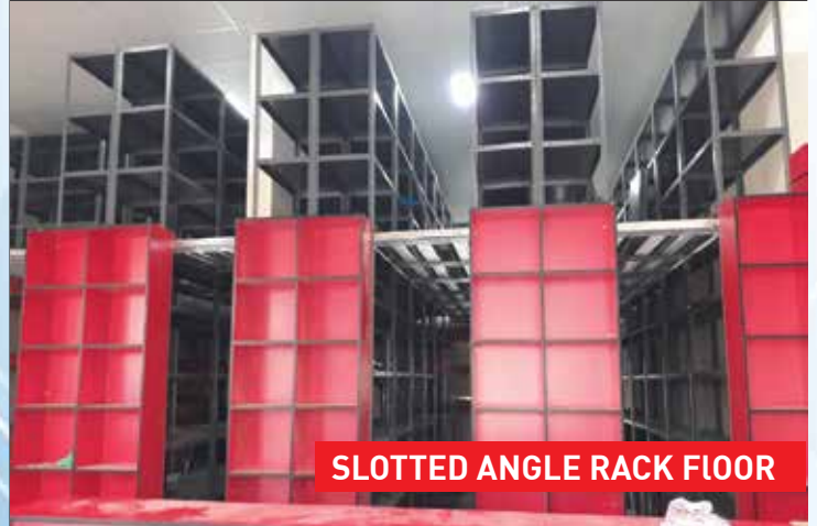
SLOTTED ANGLE RACK FLOOR