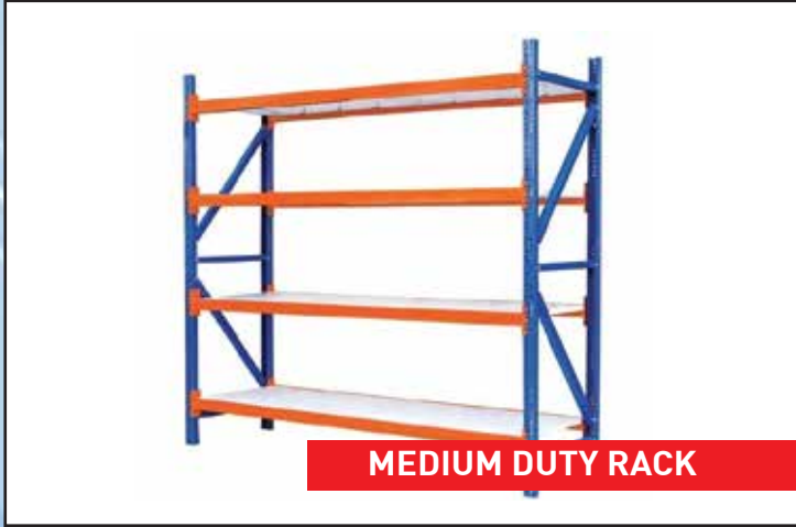
MEDIUM DUTY RACK