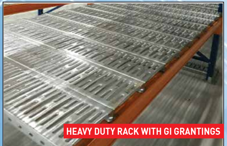
HEAVY DUTY RACK WITH GI GRANTINGS