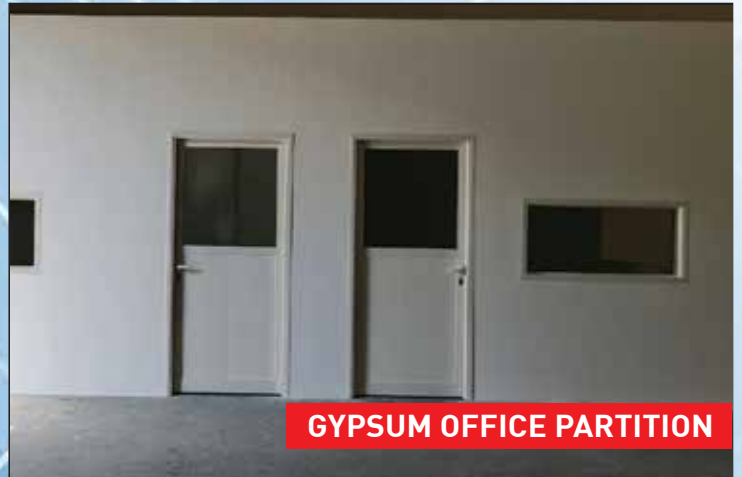
GYPSUM OFFICE PARTITION