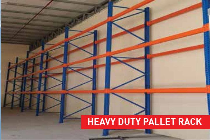
HEAVY DUTY PALLET RACK

ALL KIND OF WAREHOUSE STORE SOLUTION, HEAVY DUTY RACKING , MEDIUM DUTY RACKING , SLOTTED ANGLE RACK , GYPUSM AND GLASS AND STAINLESS STEEL WORK