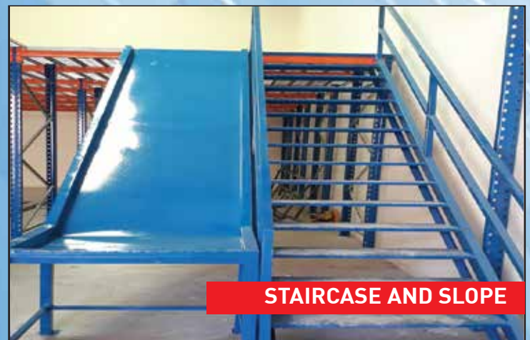
STAIRCASE AND SLOPE