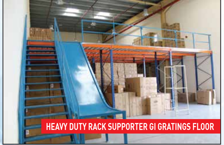
HEAVY DUTY RACK SUPPORTER GI GRATINGS FLOOR