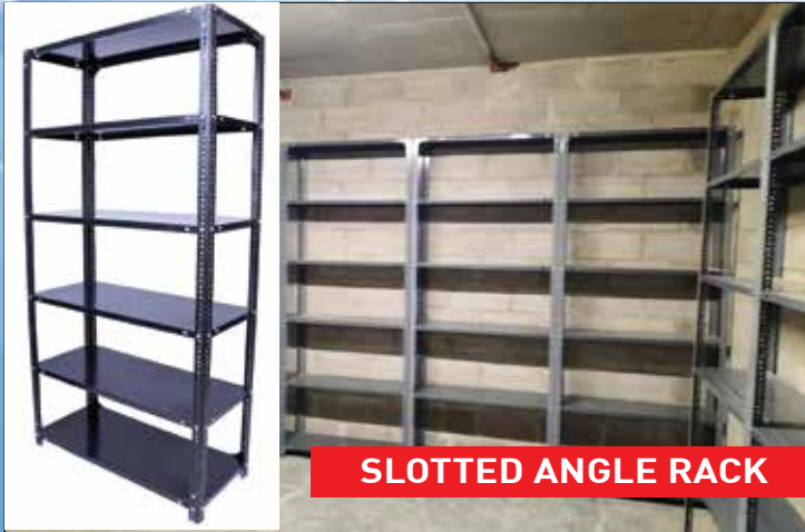
SLOTTED ANGLE RACK