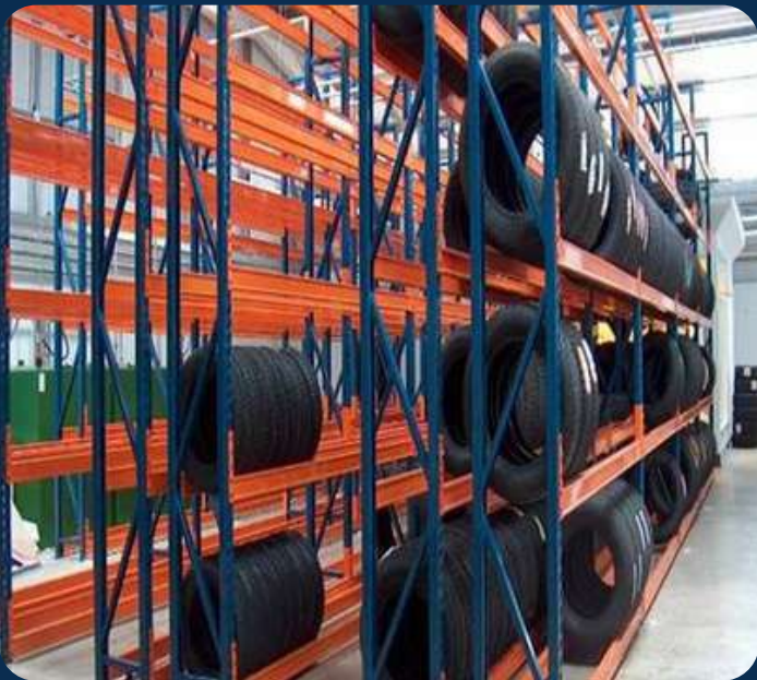
Tyre Racking Systems