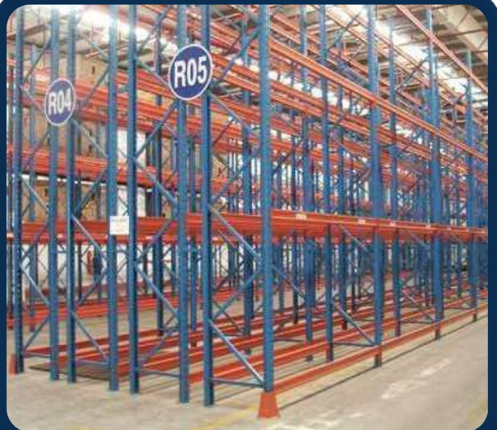
Double Deep Pallet Racking