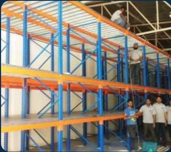
Carpet Storage Racking