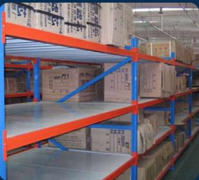
Long Span Racking