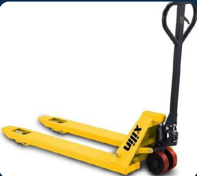
MANUAL PALLET TRUCK