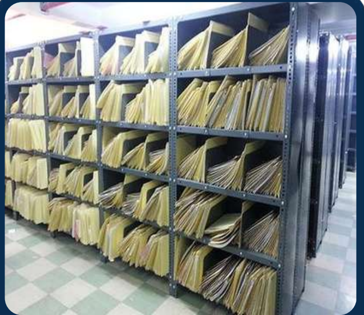
Slotted Angle Shelving