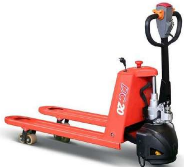
SEMI ELECTRIC PALLET TRUCK