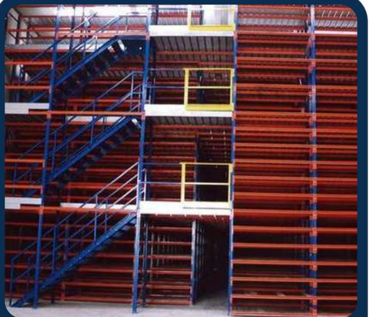
Multitier Racking System