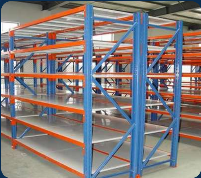
Medium Duty Racking