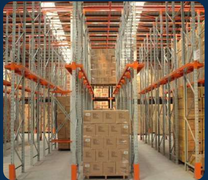
Drive-in Pallet Racking