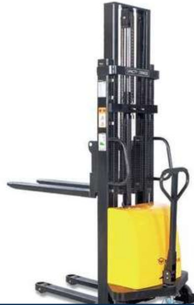
SEMI ELECTRIC STACKER