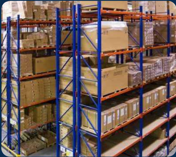
Selective Pallet Racking