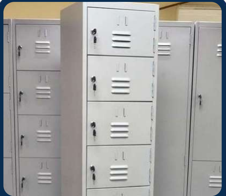
Metal Locker Cabinet