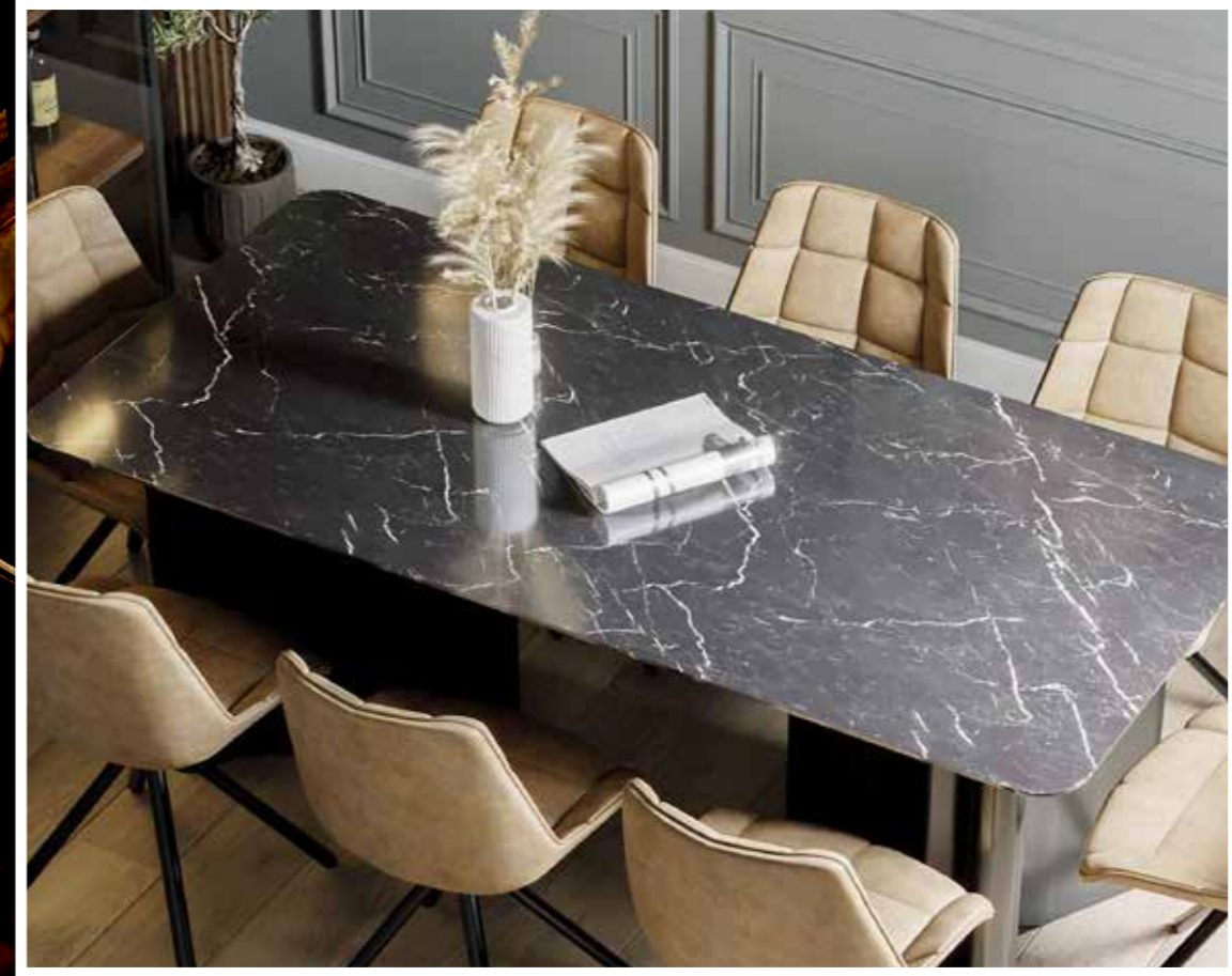
COFFEE / DINING TABLE TOPS