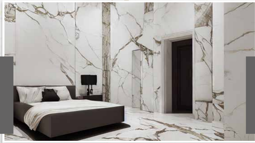
RESIDENTIAL Apartments / Villas