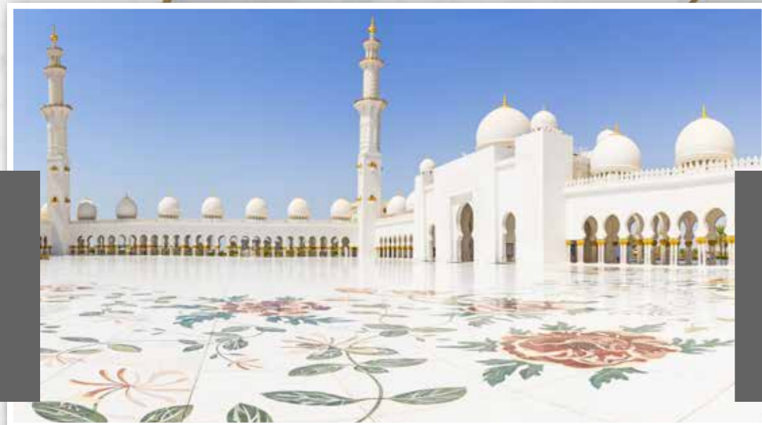
PUBLIC Malls, Mosques and other public places