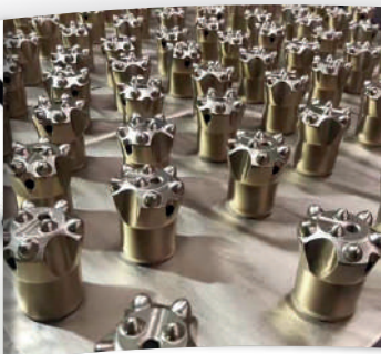
DRILL BITS FOR MINES