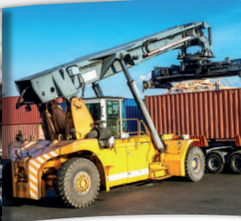
HEAVY EQUIPMENT SPARE PARTS