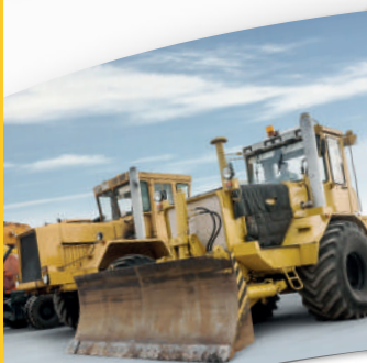
EARTH MOVING EQUIPMENTS