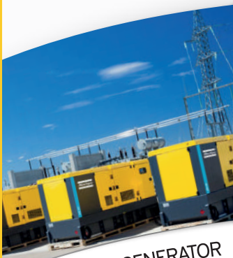
USED & NEW GENERATOR