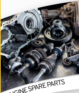
ENGINE SPARE PARTS