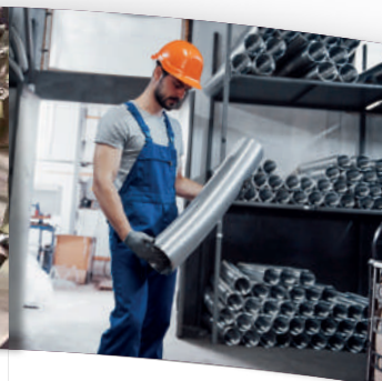
PIPES & VALVES