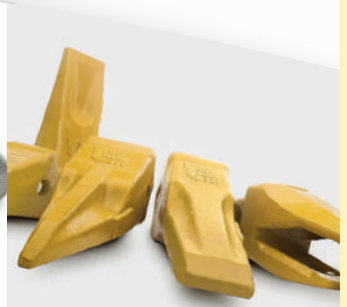
GET (GROUND ENGAGING TOOLS)