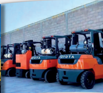
USED & NEW FORKLIFT