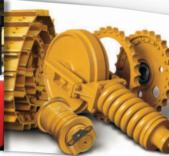
UNDER CARRIAGE PARTS