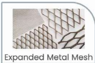
Expanded Metal Mesh