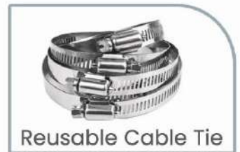
Reusable Cable Tie