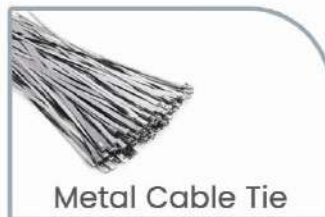
Metal Cable Tie