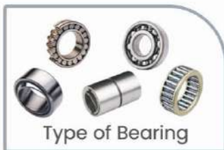
Type of Bearing