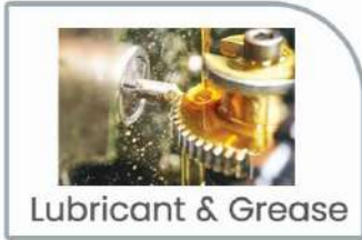
Lubricant & Grease