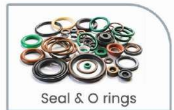
Seal & O rings