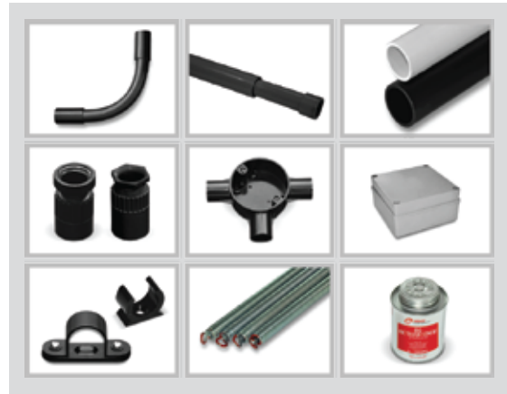
PVC PIPES & ACCESSORIES