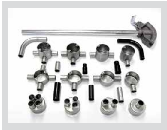
GI CONDUITS & ACCESSORIES