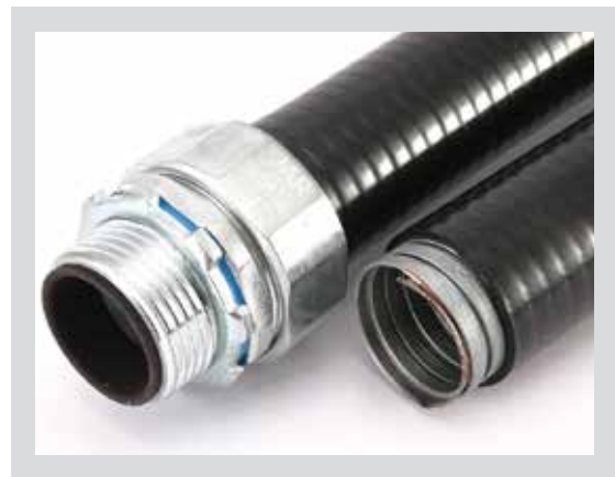
GI FLEXIBLE PIPES & ACCESSORIES