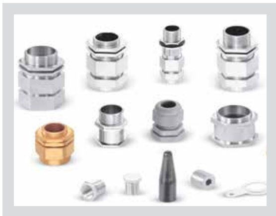
LUGS & GLANDS