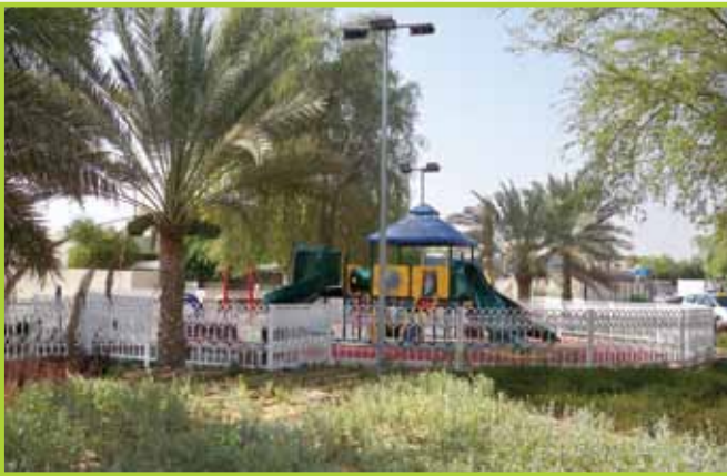
NEXT TO SIGNAL PLAY AREA NO:1