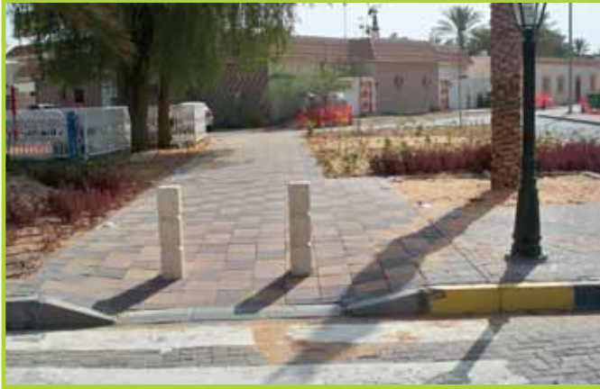
NEXT TO SIGNAL RIGHT SIDE NEAR PLAY AREA NO: 1