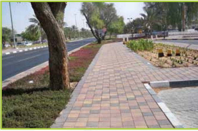
NEXT TO SIGNAL RIGHT SIDE AREA