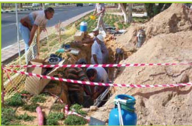
CABLE ROUTECROSSING BY ELECR CONT M/S HELIO POLIS ELECT CO L.L.C.