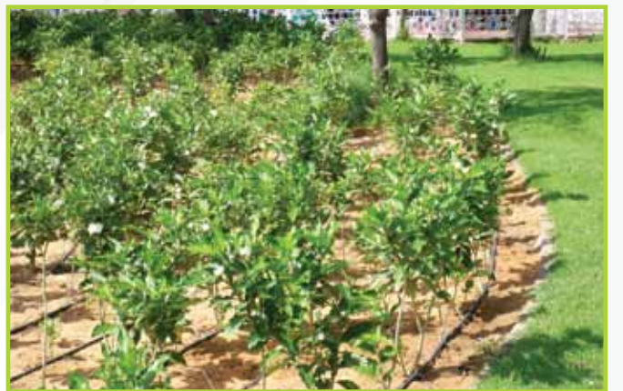
PLANT NEXT TO MUBARAK R/A NEAR PLAY AREA NO:2