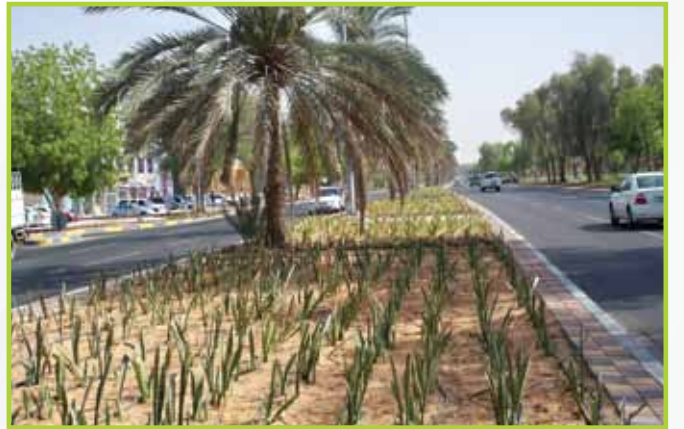
AFTER SIGNAL OPP POLICE STATIONCENTRE MEDIAN AREA