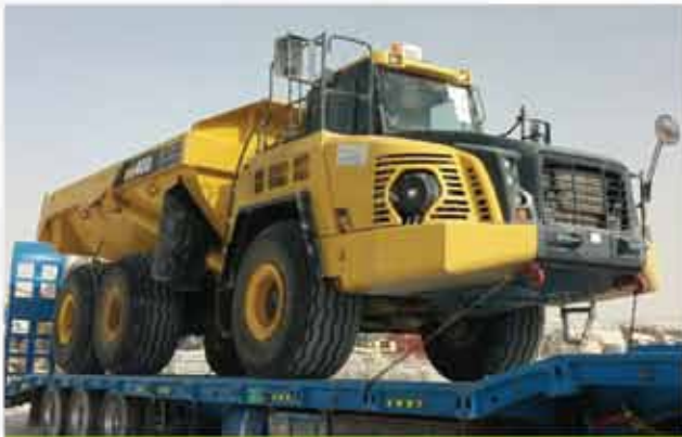
ARTICULATED DUMPERS TRUCK