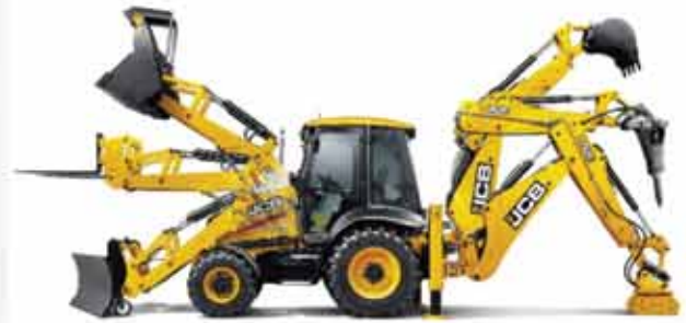
JCB BACKHOE LOADER