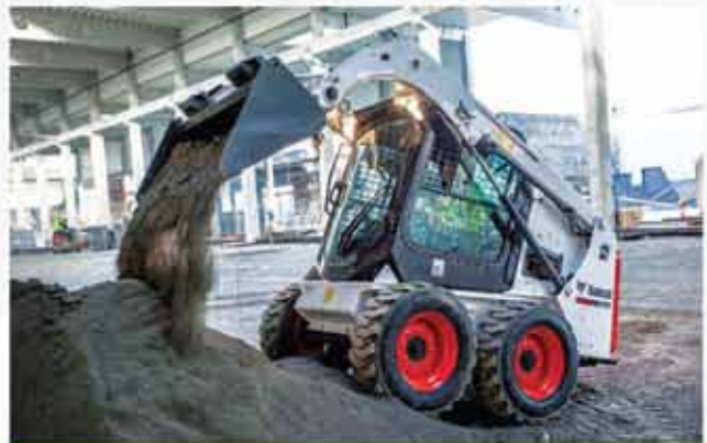
SKID LOADER (BOBCAT)