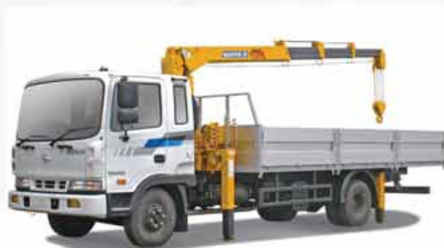
HIAB TRUCK /PESCI CRANE