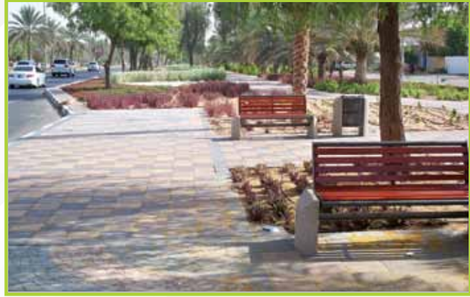
NEXT TO SIGNAL RIGHT SIDE LAY BY AREA