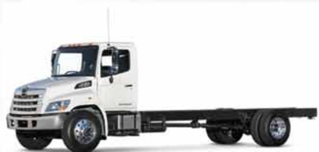
FLATBED RECOVERY TRUCK