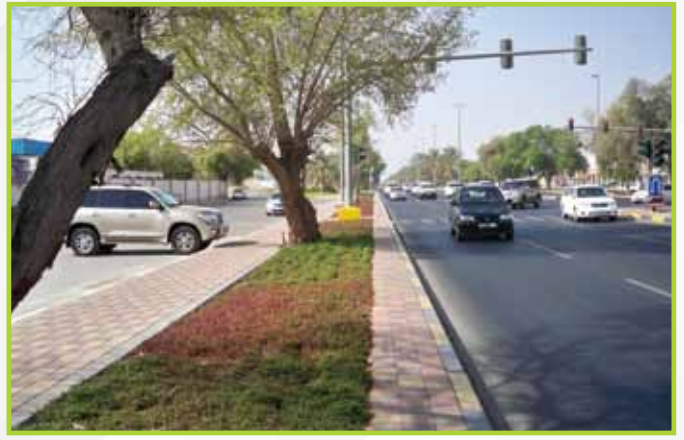
NEXT TO SIGNAL OPP SCHOOL AREA