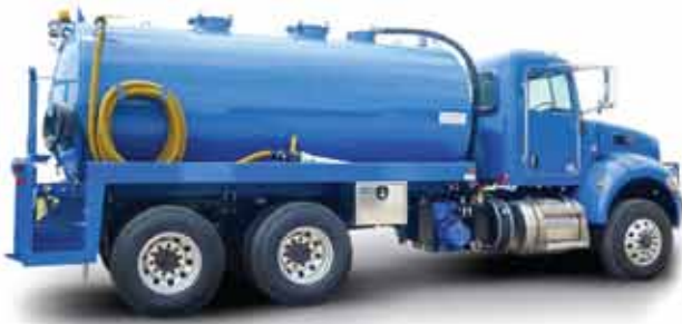
SWEET/SEWAGE & SALT WATER SERVICE