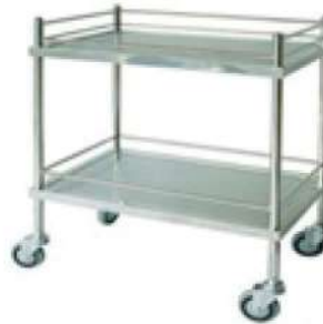
INSTRUMENT TROLLEY WITH TWO SHELF