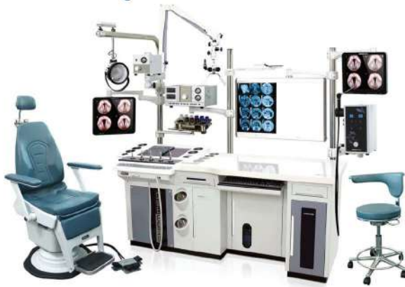
ENT FULL SET