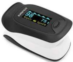
FINGER PULSE OXIMETER