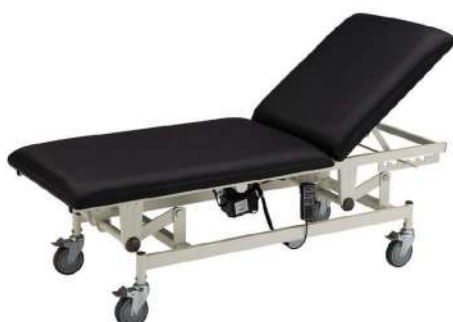
ELECTRIC EXAMINATION COUCH