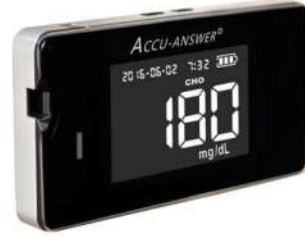
MULTI MONITORING SYSTEM