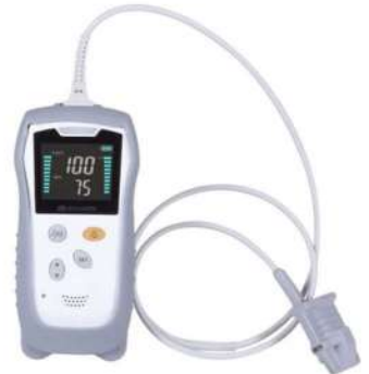
HANDHELD PULSE OXIMETER