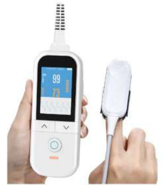
HANDHELD PULSE OXIMETER