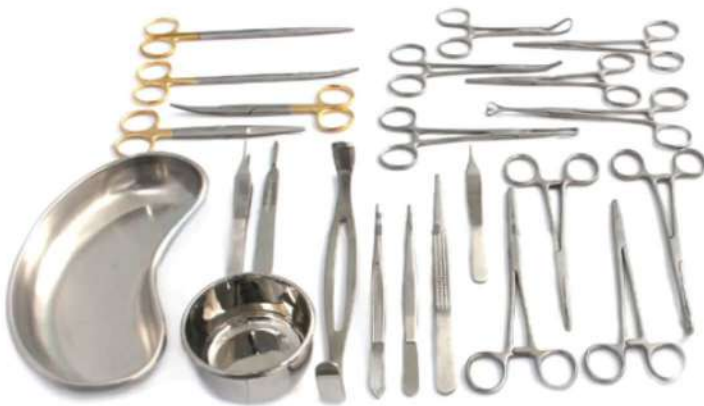
APPENDIX SURGERY SET