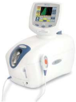
TRITON TRACTION UNIT