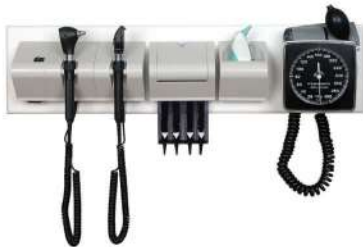
DIAGNOSTIC SET WALL MOUNTED