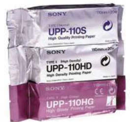
SONY ULTRASOUND PAPER