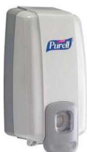
PURELL MANUAL DISPENSER