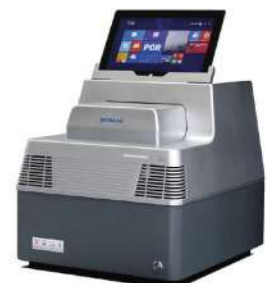
REAL TIME PCR