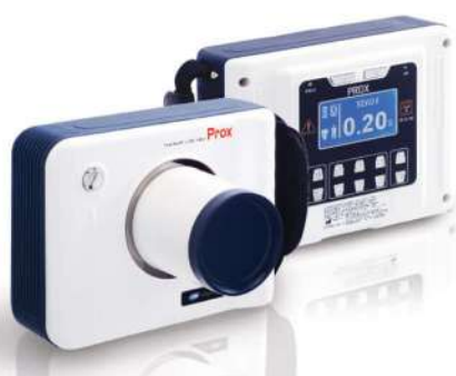
PORTABLE DENTAL X-RAY