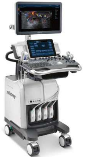
MINDRAY DC 80 X