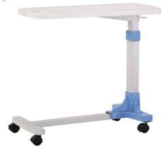
OVER BED TABLE