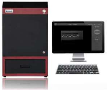
AUTOMATIC GEL IMAGING & ANALYSIS SYSTEM