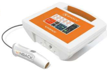
R SHOCK WAVE