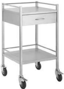
INSTRUMENT TROLLEY WITH ONE DRAWER