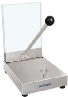
BLOOD PLASMA EXTRACTOR