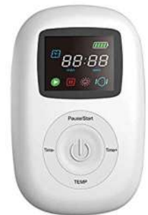
INFRARED CERVICAL VERTEBRA NECK PAIN