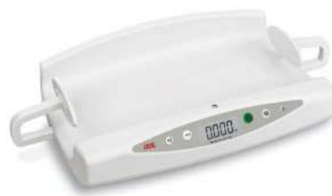
BABY HEIGHT AND WEIGHT SCALE