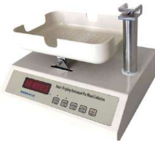
BLOOD COLLECTION MONITOR