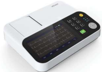
ECG MACHINE 3 CHANNEL