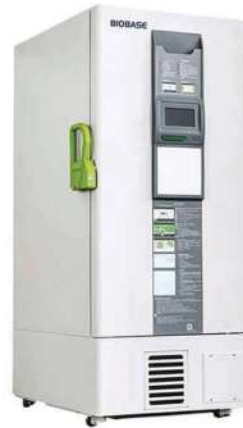
BLOOD BANK FREEZER