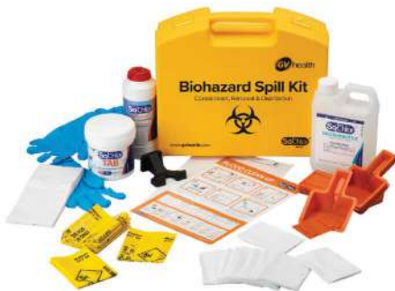
BIOHAZARD SPILL KIT