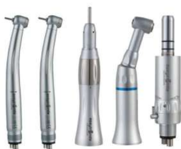
HAND PIECE KIT