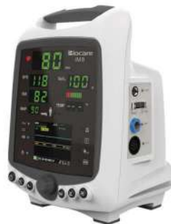
VITAL SIGN MONITOR