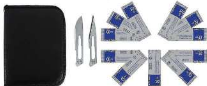
MINOR SURGERY KIT