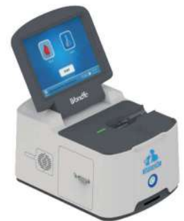
BLOOD GAS ANALYZER