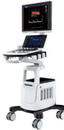
KIRAN SONORAD V10