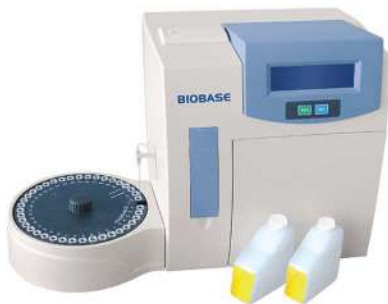
AUTO ELECTROLYTE ANALYZER