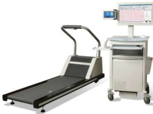
STRESS TEST SYSTEMS