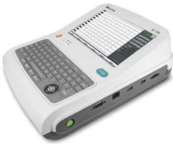
ECG MACHINE 12 CHANNEL