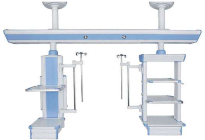
CEILING MOUNTED PANDANT