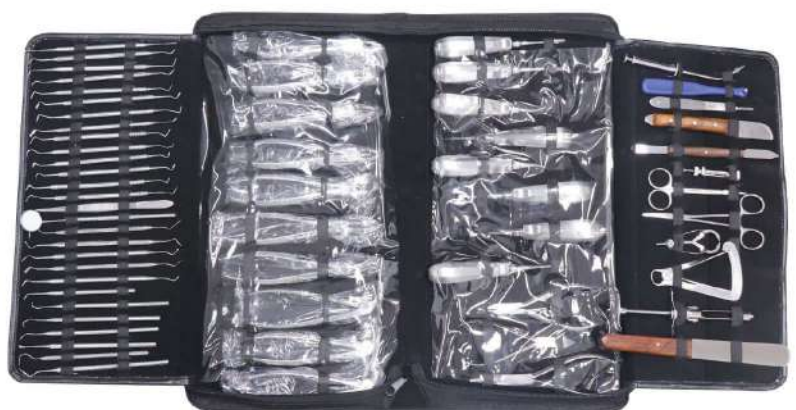
DENTAL INSTRUMENT KIT