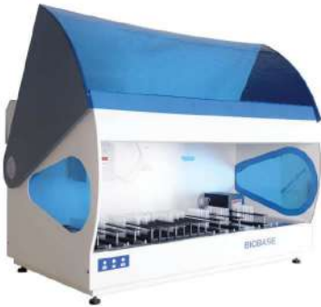
AUTOMATED ELISA PROCESSOR