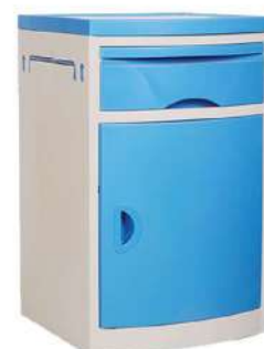
BED SIDE CABINET