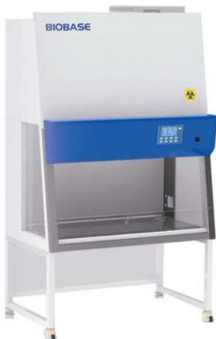
BIOLOGICAL SAFETY CABINET