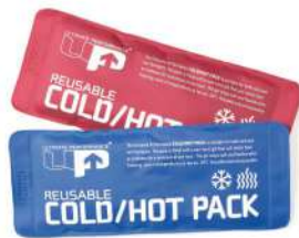
COLD &amp; HOT PACK