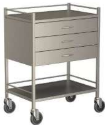
INSTRUMENT TROLLEY WITH THREE DRAWER