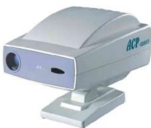
AUTO CHART PROJECTOR