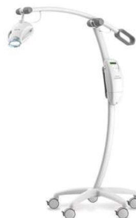
WHITENING MACHINE ZOOM