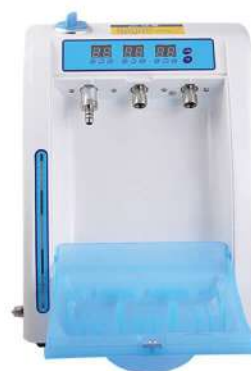
HAND PIECE LUBRICANT