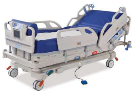
ELECTRIC BED WITH MATTRESS