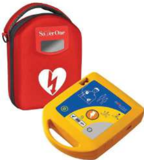
AED MACHINE SEVER ONE