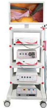
ENT ENDOSCOPY SYSTEM