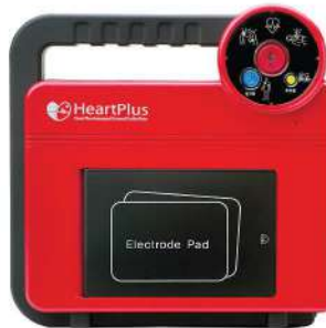
AED MACHINE HEART PLUS