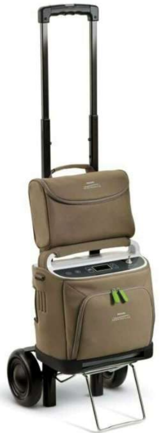
PORTABLE OXYGEN CONCENTRATOR