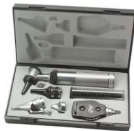
OTOSCOPE DIAGNOSTIC SET