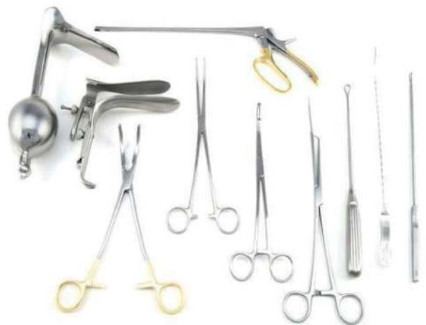
GYNIC INSTRUMENT SET