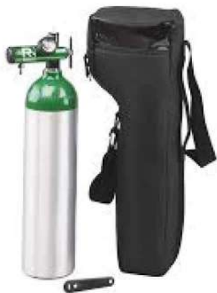
PORTABLE OXYGEN CYLINDER