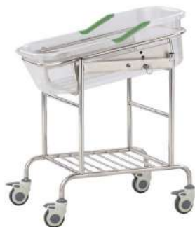
NEW BORN BABY BED