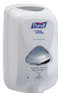
PURELL DISPENSER AUTOMATIC