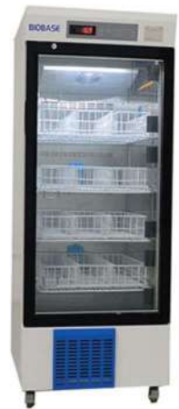
BLOOD BANK REFRIGERATOR