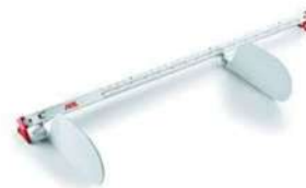
LENGTH MEASURING ROD