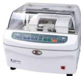
AUTO LENS EDGER