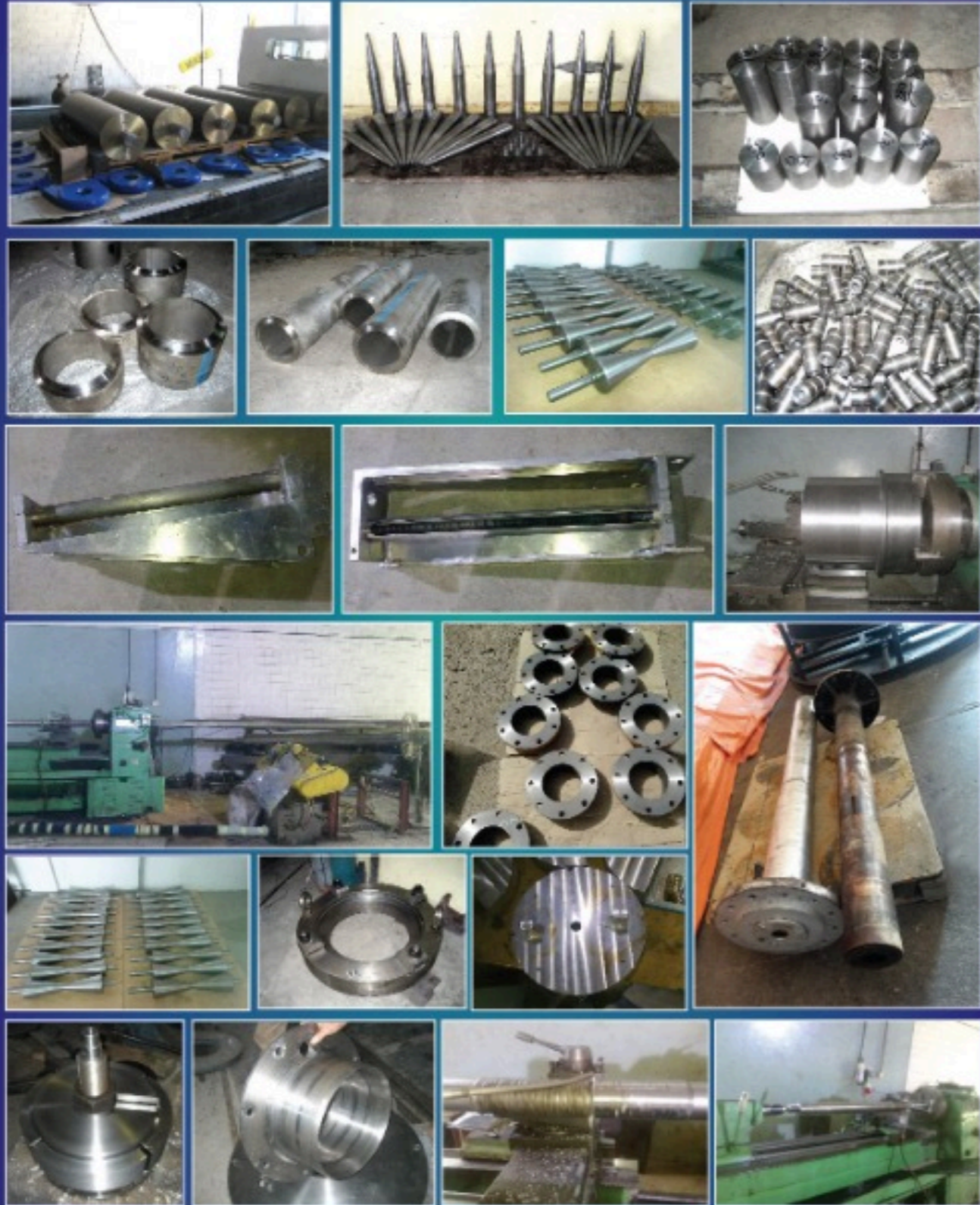
PEERLES METAL & STEEL WORKS L.L.C.