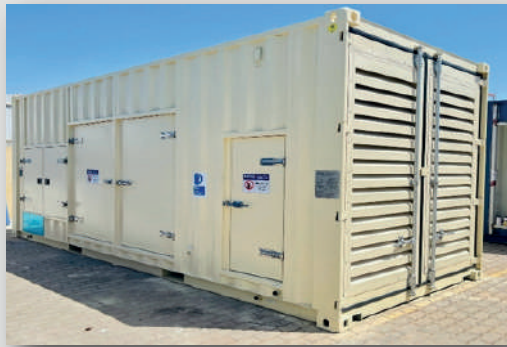
MODIFIED 20 FT ISO CONTAINER TO ACHIEVE A SOUND LEVEL OF APPROX. 85 DB @ 7 METER