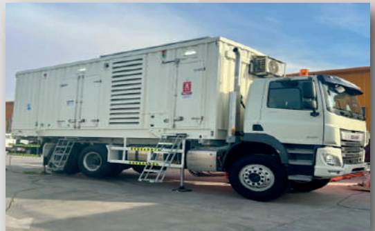
Truck Mounted Mobile Enclosure for 625kVA VolvoPenta Genset; Noise Level 70dB @ 10 mtr