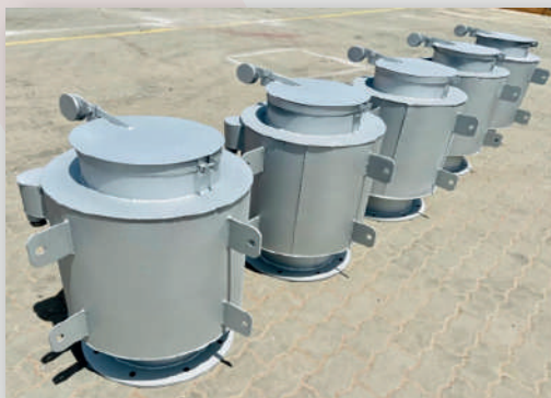
8" SPARK ARESTOR WITH RAIN CAP