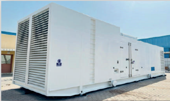
DESIGN, SUPPLY & MANUFACTURING OF 14MTR SOUND PROOFING GENSET ENCLOSURE PACKAGE, HOUSING A 2000kVA CUMMINS GENSET