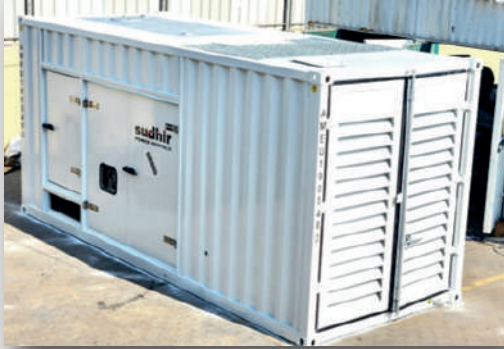
REFURBISHMENT OF ENCLOSURE WITH REMOTE RADIATOR & EXHAUST FANS