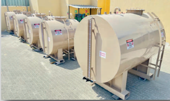
SUPPLY AND FABRICATION OF 5NOS MS CYLINDRICAL SINGLE WALL TANK. CAPACITY - 1500 GALLON & 500 GALLON

DESIGN, SUPPLY & MODIFICATION OF ISO 20 FEET CONTAINER INTO SOUND PROOFING POWERPACK 1000kVA GENSET ENCLOSURE PACKAGE Box Type Residential Grade Silencer, 3Ø Fan Control Panel, Exhaust Fans, Ventilation Fans.