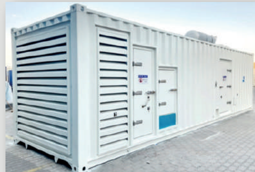
REFURBISHMENT OF 30FT ISO CONTAINER FOR CUMMINS 1000KVA GENSET