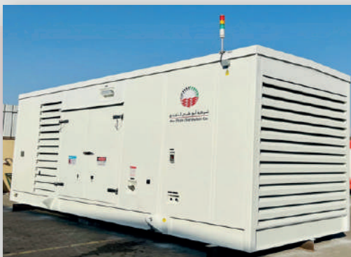
CUSTOM BUILT ENCLOSURE FOR 625KVA MARINE GENSET - NOISE LEVEL: 75dB @ 1 METER