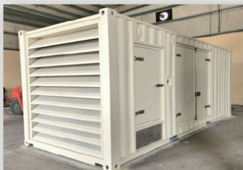
MODIFIED 20FT ISO CONTAINER TO ACHIEVE A SOUND LEVEL OF APPROX.85 DB @ 7 METER