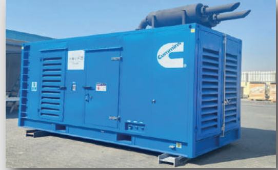
SUPPLY OF CUSTOM BUILT ENCLOSURE FOR CUMMINS C600D6 GENSET