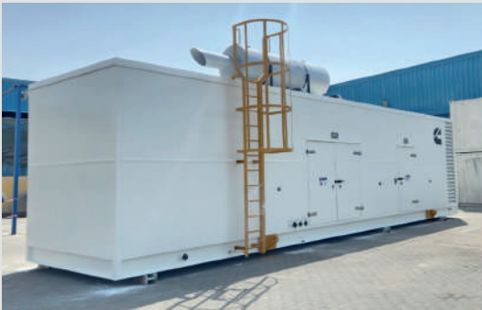
SUPPLY & INSTALLATION OF CUSTOM BUILT ENCLOSURE FOR CUMMINS C1675D5A