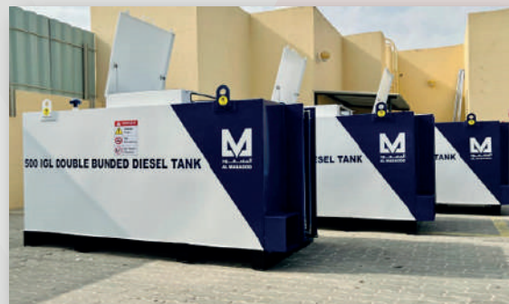
DESIGN, SUPPLY & FABRICATION OF 500G & 1000G DOUBLE WALL BUNDED TANKS