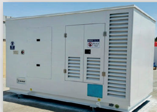
DROP OVER CANOPY FOR 1 x 638 kVA MARINE GENSET