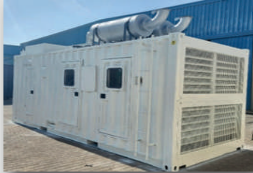
REFURBISHMENT OF ENCLOSURE WITH MUFFLER, REMOTE RADIATOR & EXHAUST FANS