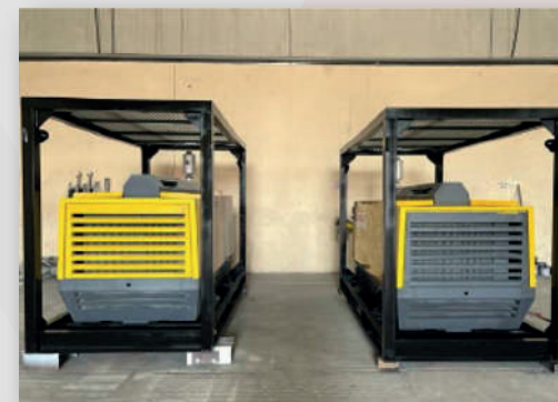
LIFTING FRAME STRUCTURE AS PER DNV STANDARD