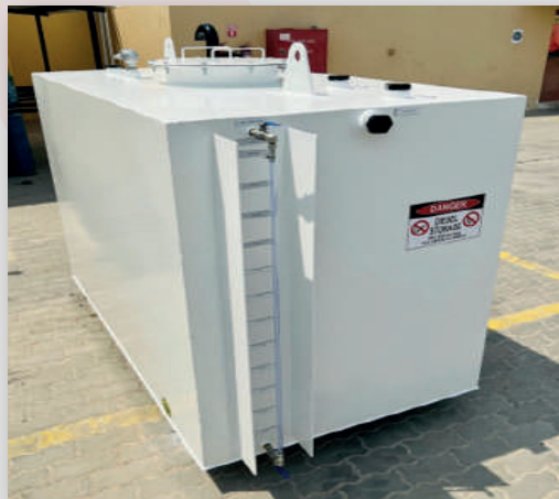
SUPPLY AND FABRICATION OF MS SINGLE WALL RECTANGULAR TANK. CAPACITY