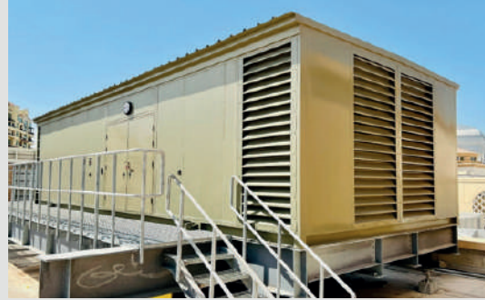
2HRS FIRE- RATED ENCLOSURE FOR KOHLER 2 x T1900 & 1 x KD1000F GENSET