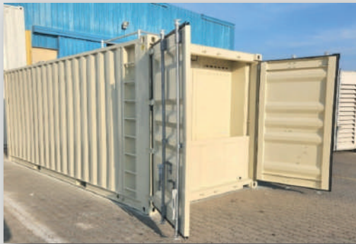
25,000 LITER DOUBLE WALL DIESEL STORAGE TANK IN MODIFIED 20FT ISO CONATINER