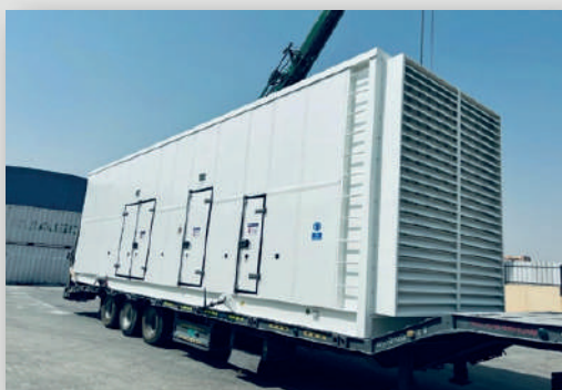
CUSTOM BUILT 40FT ENCLOSURE FOR 1500KVA GENSET; NOISE LEVEL: 75dB @ 1 METER