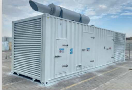
MODIFIED 40 FT ISO CONTAINER TO ACHIEVE A SOUND LEVEL OF APPROX. 75 DB @ 7 METER