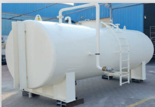
CYLINDRICAL TYPE -12,000 LITRE BULK DIESEL STOARGE TANK