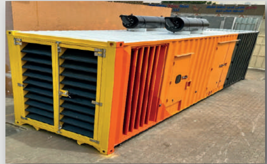
30Ft MODIFIED ISO CONTAINER FOR 1600KVA_KTA50_G3 Genset