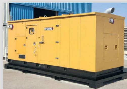
MODIFIED CANOPY WITH BASE FUEL TANK, DIP DRAY, BREAKER PANEL & 2 POINT LIFTING