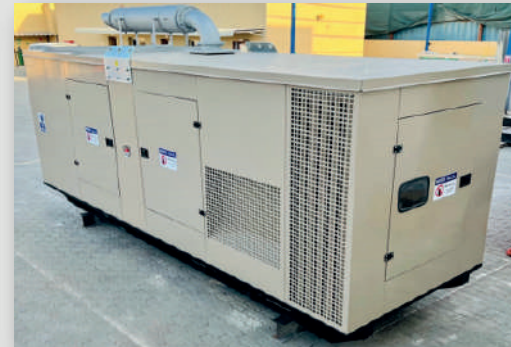
DESIGN, SUPPLY & MANUFACTURING OF SOUND PROOFING GENSET ENCLOSURE PACKAGE, HOUSING A #CATERPILLAR_C18 - 770 KVA