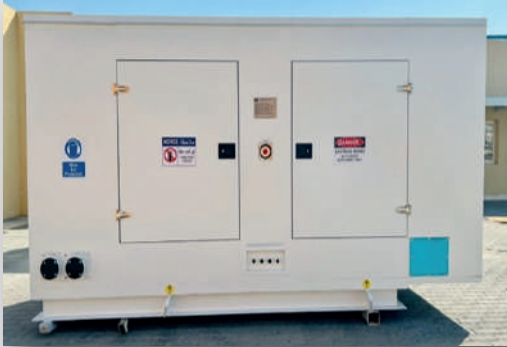
DROP OVER CANOPY WITH HEAT EXCHANGER FOR 2 x 638 kVA MARINE GENSET