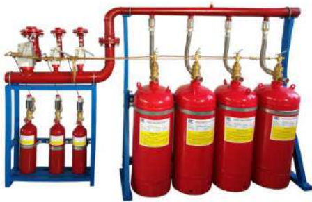
FM 200 SYSTEM