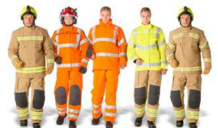
PPE COVERALL & EQUIPMENTS