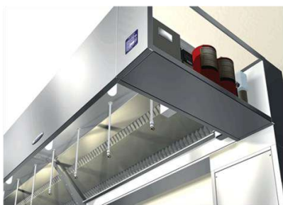
KITCHEN HOOD SUPPRESSION