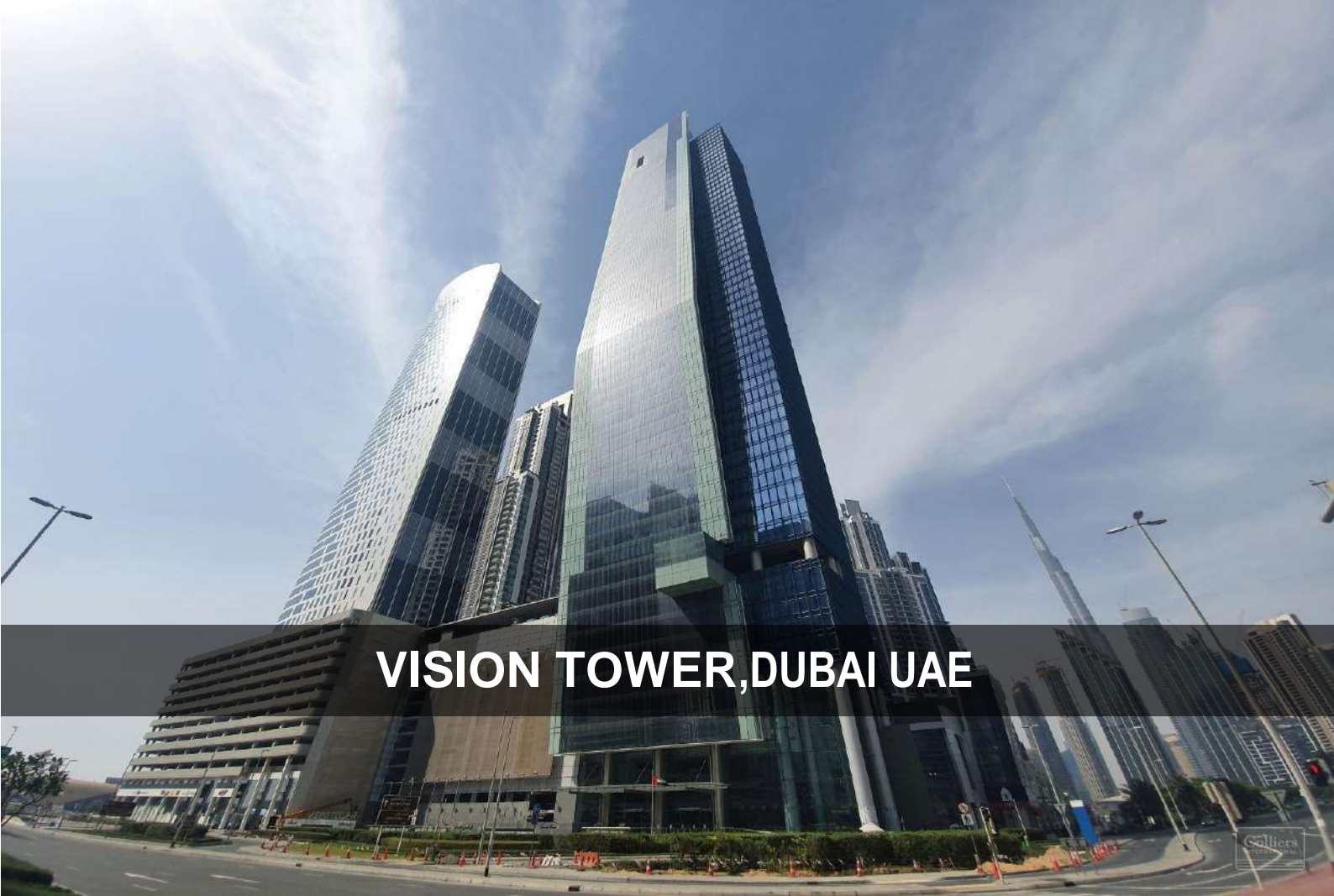
VISION TOWER, DUBAI UAE