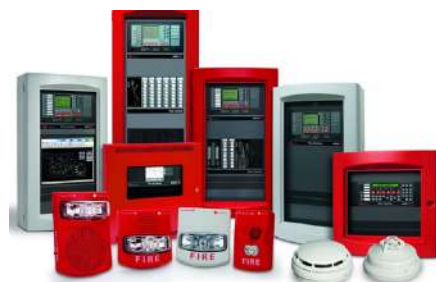
FIRE ALARMS SYSTEMS