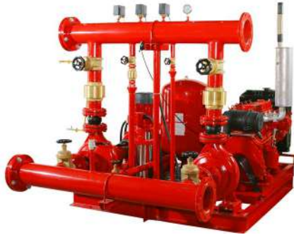
FIRE PROTECTION PUMPS