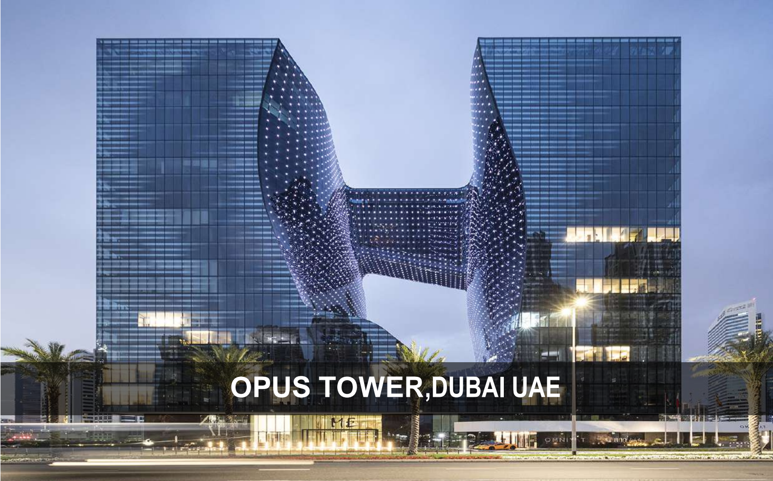
OPUS TOWER, DUBAI UAE