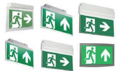
EMERGENCY EXIT SYSTEM