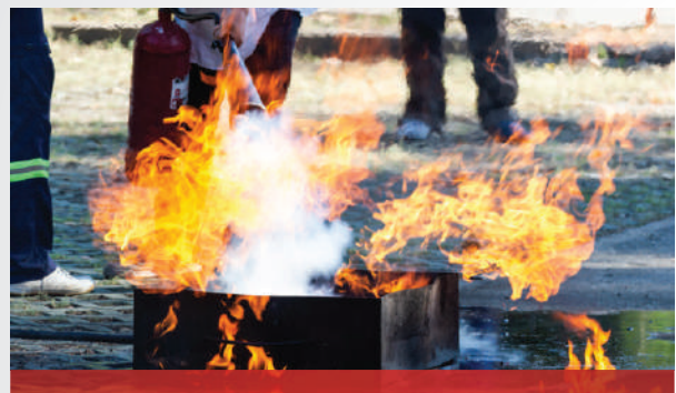
Fire Fighting Equipment Trianing