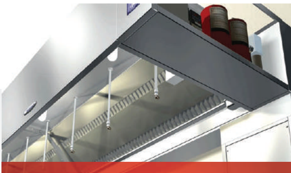
Kitchen Hood System