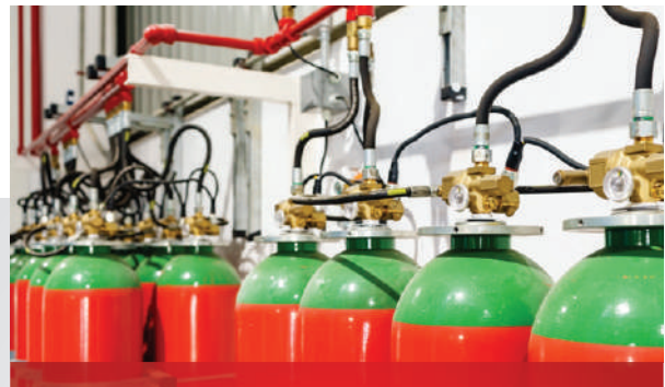
Fire Suppression System