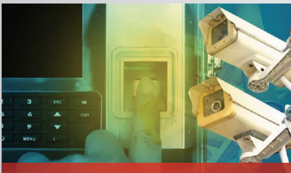
Smatv, Structured Cabling, CCTV & Access Control System