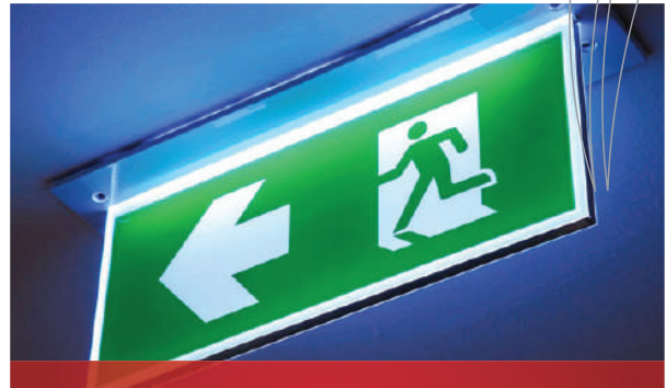
Emergency Lighting System