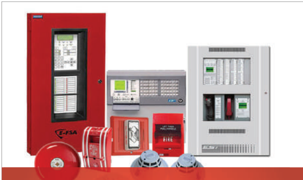
Fire Detection, Alarm and Voice Evacuation System