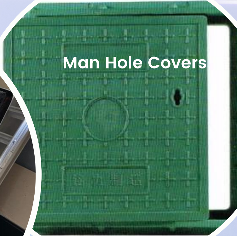
Man Hole Covers