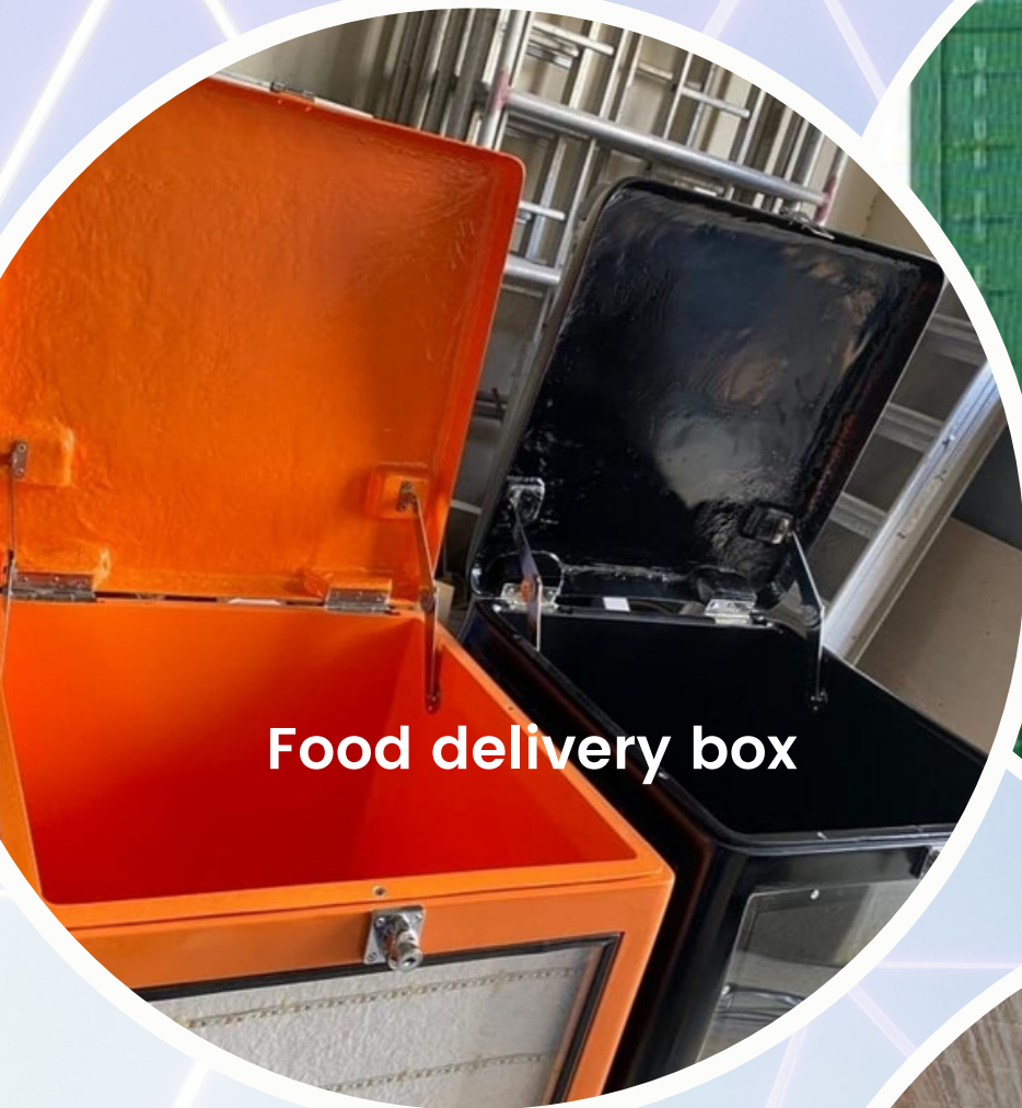
Food delivery box