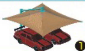
UMBRELLA TYPE CAR PARKING SHADE