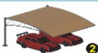
BAKU TYPE CAR PARKING SHADE