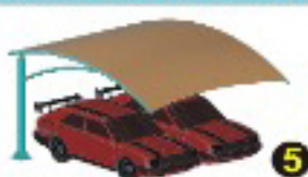
SINGLE SUPPORT BAKU TYPE CAR PARKING SHADE