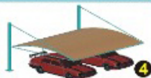
HANGING CANTILEVER TYPE CAR PARKING SHADE