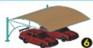
HANGING BAKU TYPE CAR PARKING SHADE