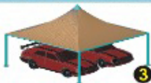
4 POLES PYRAMID TYPE CAR PARKING SHADE