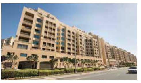
Golden Mile, Palm Jumeirah