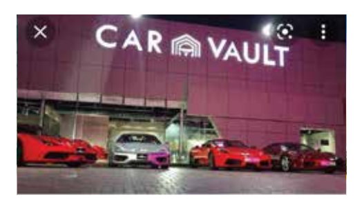
Car Vault, Dubai