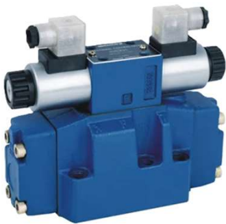
Sub Plate Valve