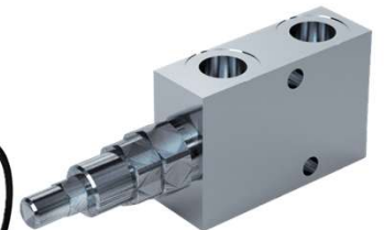
Line Mounted Valves