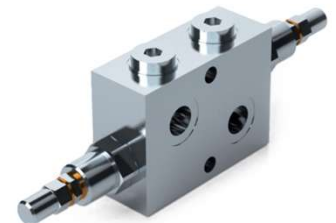
Cross Port Relief