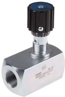
Flow Control Valve