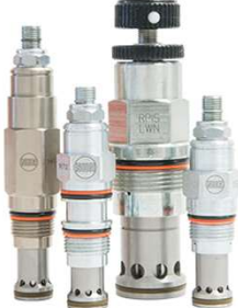
SUN Cartridge Valve