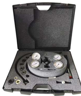
N2 Charging Kit