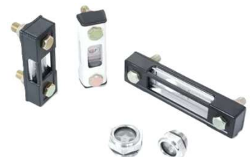
Oil Level Gauge