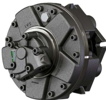
Radial Piston Motor