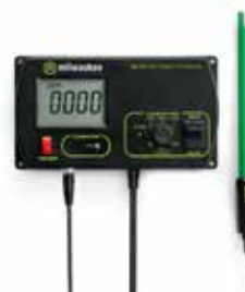
Online ORP Meter