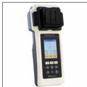
Pool Lab 2.0