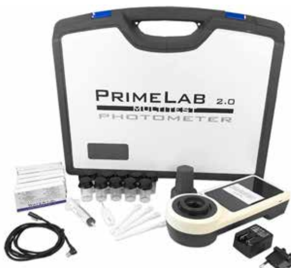
Prime Lab 2.0 With Accessories