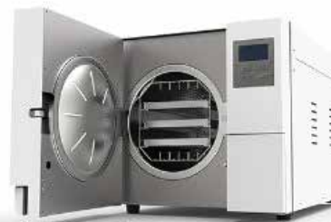
Autoclave (Table Top)