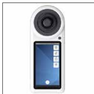
Prime Lab 2.0