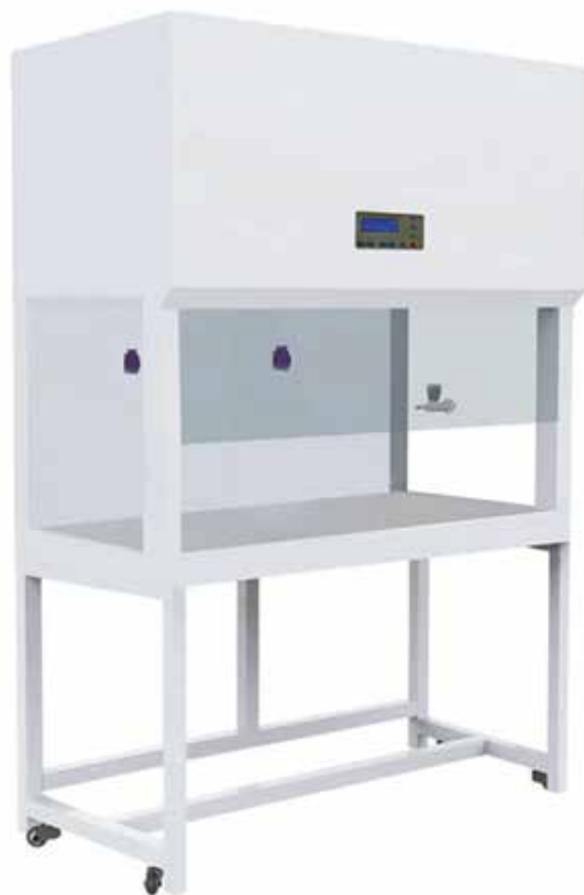
Laminar Air Flow