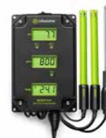
Online pH/TDS Meter