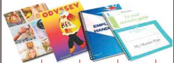
Saddle Stitched Perfect Bound Spiral Bound Wire-O Bound