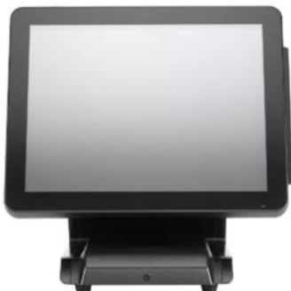
E-POS Xtreme II

15" Touch Terminal – Ivy Bridge i3-3220 3.3 GHz dual-core 4G, NO SSD, PCAP UK DDR 3 memory supports up to 16GB, Internal 2.5" type SATA HDD x 1, Second HDD (option) Convenient wall mount and wide tilt angle. Splash and dust resistant front bezel, IP66.