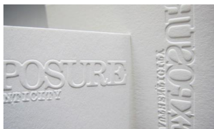
Embossed & Debossed