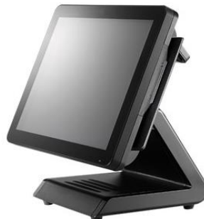
E-POS Xtreme II V2

15" Touch Terminal – Ivy Bridge i3-3220 3.3 GHz dual-core 4G, NO SSD, PCAP UK DDR 3 memory supports up to 16GB, Internal 2.5" type SATA HDD x 1, Second HDD (option) Convenient wall mount and wide tilt angle. Splash and dust resistant front bezel, IP66.