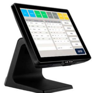
E-POS Xtreme Turbo V2

CPU: Intel® Core™ i5-4210U 1.70 GHz up to 2.70 GHz, 3M Cache Memory: 4GB DDR3L 1333/1600MHz Optional up to 16GB, 2 x Slot (Standard 4 GB RAM) Storage: M.2 SSD Options: 128GB / 256GB / 500GB Graphics: Intel® HD Graphics Display: 15" Active TFT color LCD, resolution 1024 x 768, brightness 350cd/m 2 , LED backlight