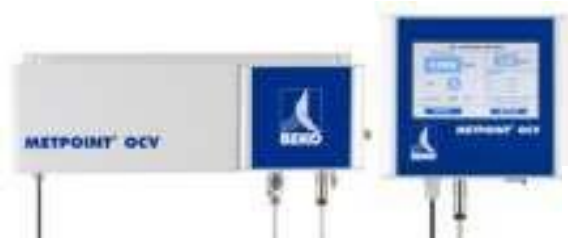
TÜV-certified online system for the measurement of oil vapours