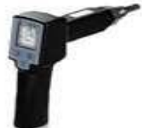
Dew point measuring devices