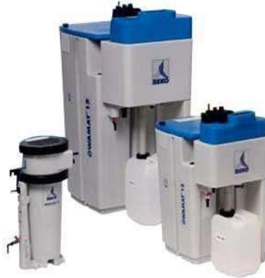
OWAMAT Oil Water Separators