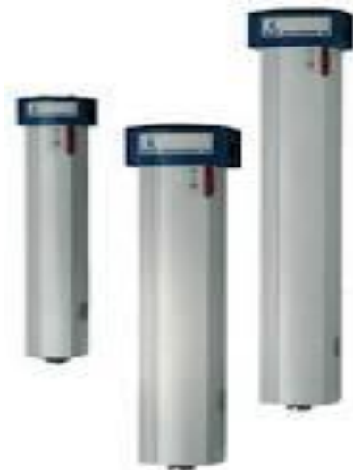
Drypoint® Membrane Air Dryers