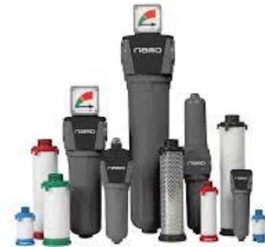
F1-5 industrial filters