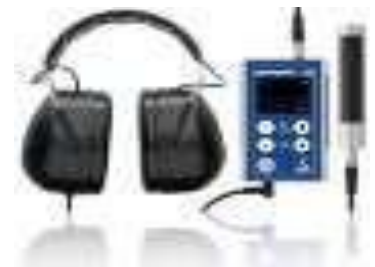
leak detector detects every leak. Precisely and quickly