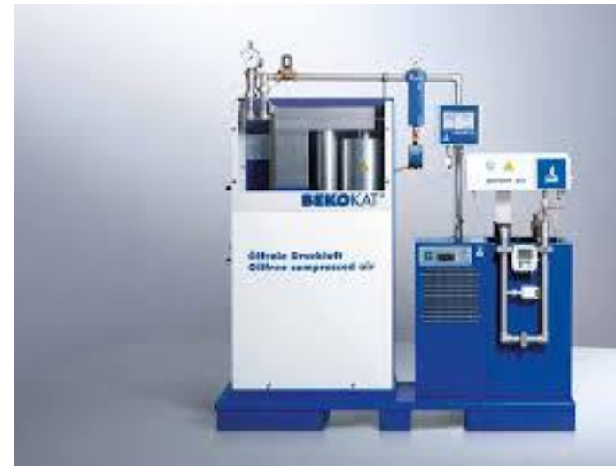
BEKOKAT® OILFREE SYSTEM

known for compressed air technology "at its best". For more than two decades, BEKO has developed, manufactured and sold high-quality, reliable and efficient components & systems for compressed air processing & condensate technology.