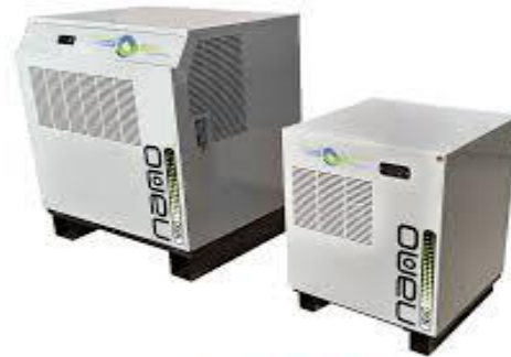
R1-R4 refrigeration dryers