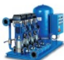
CHILLED WATER PUMPS