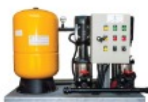
BOOSTER PUMP SET