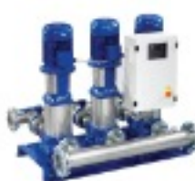
TRANSFER PUMP SET