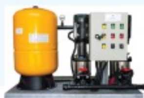
BOOSTER PUMP SET