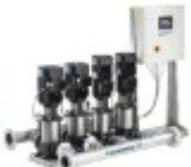
CONTROL PANEL FOR WATER PUMPING SYSTEM (VFD)