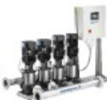
CONTROL PANEL FOR WATER PUMPING SYSTEM(VFD)