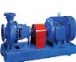
CHILLED WATER PUMPS