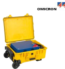
CP CR 600